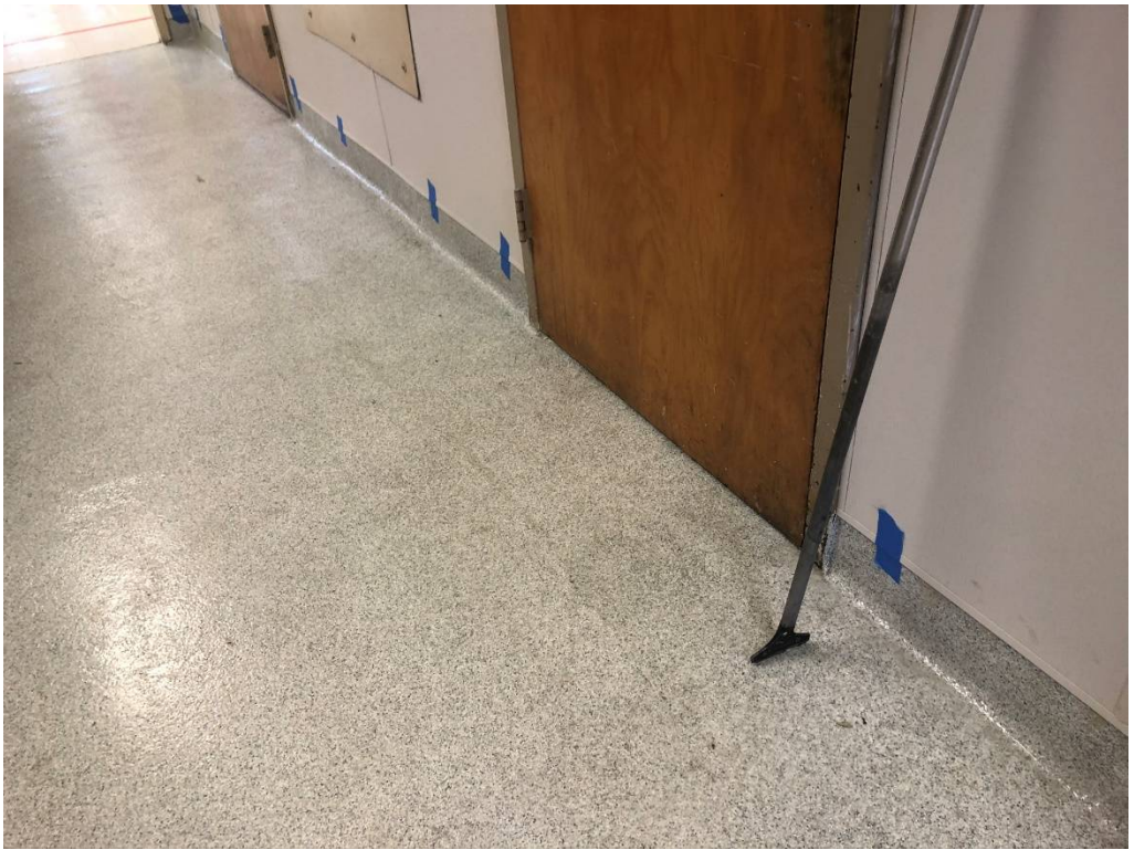
Figure 3 – Tape on FRP from install