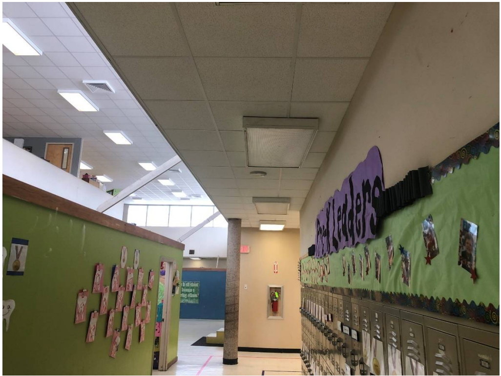
Figure 1 – Crooked Lights in Corridor Near Room RM 110