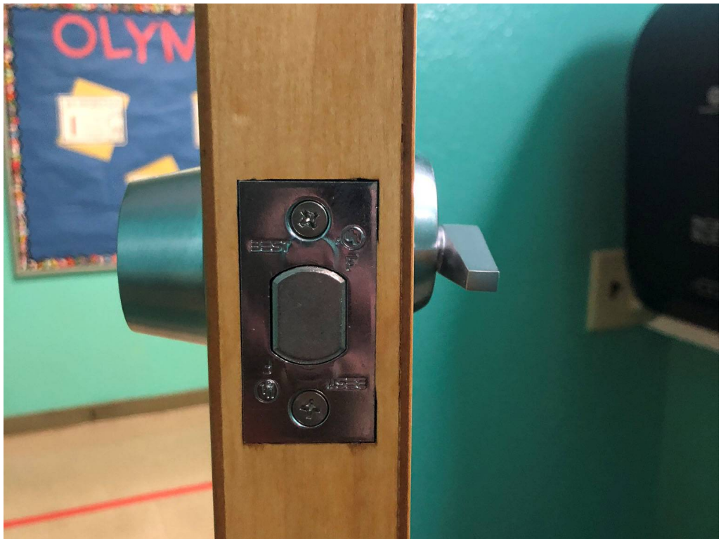
Figure 2 – Typical Latch Set