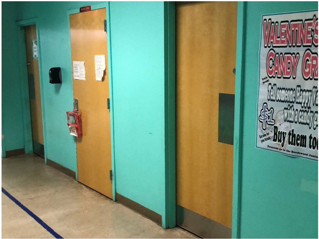
Figure 1 – New Doors & Hardware