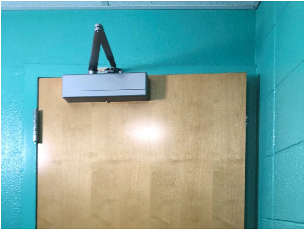
Figure 3 – New Closers