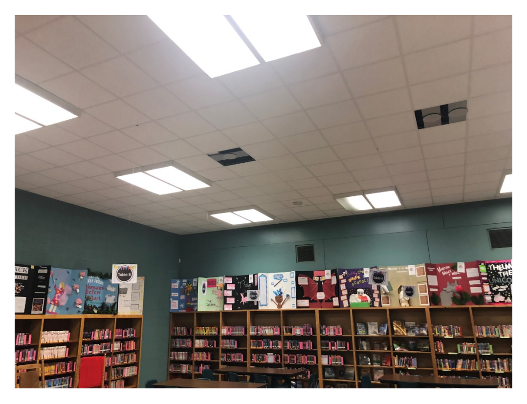
Figure 1 – Library Ceiling Installed