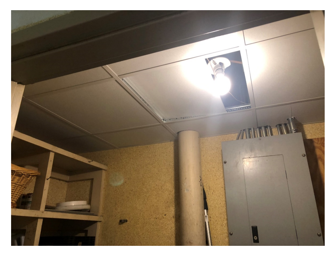
Figure 4 – Building 1 Janitor's Closet Ceiling