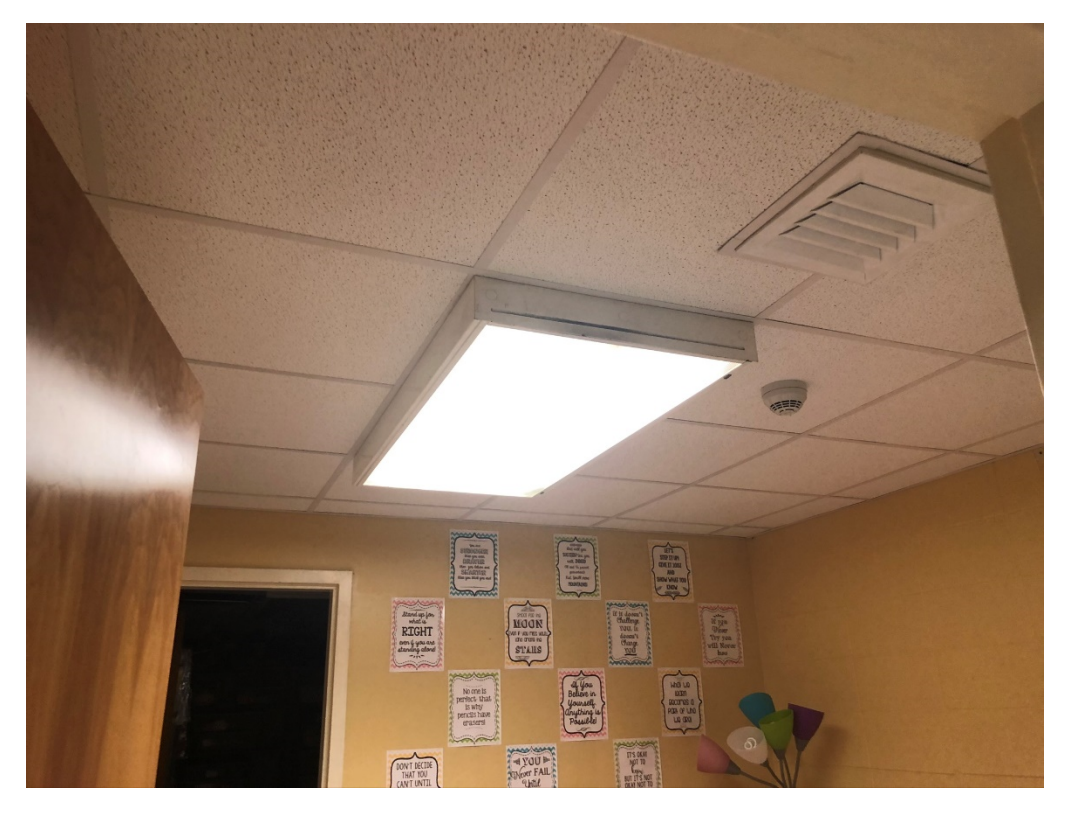
Figure 2 – Library Auxiliary Room