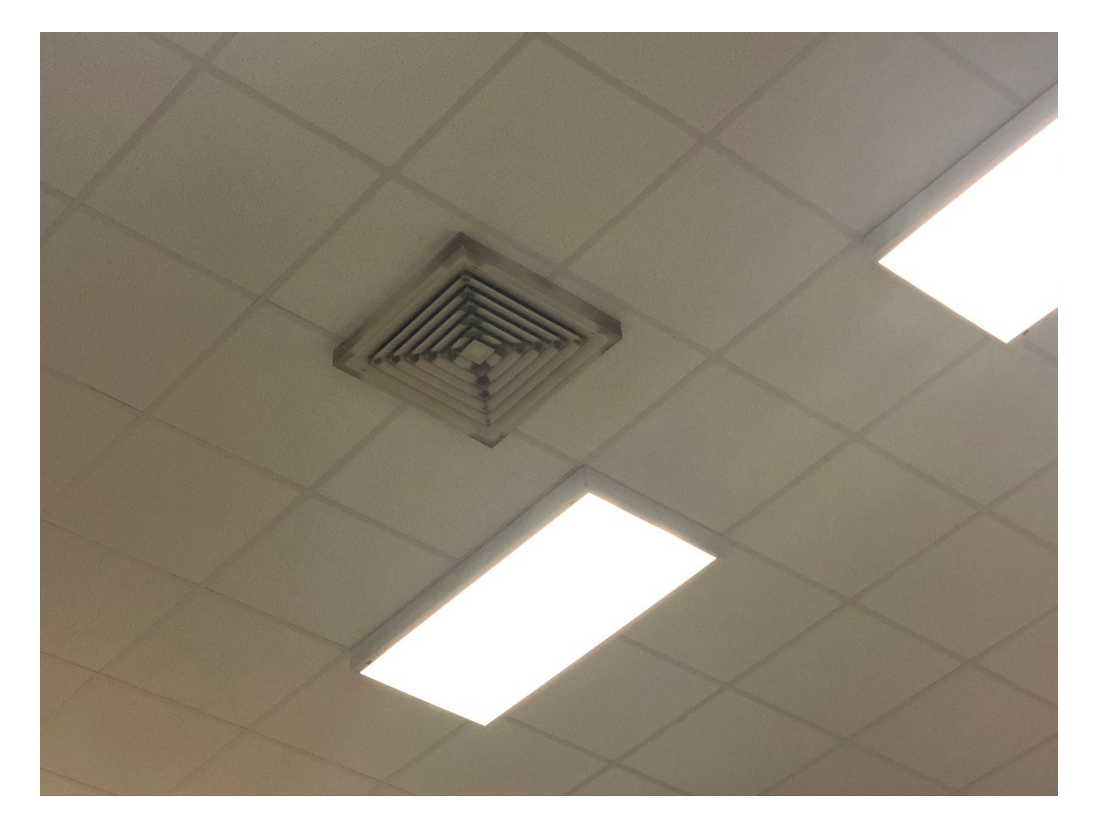
Figure 5 – High Ceiling Vents in Building 1