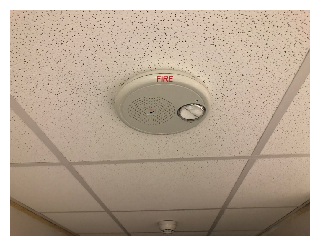
Figure 8 – Fire Alarm Installed in Vestibule Building 3