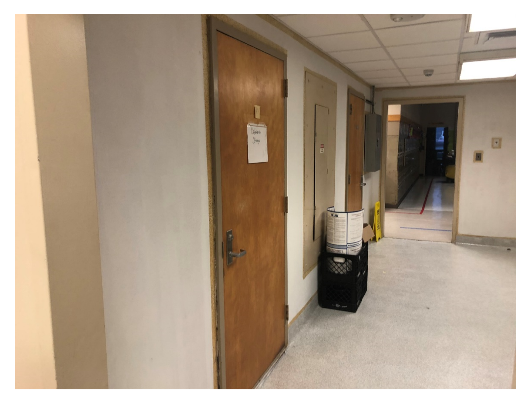
Figure 3 – Primed Panels to Received FRP @ Building 1 Vestibule