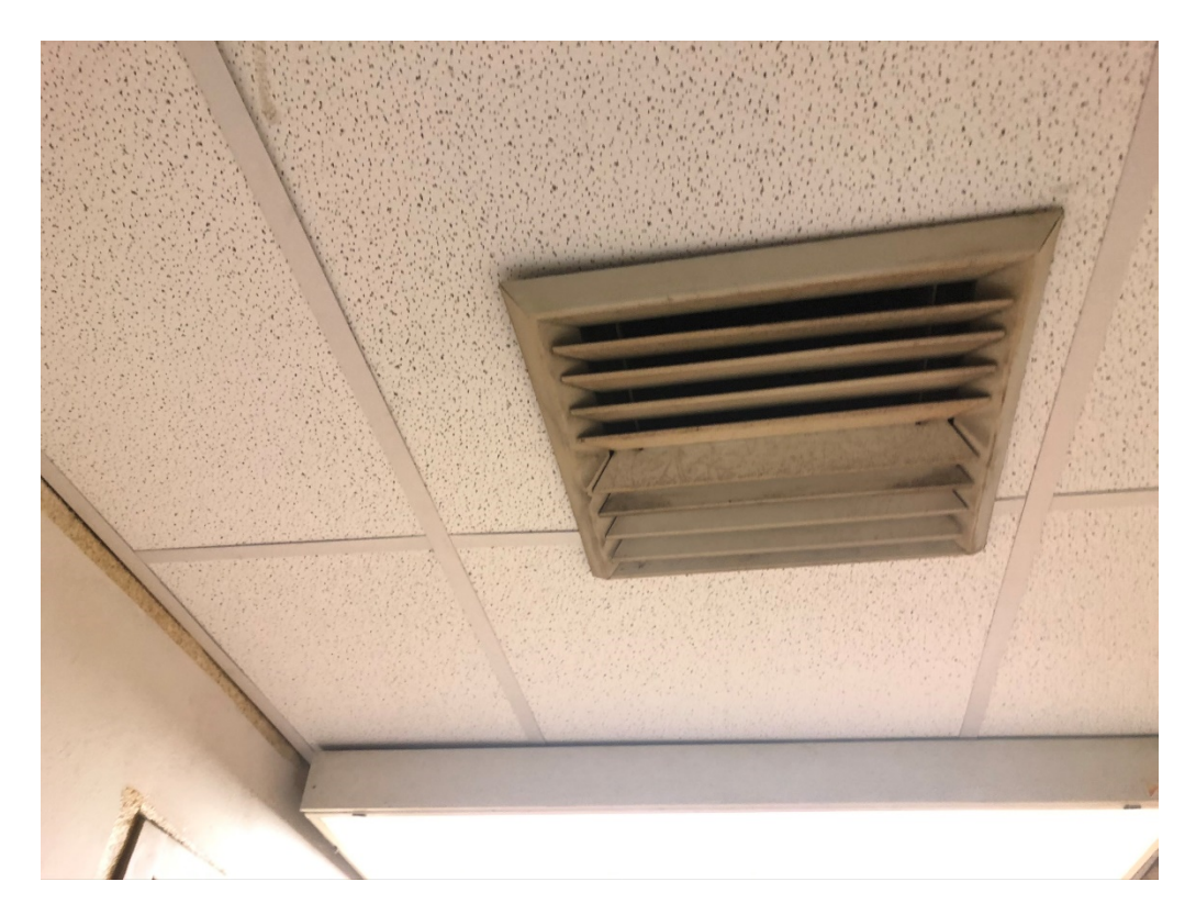
Figure 9 – Some Vents still to Paint