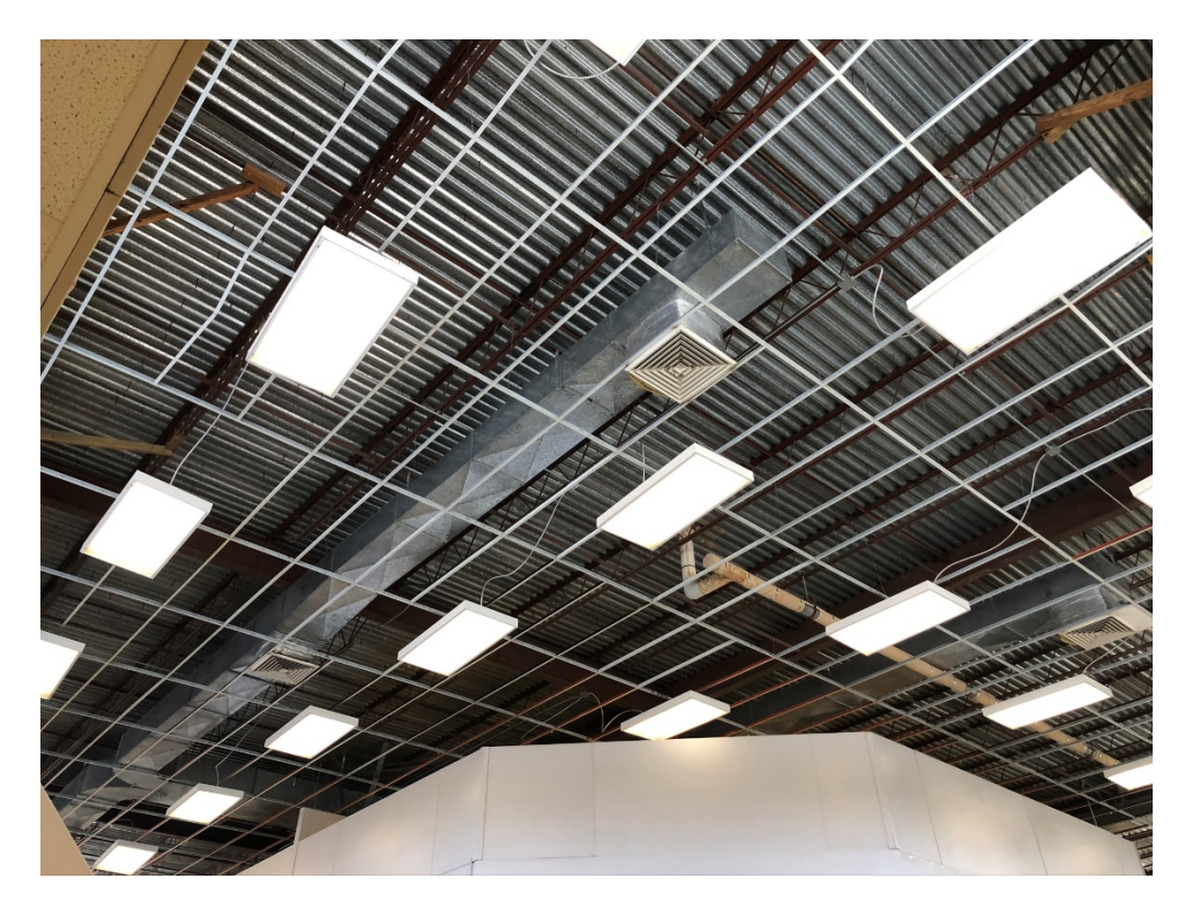
Figure 2 – Building 3 Corridor