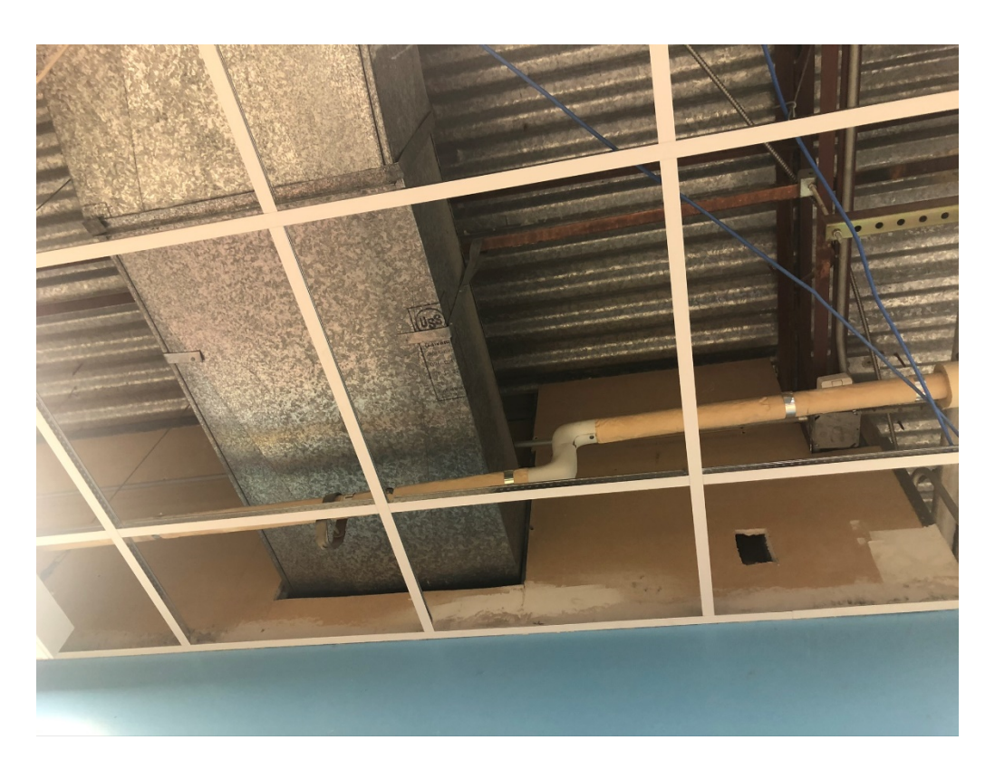
Figure 7 – Pipe Hanger Not In use