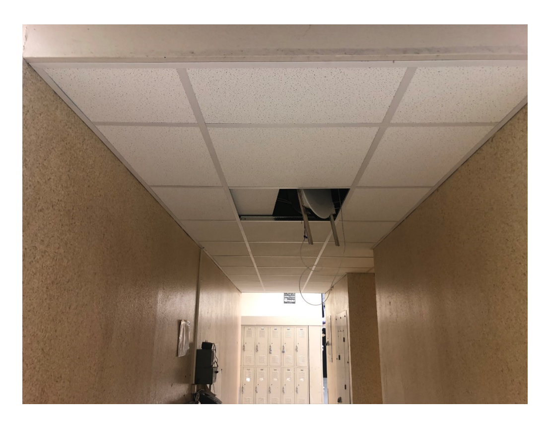
Figure 1 – Building 3 Hall