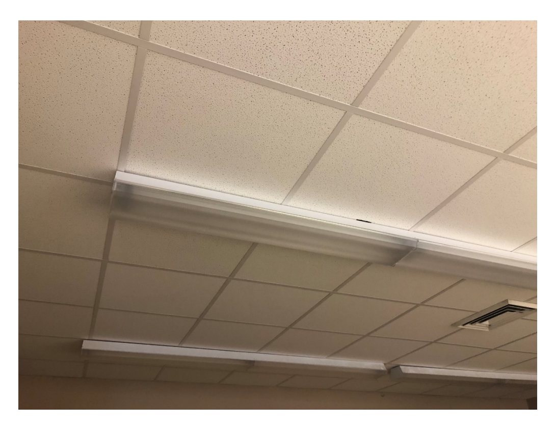
Figure 3 – Building 3 Cafeteria Notch Showing @ Light