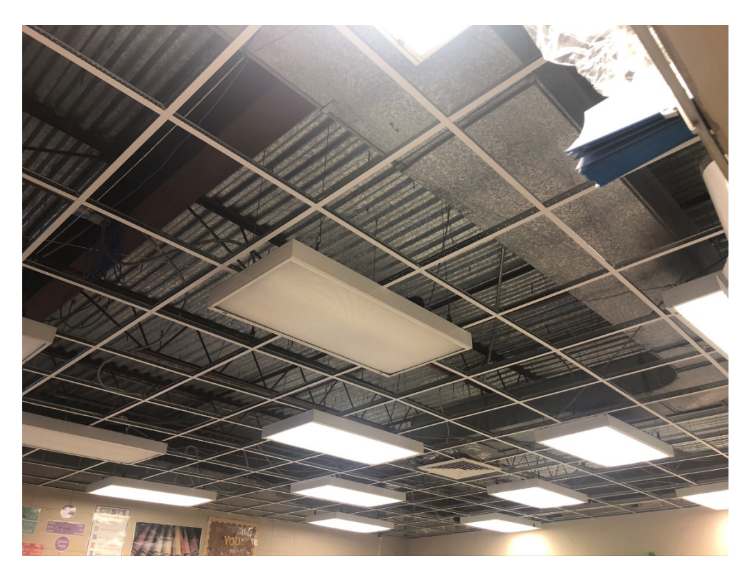
Figure 6 – Typical Grid Put Back Building 3