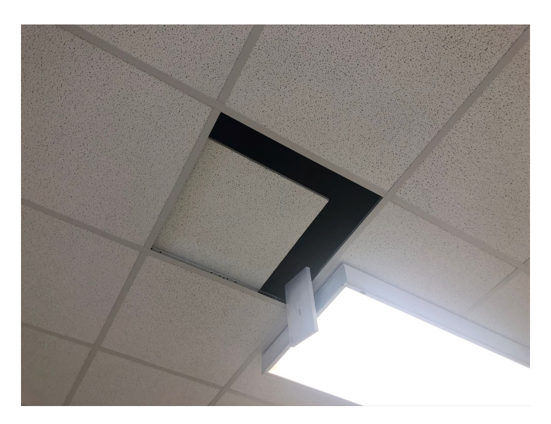
Figure 5 – Building 3 Cisco Router (What's the plan here?)