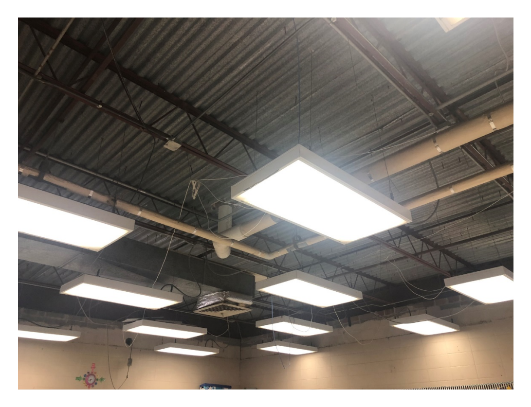
Figure 8 – Typical Demo in Building 3