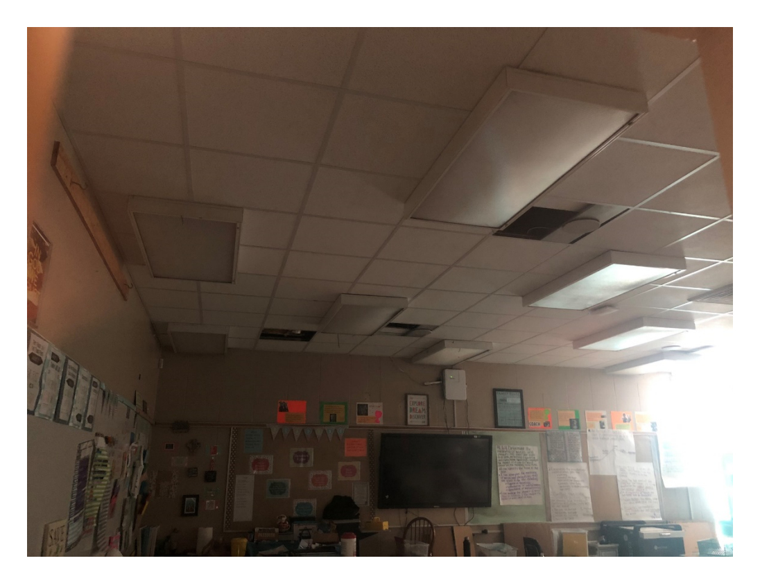
Figure 9 – Typical Finished Ceiling in Building 3