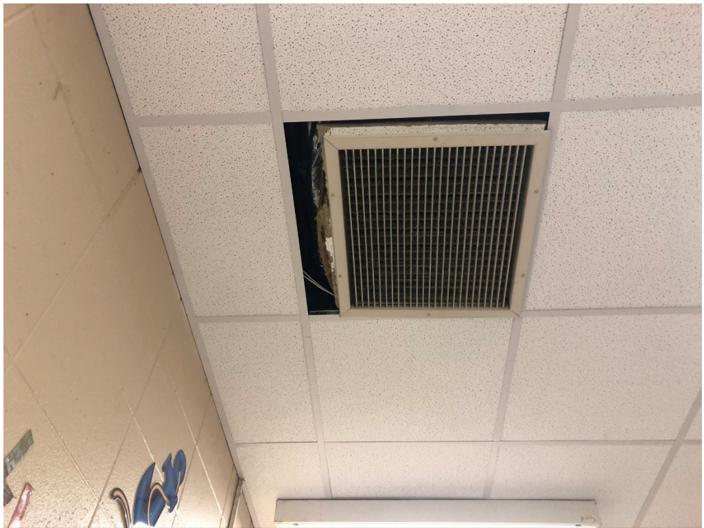
Figure 10 – Vent Awaiting New Tile Surround