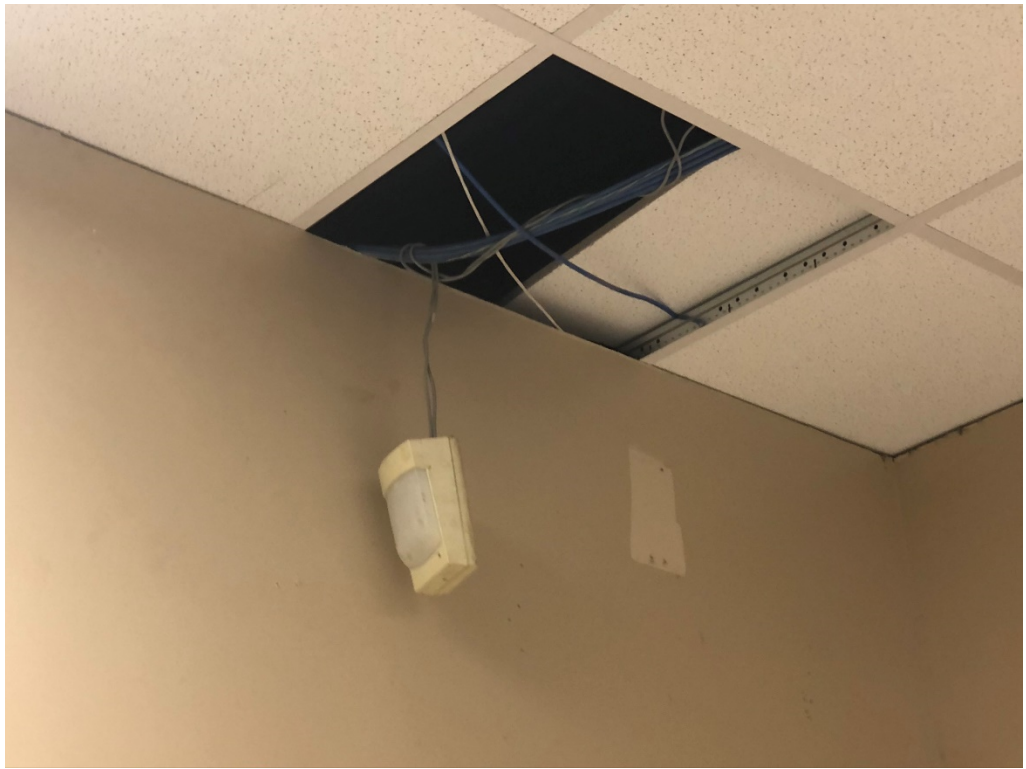
Figure 5 – Confirm what is issue with this not installed in Building 1 Corridor North Corner