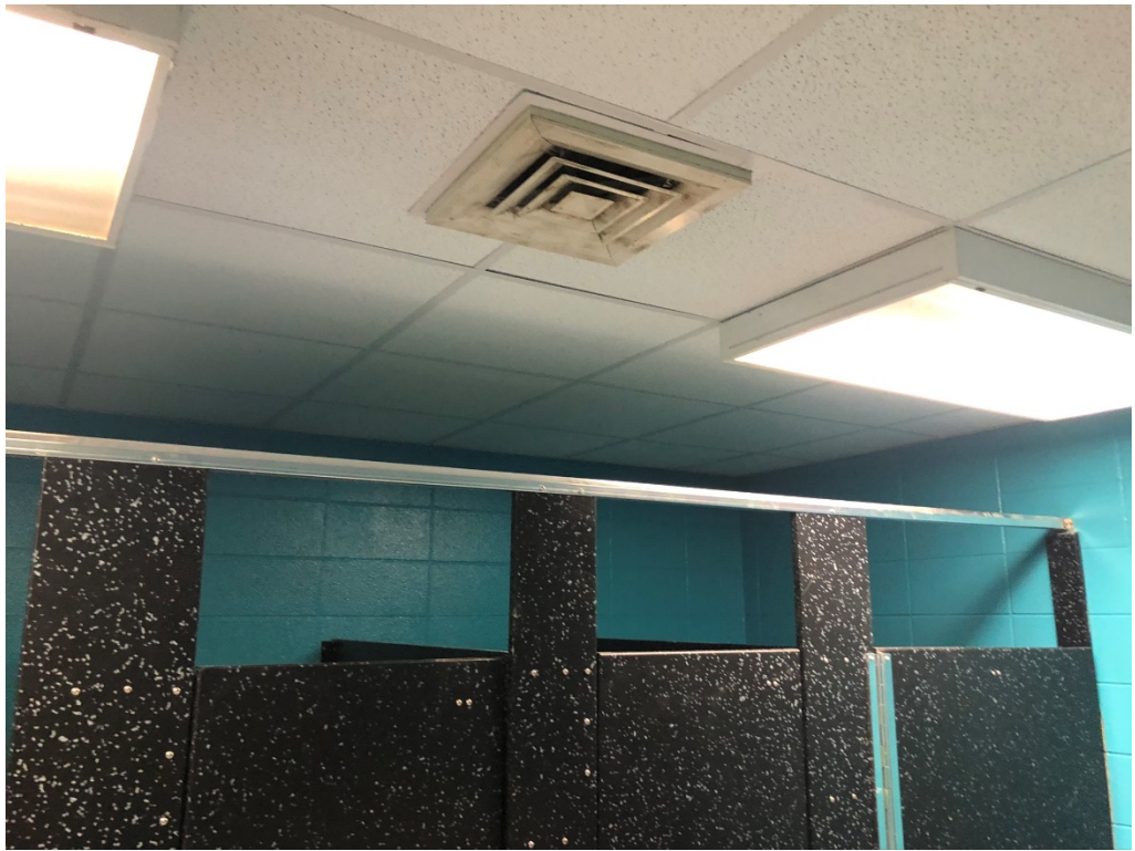
Figure 1 – Building 1 Bathrooms Completed