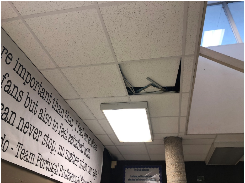
Figure 7 – Confirm when existing speaker shall be installed to tile