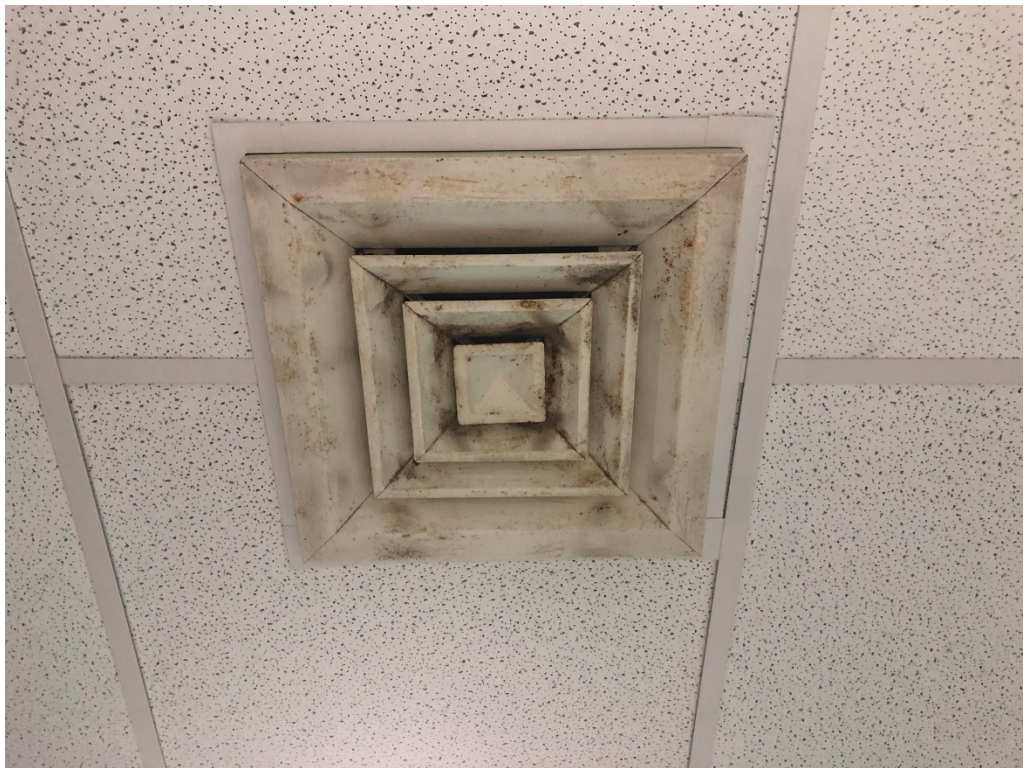
Figure 2 – Confirm Timeline on Clean and Repaint of vents