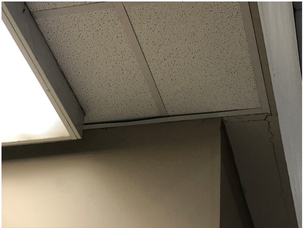
Figure 12 – Deformed Corner NW Side Corridor Building 3