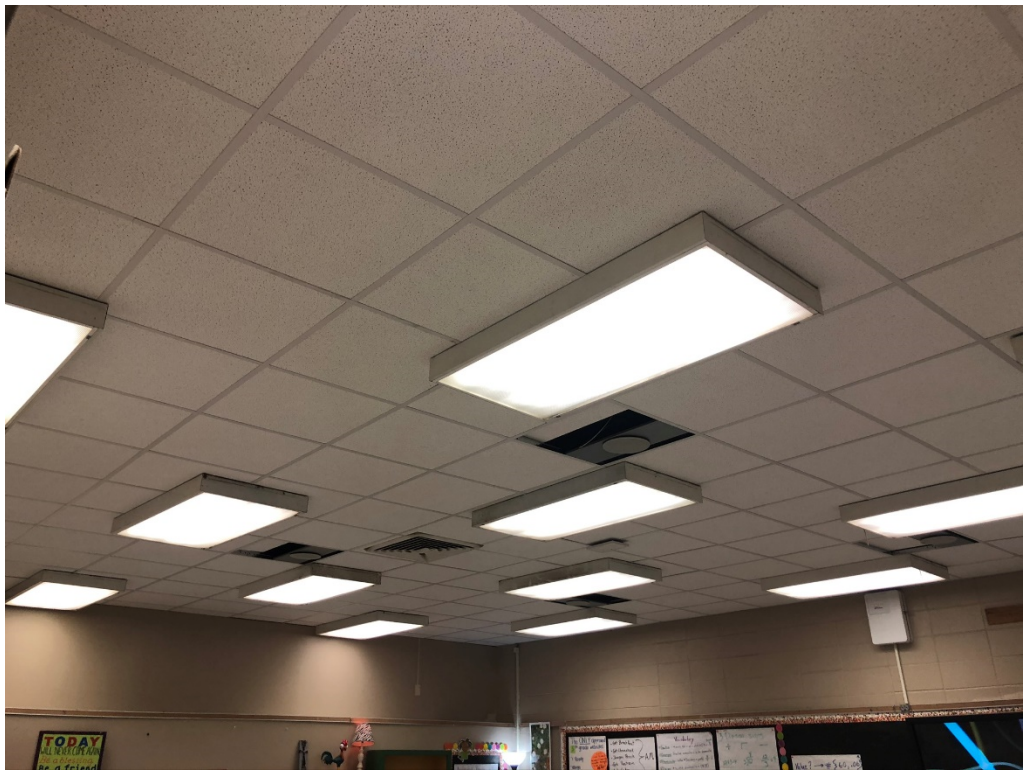
Figure 8 – Building 3 Reinstallation (Typical)