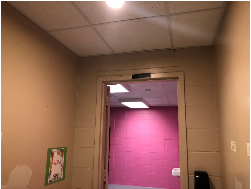
Figure 3 – Building 1 Bathroom