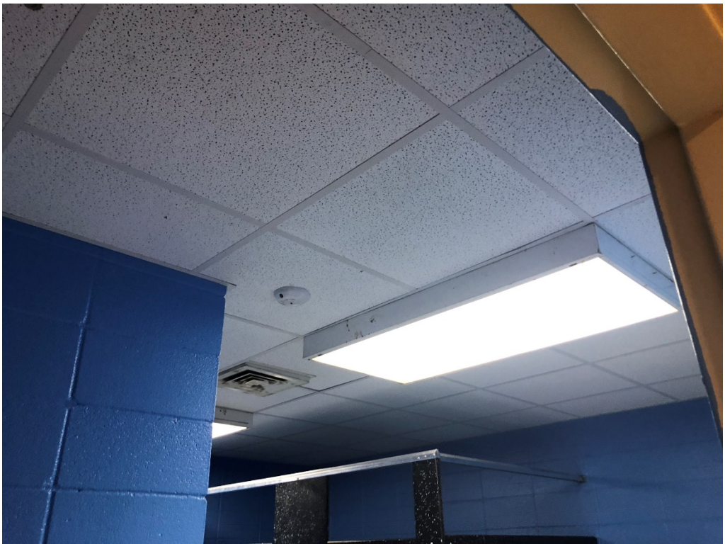
Figure 4 – Building 1 Bathroom