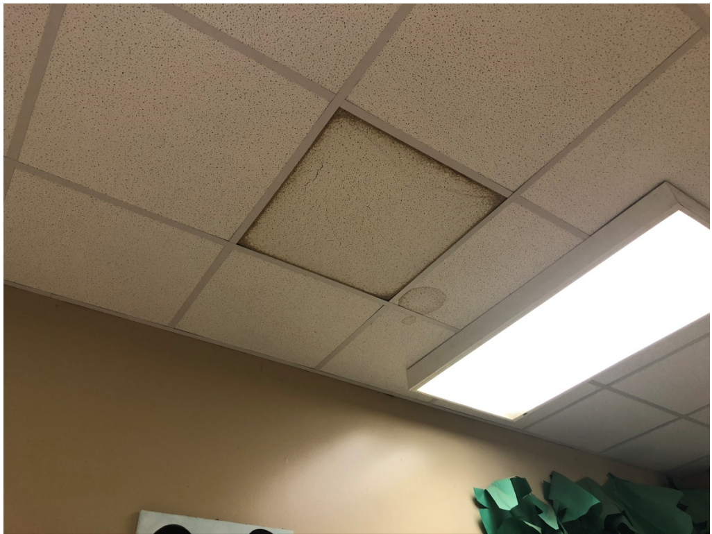
Figure 6 – Building 1 North Entry Water Damage