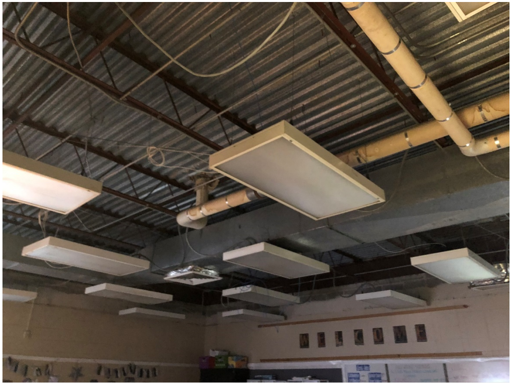
Figure 9 – Building 3 Demolition (Typical)