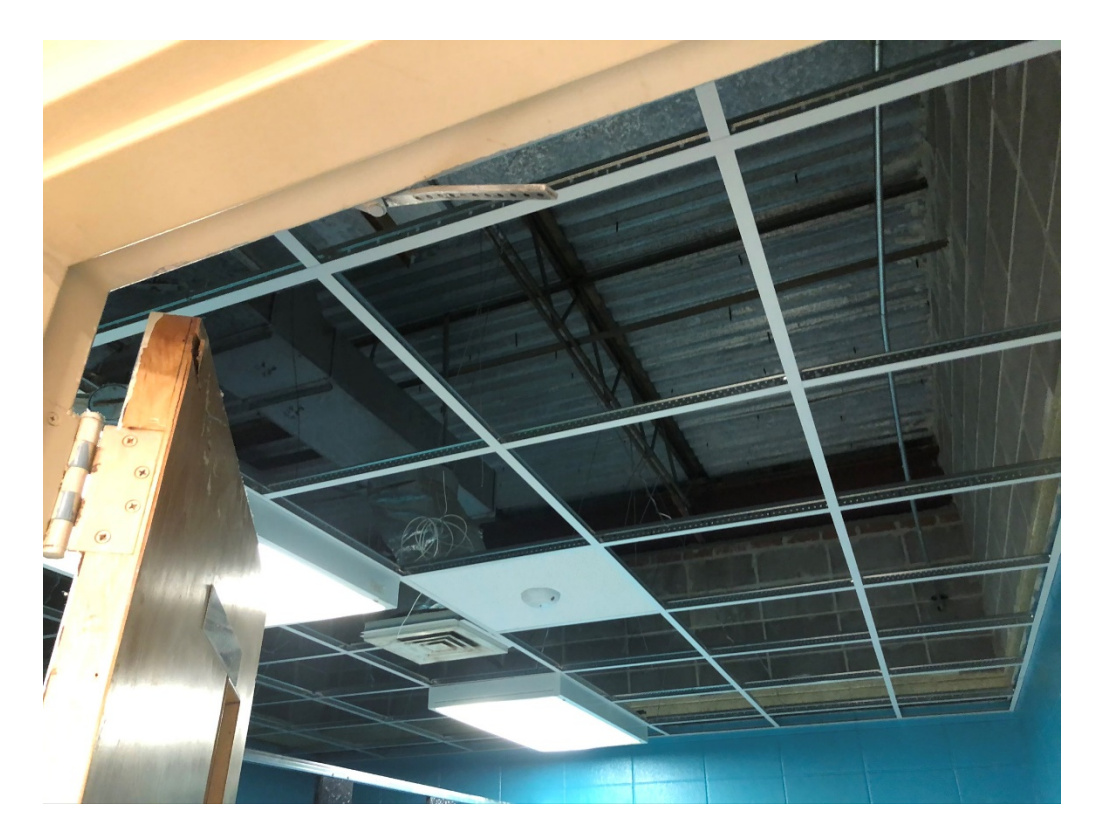
Figure 1 – Grid in Restrooms