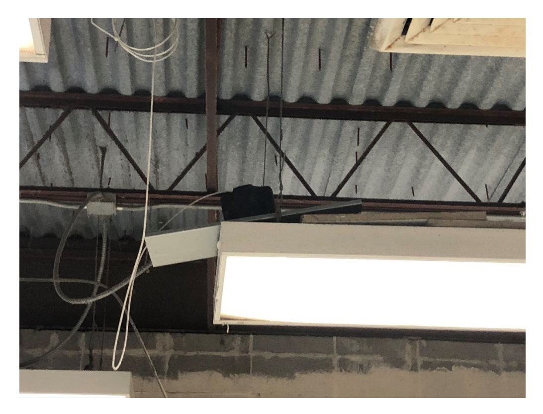
Figure 5 – Speakers Exist Prior to Reinstallation of Grid & Tile