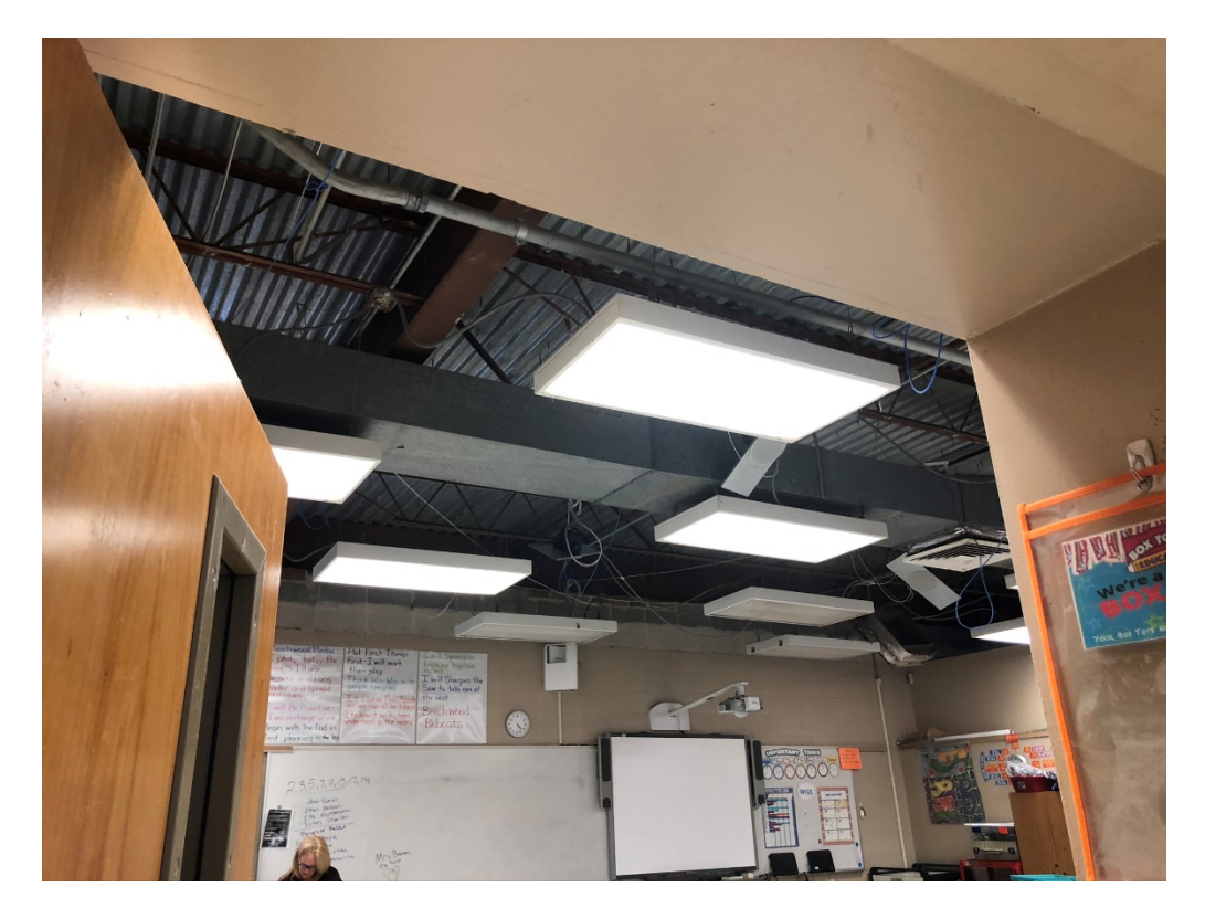
Figure 3 – Building 3 Demo