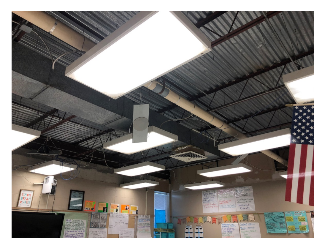
Figure 2 – Note Speakers are Pre-existing Condition