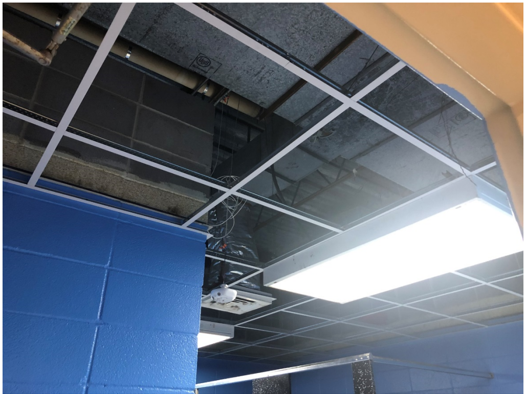
Figure 4 – New Grid Bathrooms