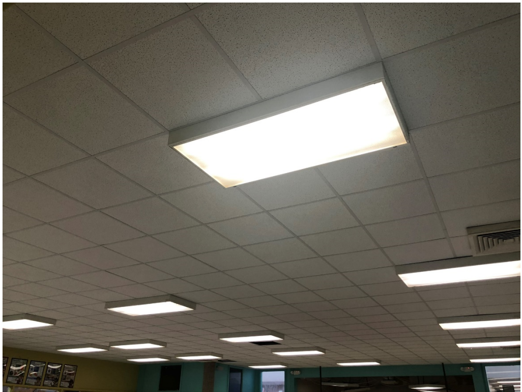
Figure 2 – New Tile In Dining