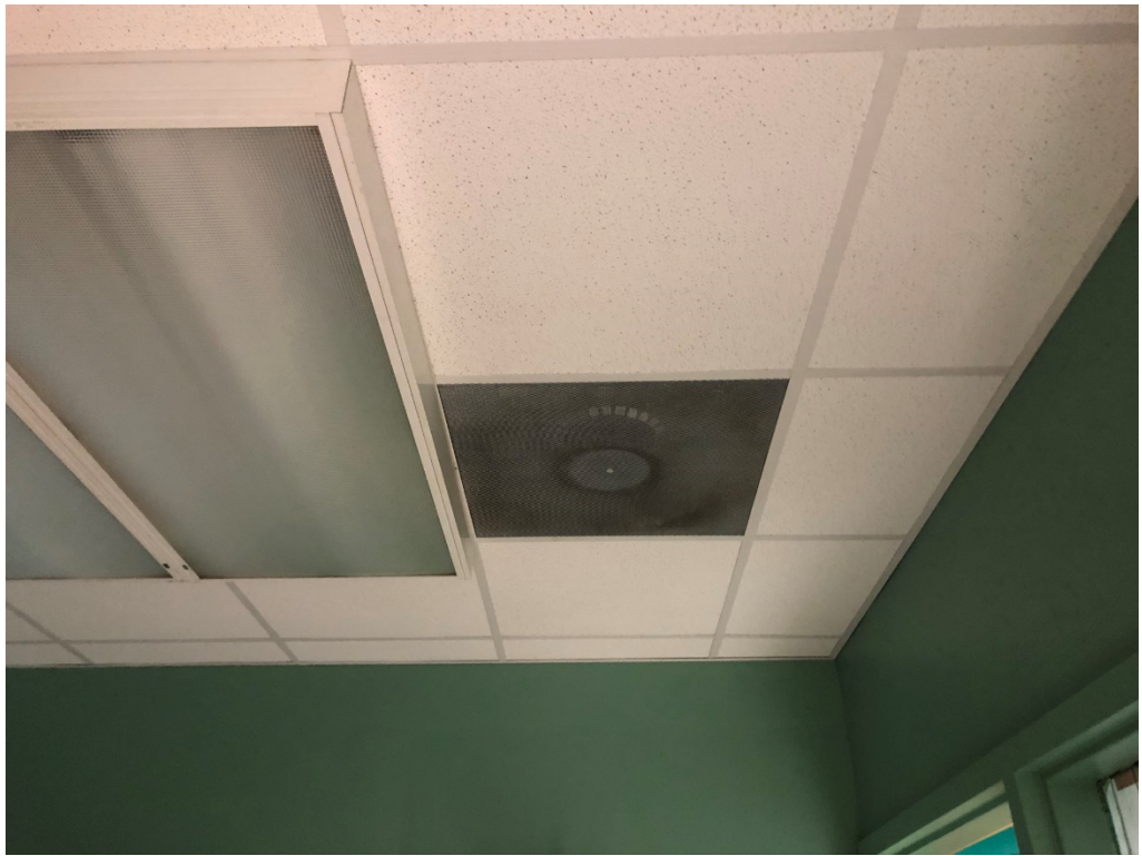
Figure 1 – Admin Space New Grid