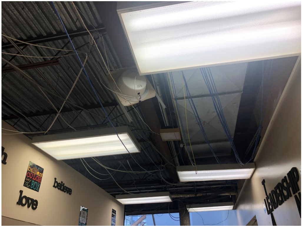
Figure 5 – Building 3 Corridor Demo