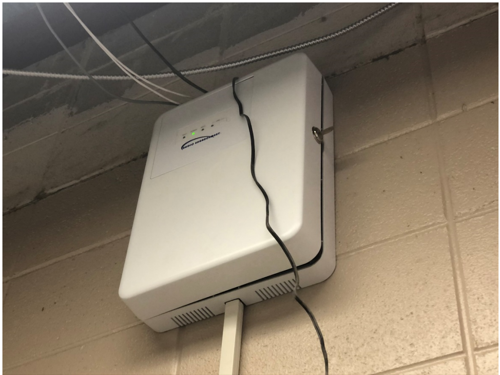
Figure 8 – Audio Equipment in Room (with demo) nearest Intercom (within 50ft)