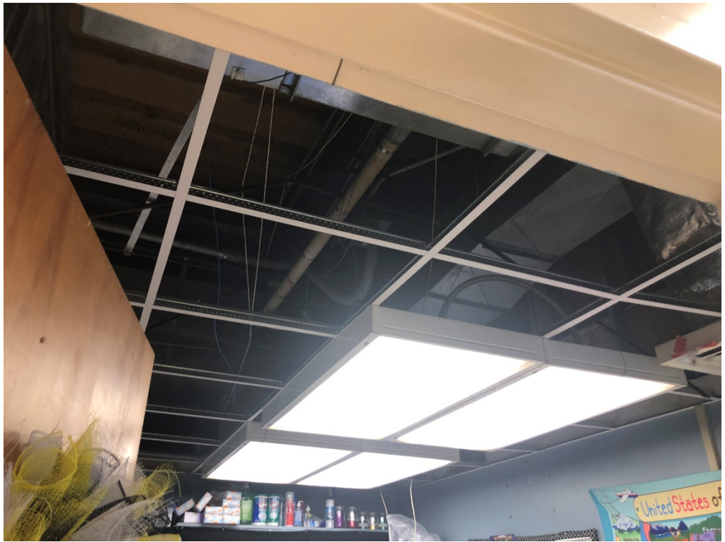
Figure 3 – New Grid Admin Space