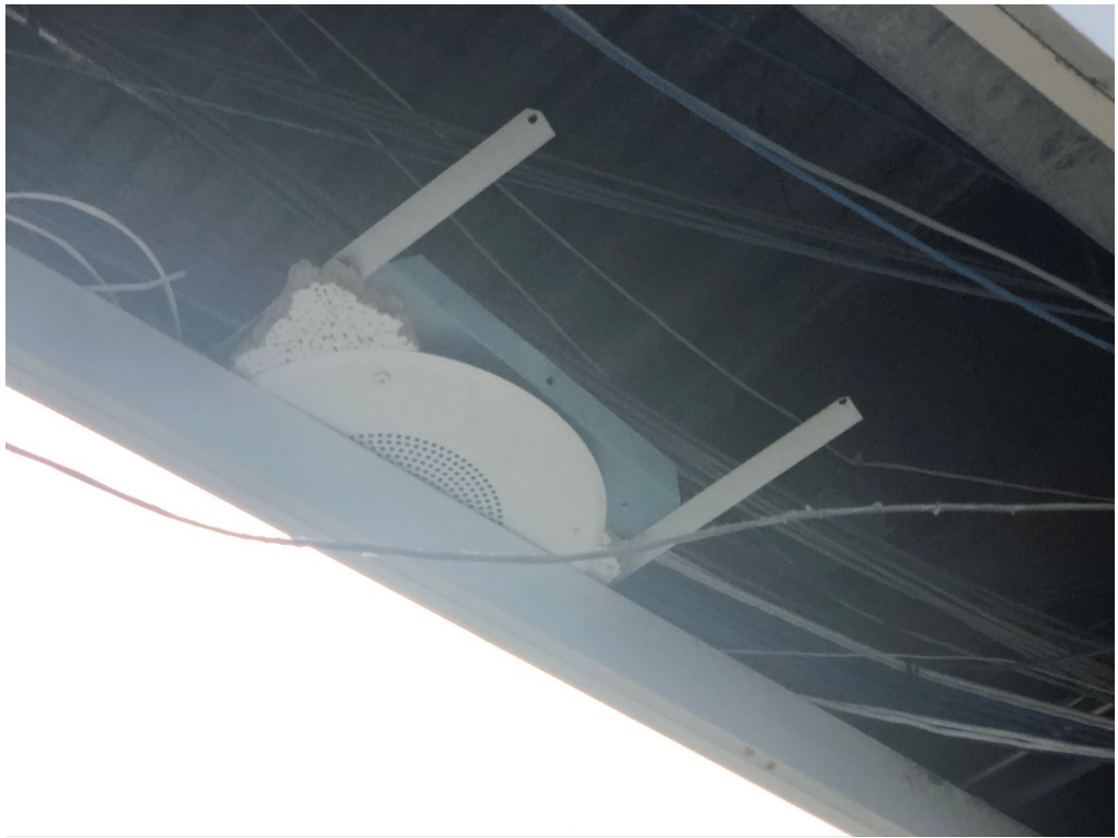
Figure 7 – Speaker Temporary Placement