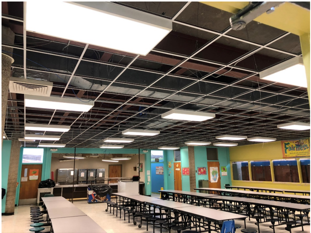
Figure 6 – Demo and Put Back at Dining 117