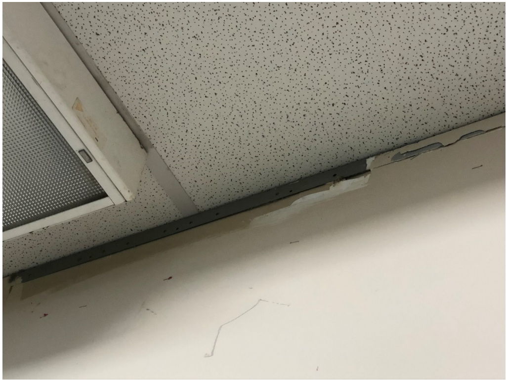
Figure 11 – Drywall Damage at Upper Wall Corridor 127