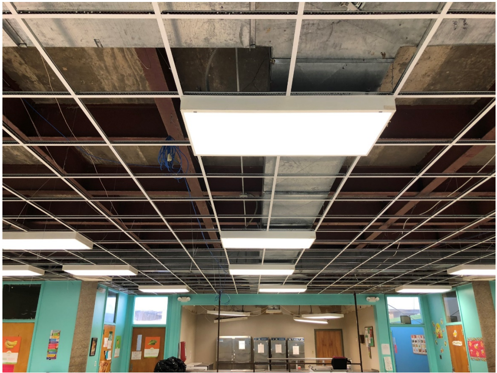
Figure 7 – Properly Aligned Lighting