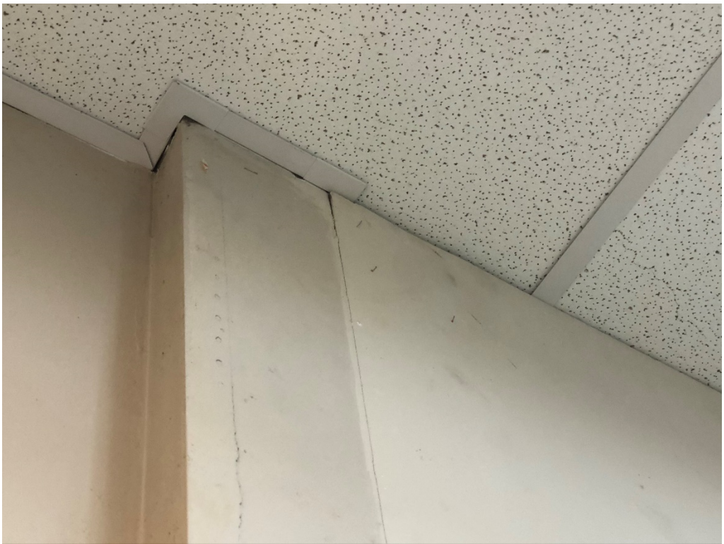
Figure 10 – Corner not Continuous Corridor 127