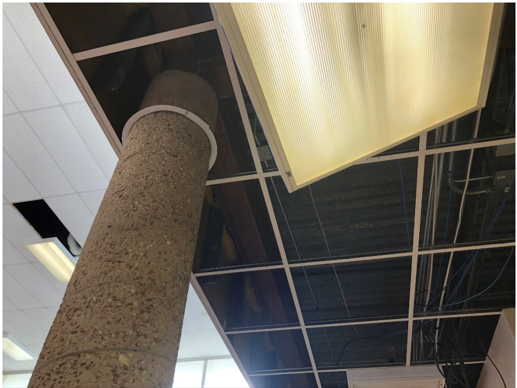
Figure 2 – Example of Curved Grid Corner