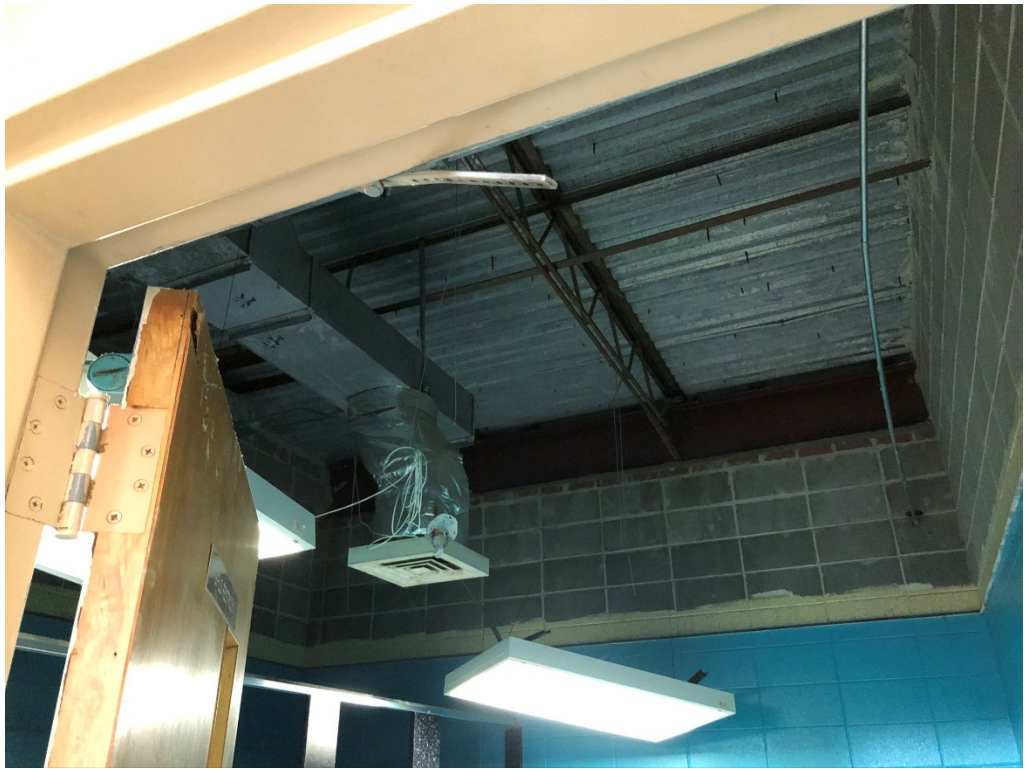
Figure 3 – Demo at Bathrooms