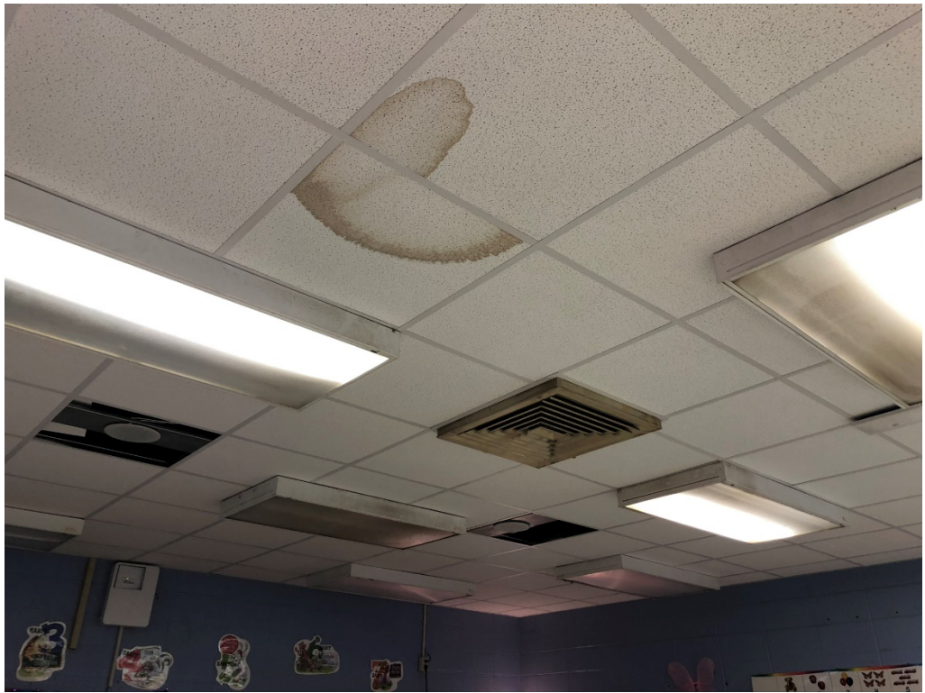
Figure 5 – Water Damaged Tile at Room 111