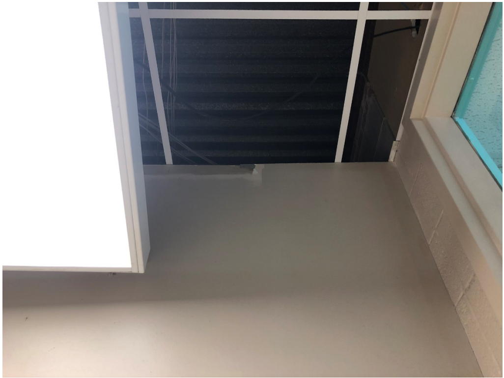
Figure 1 – Damage at Upper Drywall & No Corner In Place