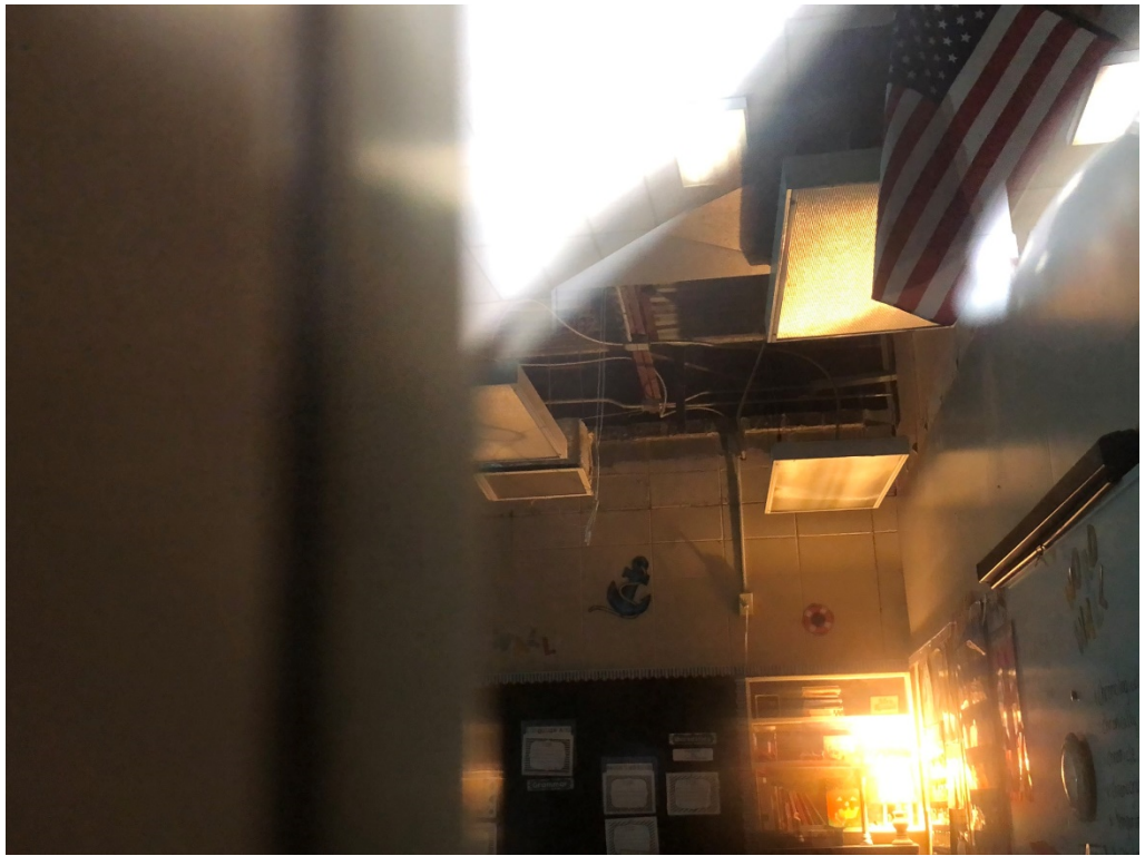
Figure 13 – Demo in Building 3 Room 312