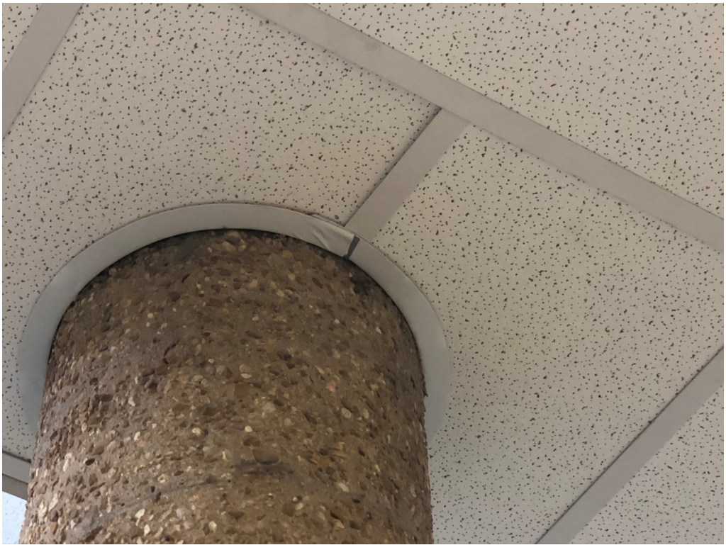
Figure 9 – Damage at Newly Installed Curved Corner Near Work Room 109A