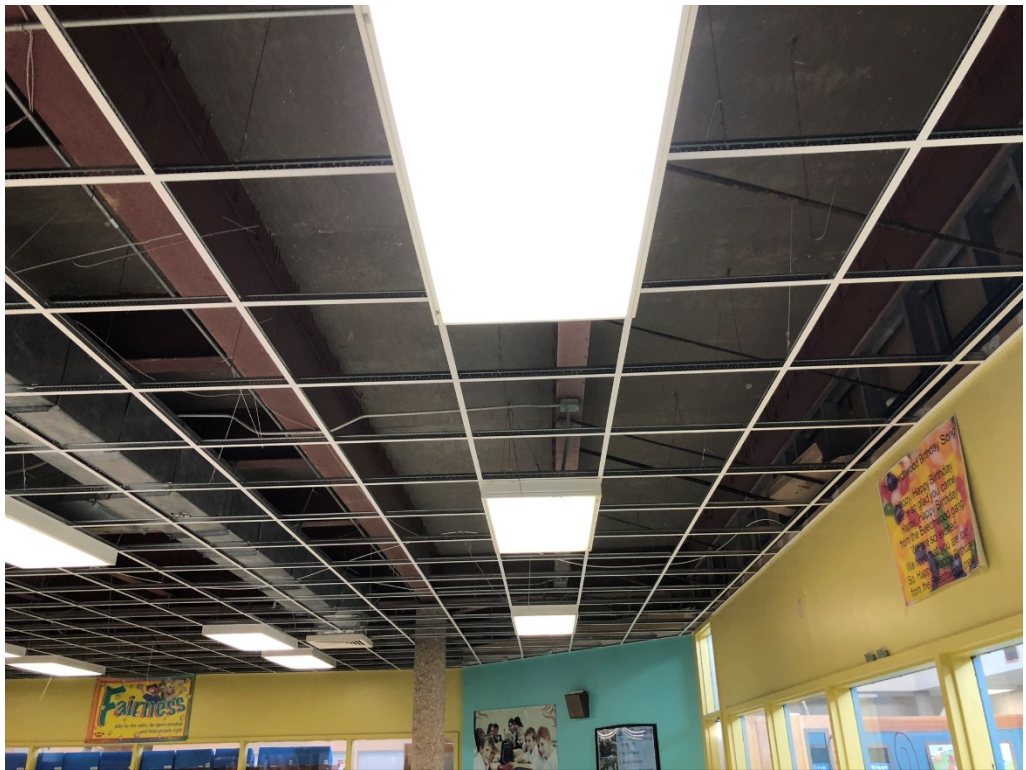
Figure 8 – Properly Aligned Lighting