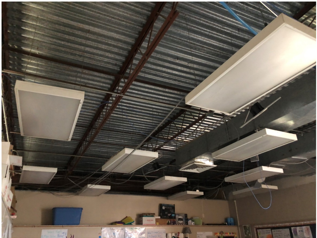
Figure 12 – Demo in Building 3 Room 314