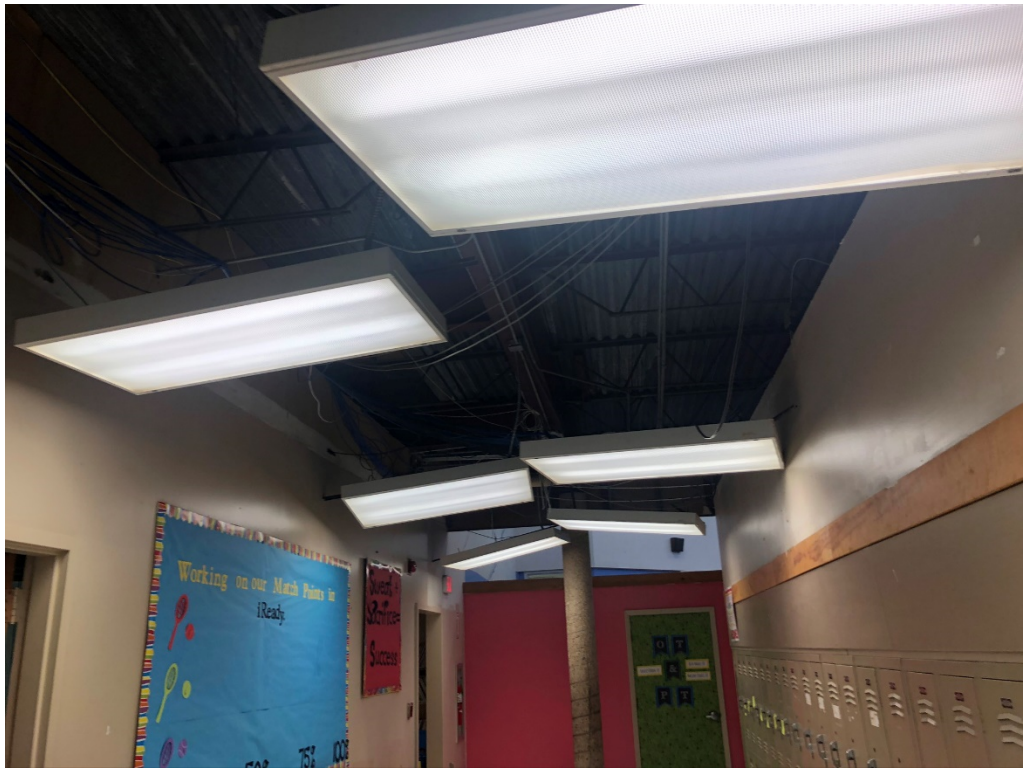
Figure 1 – Entry Hall South