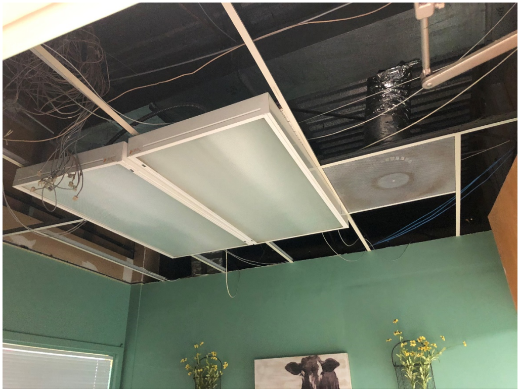
Figure 2 – Administration Office