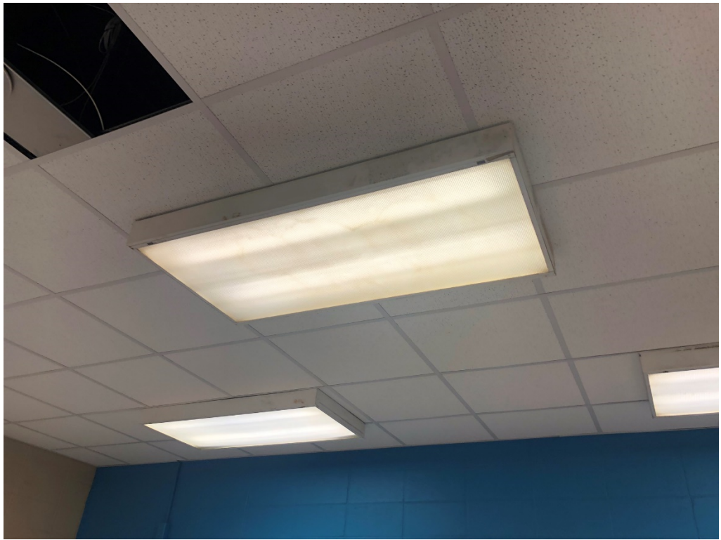
Figure 15 – Lighting Off alignment by 3- inches