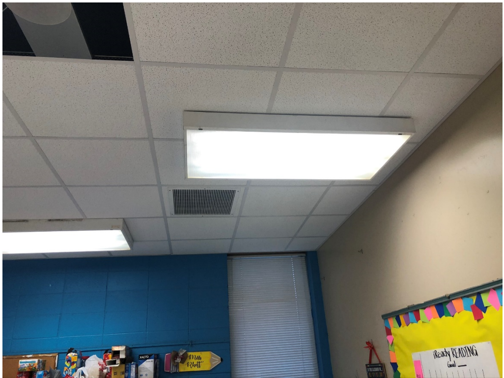
Figure 16 – Offset Lighting