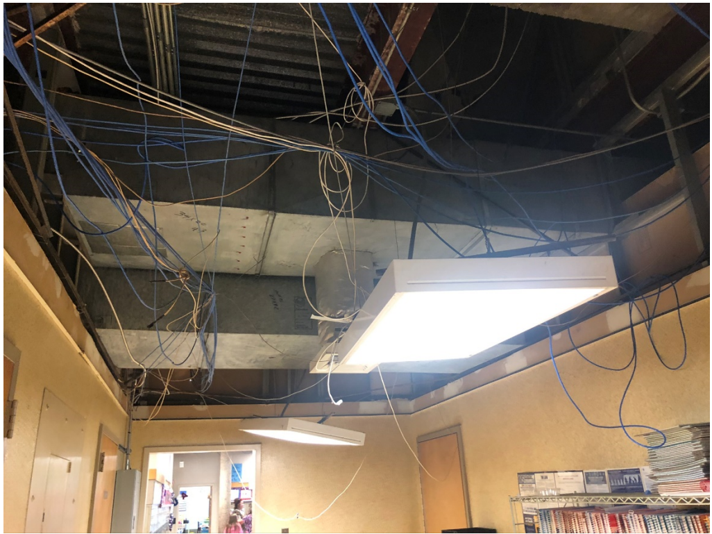
Figure 3 – Teacher Area