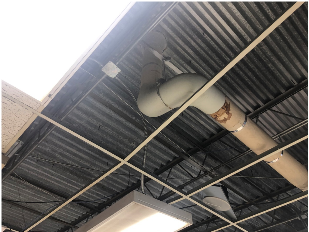
Figure 10 – Leak in South Corner Classroom