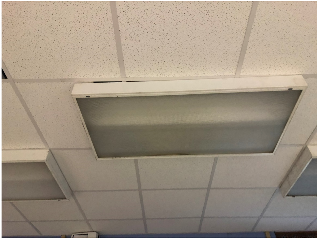
Figure 11 – Angled Lighting (Needs Adjustment)