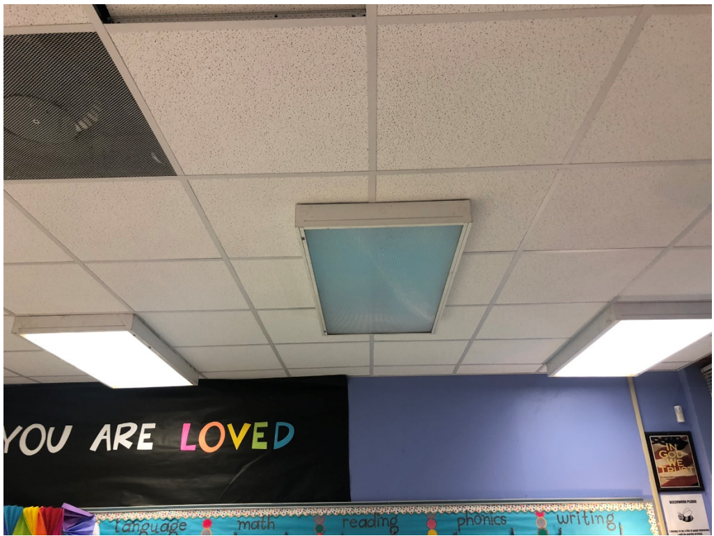
Figure 9 – Off-Center Lighting