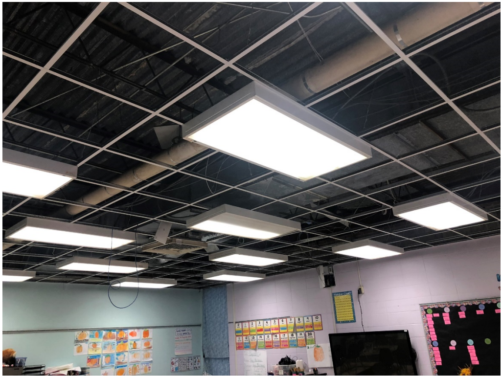
Figure 17 – Example of Room Demoed with New Grid Installed