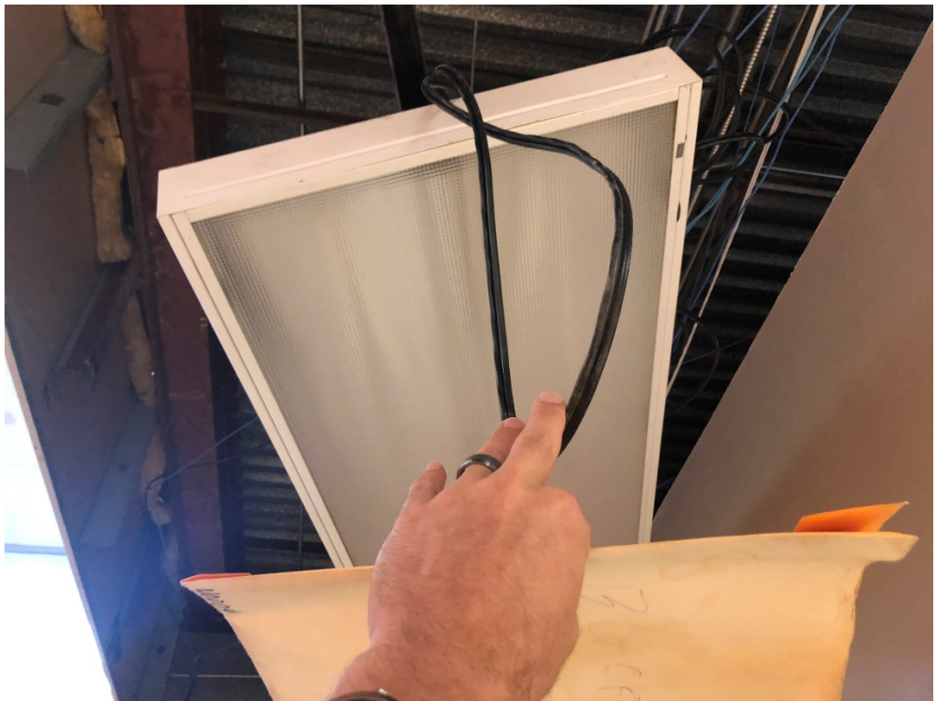
Figure 4 – Hanging Wire