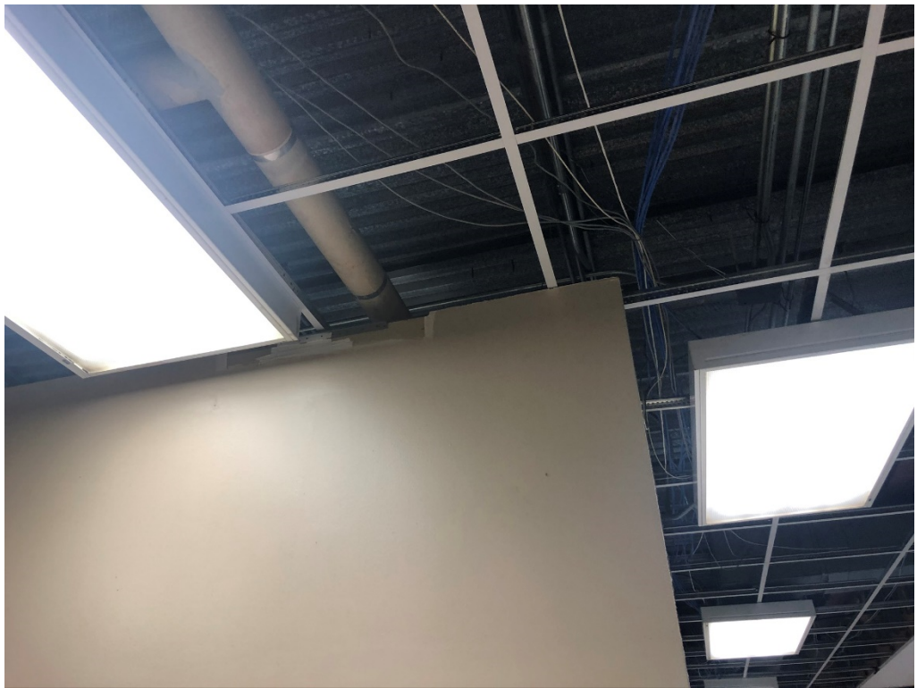
Figure 18 – Grid Installation Missing Corner