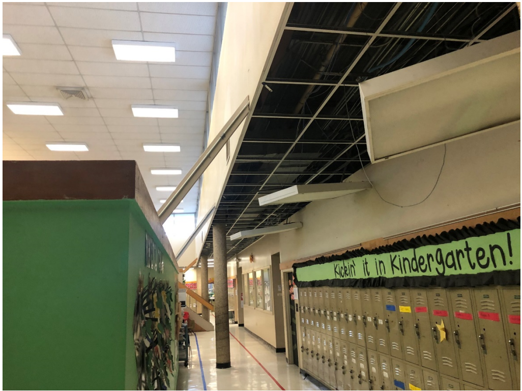
Figure 13 – New Grid On North Side of Main Hall