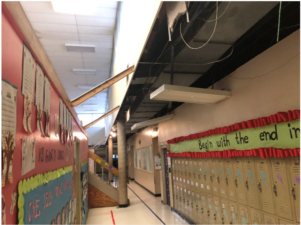
Figure 5 – Southwest Main Hall