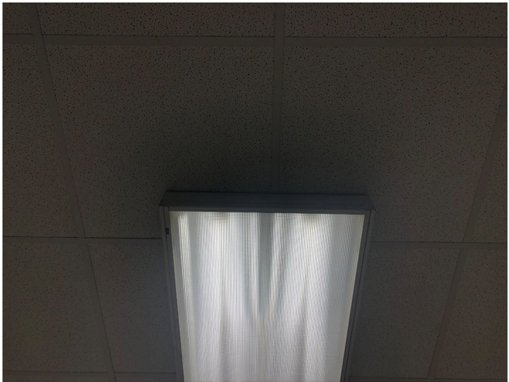
Figure 6 – Off Center Lighting