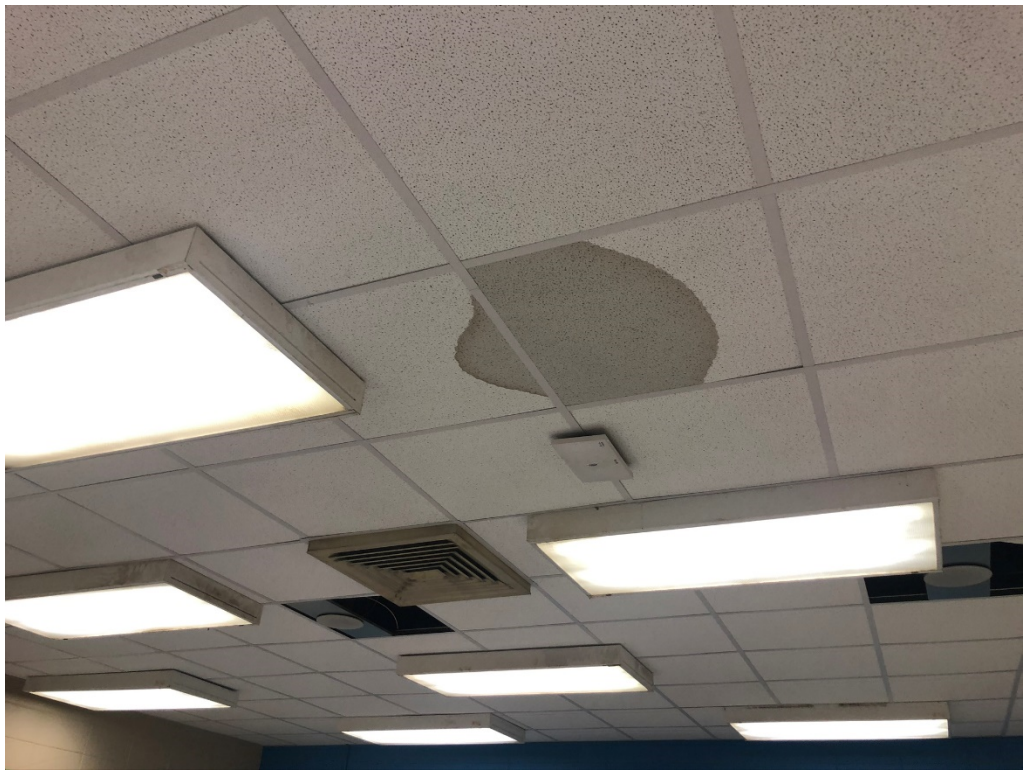
Figure 14 – Leak at East Corner Classroom