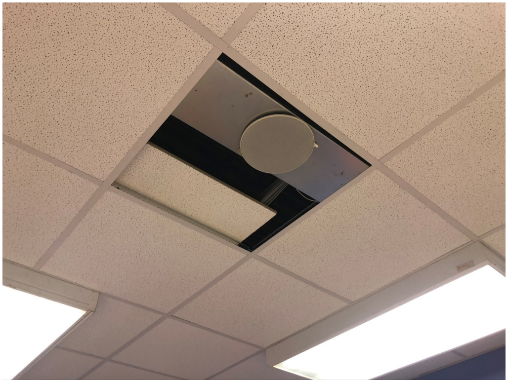
Figure 8 – Unfinished Audio Installation