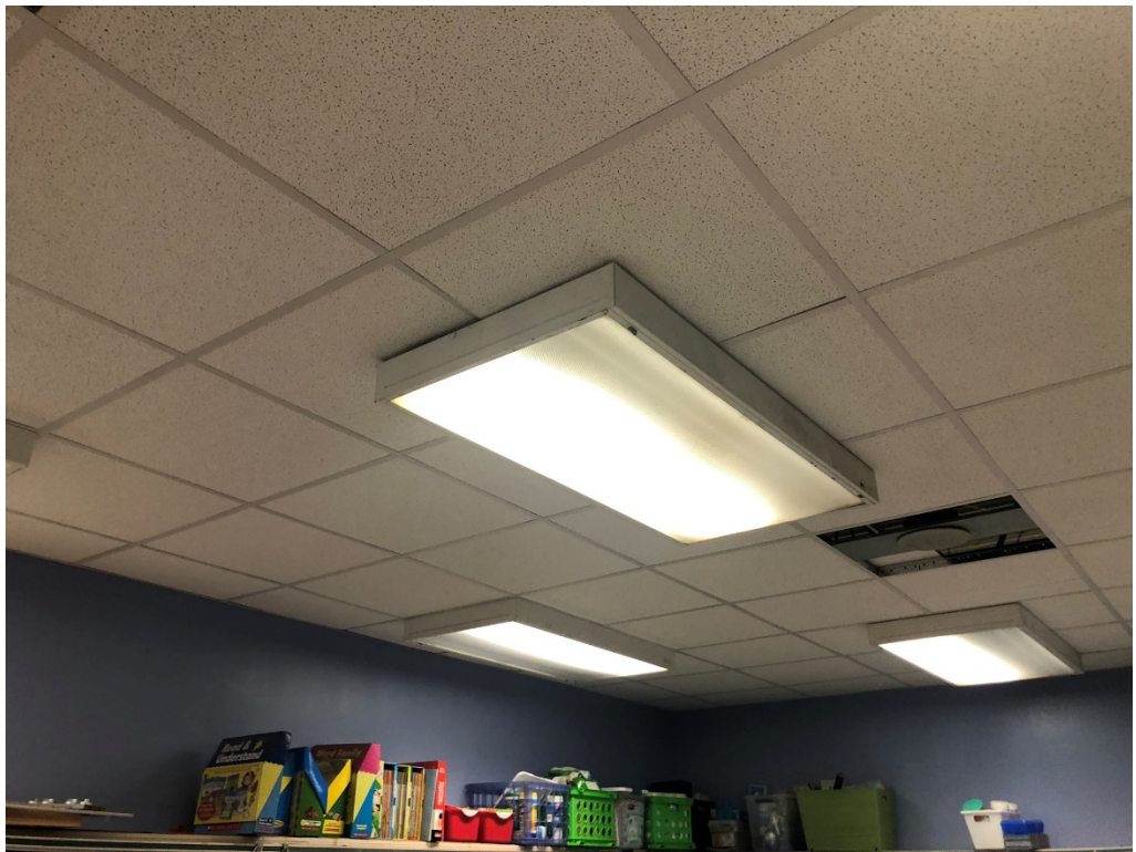
Figure 12 – Note Gap Between Light and Tiles is more on Left than Right