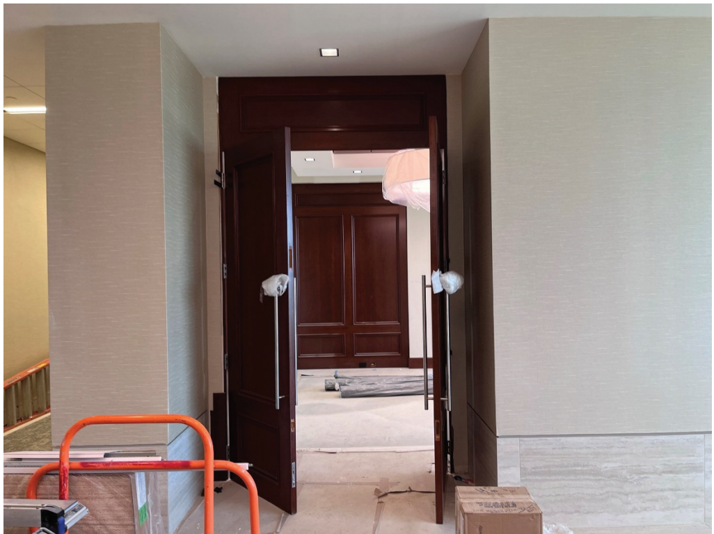
Figure 10 – Private Dining and Lounge Millwork