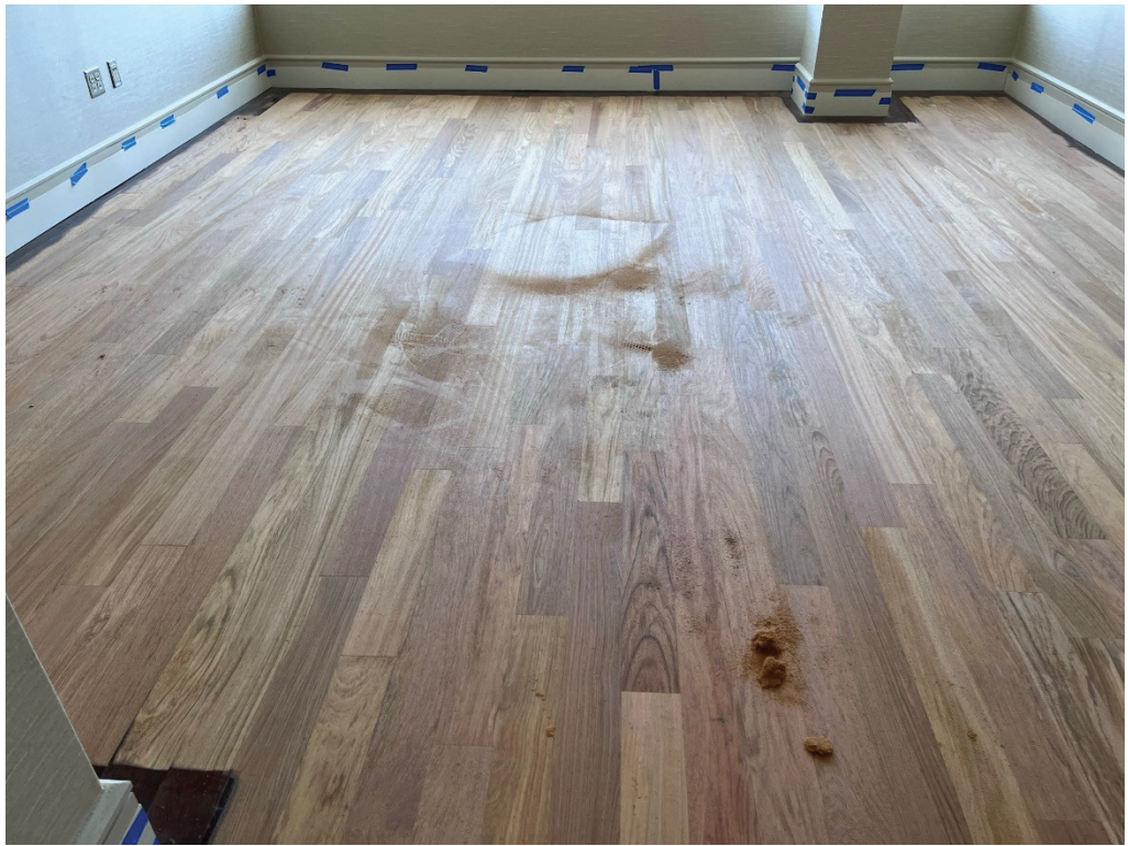
Figure 21 – Approx. 60% of sanding complete