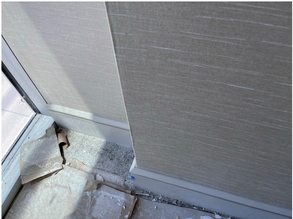
Figure 8 – Pour Corners in Large Meeting 4 th Floor