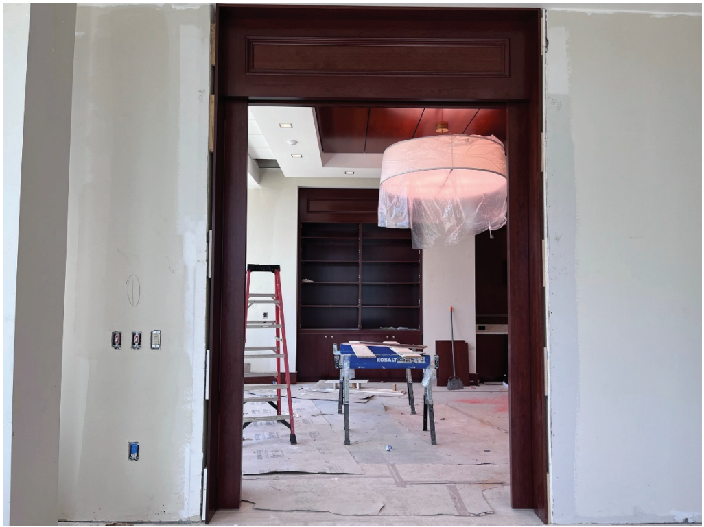
Figure 15 – Private Dining and Lounge Millwork