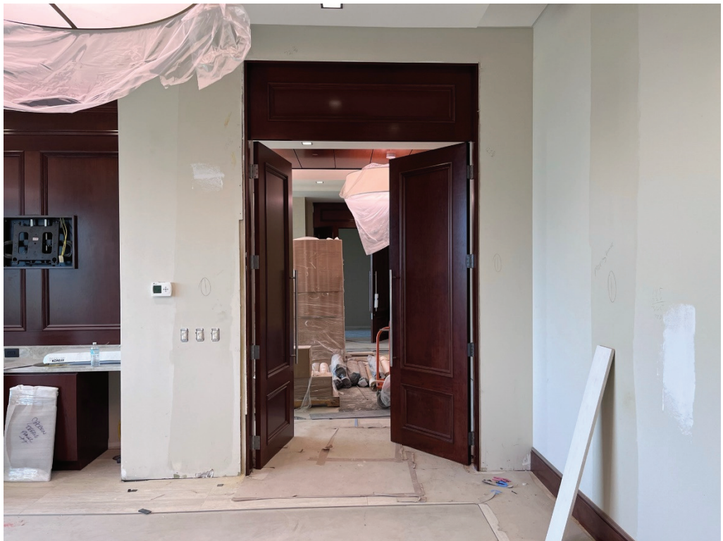
Figure 12 – Private Dining and Lounge Millwork