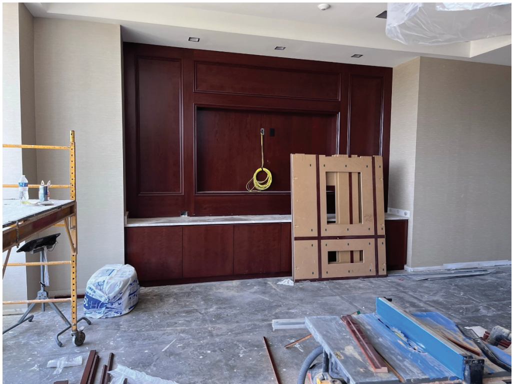
Figure 18 – Board Room Millwork