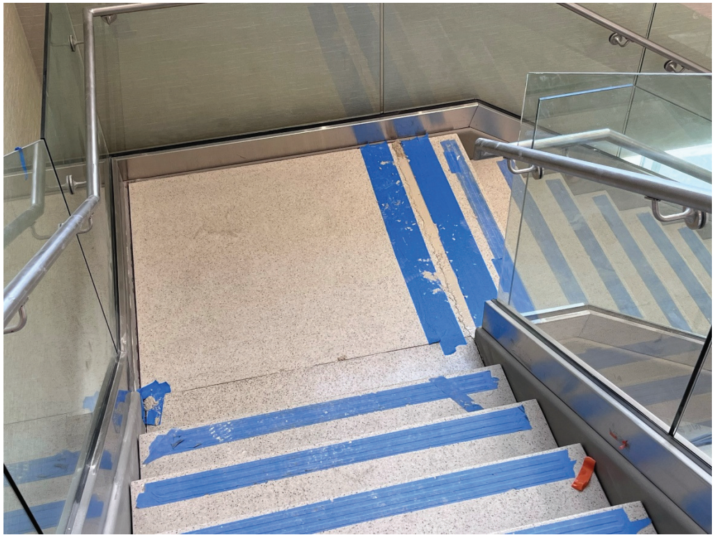
Figure 9 – Landing Gap Filled; finish work ongoing