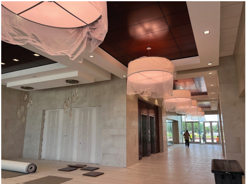
Figure 2 – Lights installed at first floor lobby