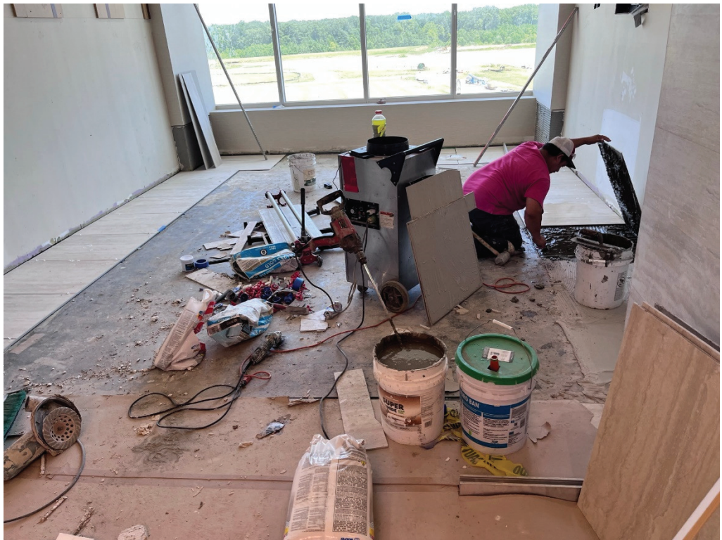
Figure 22 – 4 th Floor Conference Tile Progress