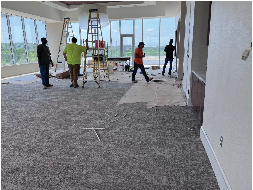
Figure 5 – Electrical ongoing