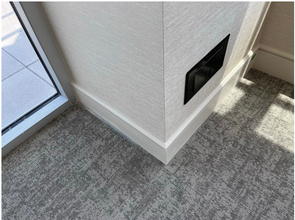
Figure 6 – Some Carpet needed in gap SE corner