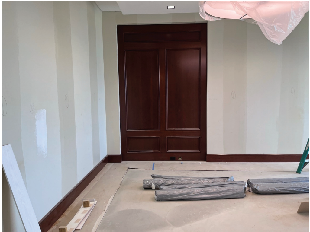
Figure 11 – Private Dining and Lounge Millwork