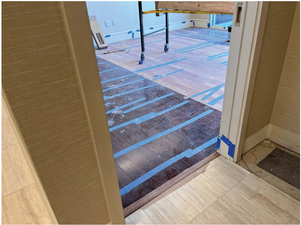
Figure 19 – Some Rooms still to be sanded