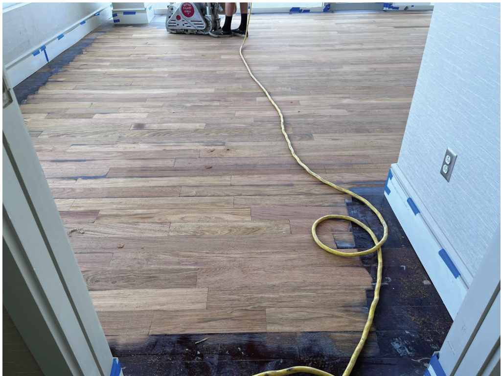
Figure 20 – Sanding Ongoing