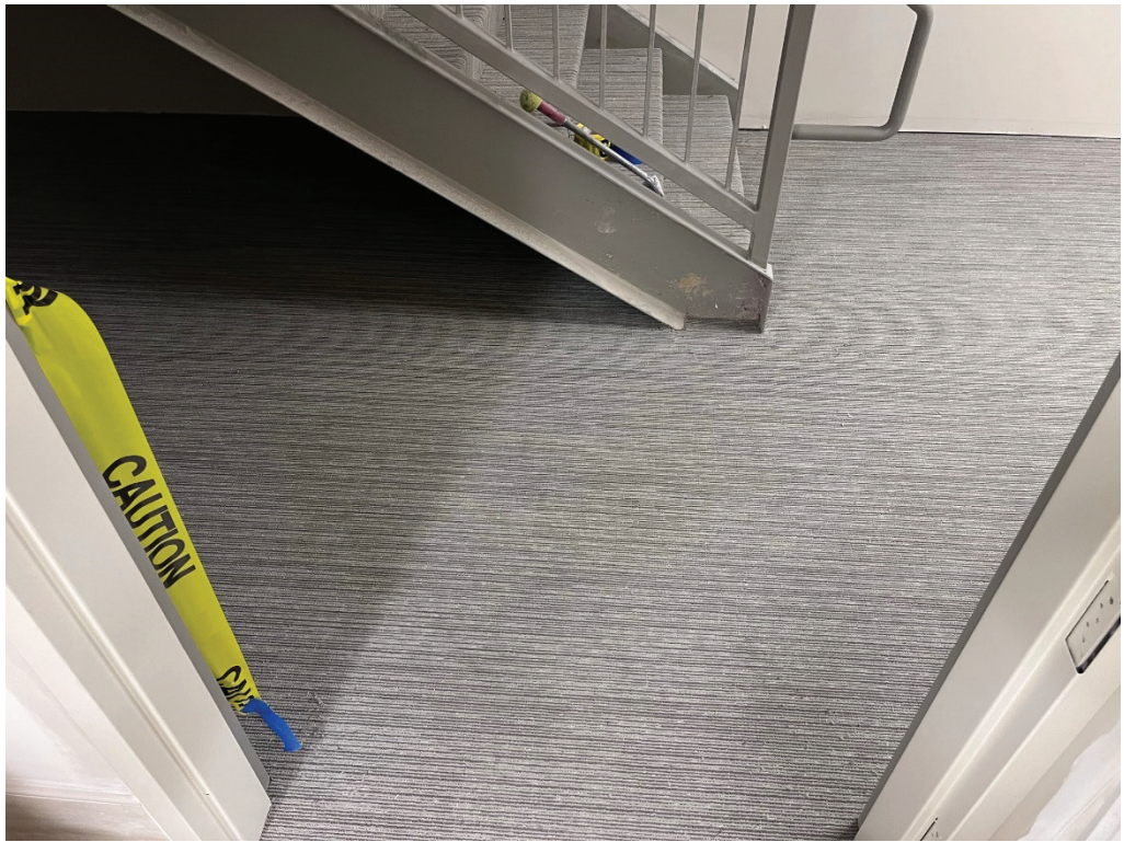
Figure 23 – Carpet Installed at Stairwell