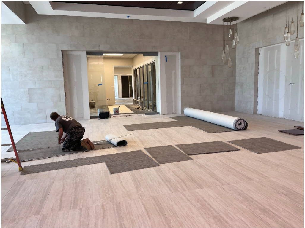
Figure 3 – Carpet for Stairwell installations