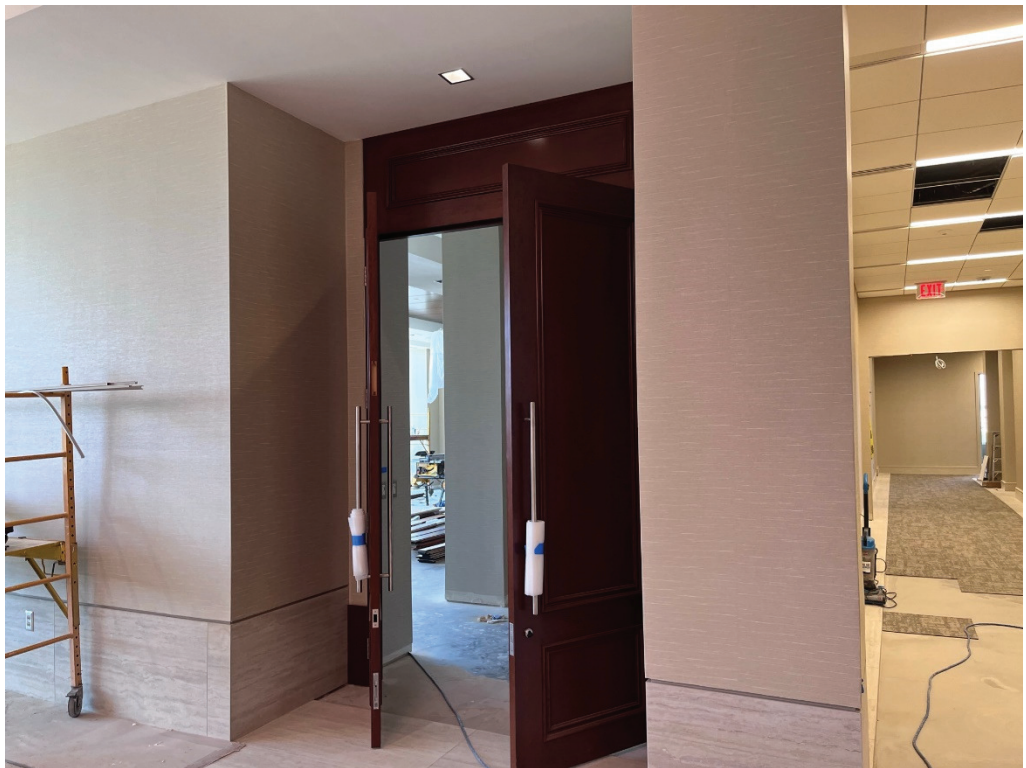
Figure 16 – Board Room Millwork