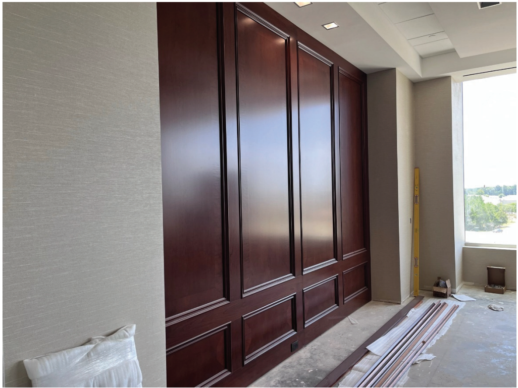
Figure 17 – Board Room Millwork