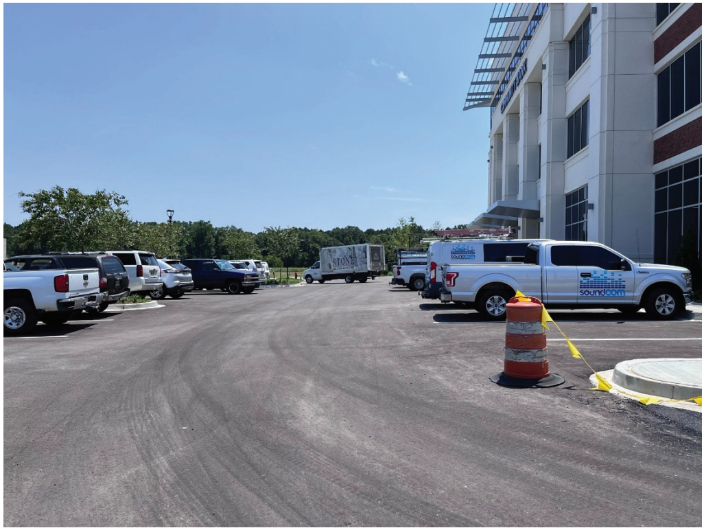
Figure 1 – Many workers on site today