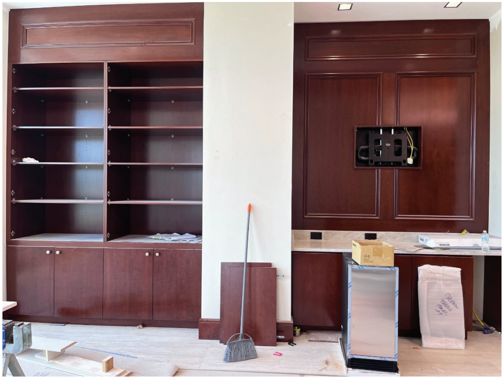
Figure 13 – Private Dining and Lounge Millwork