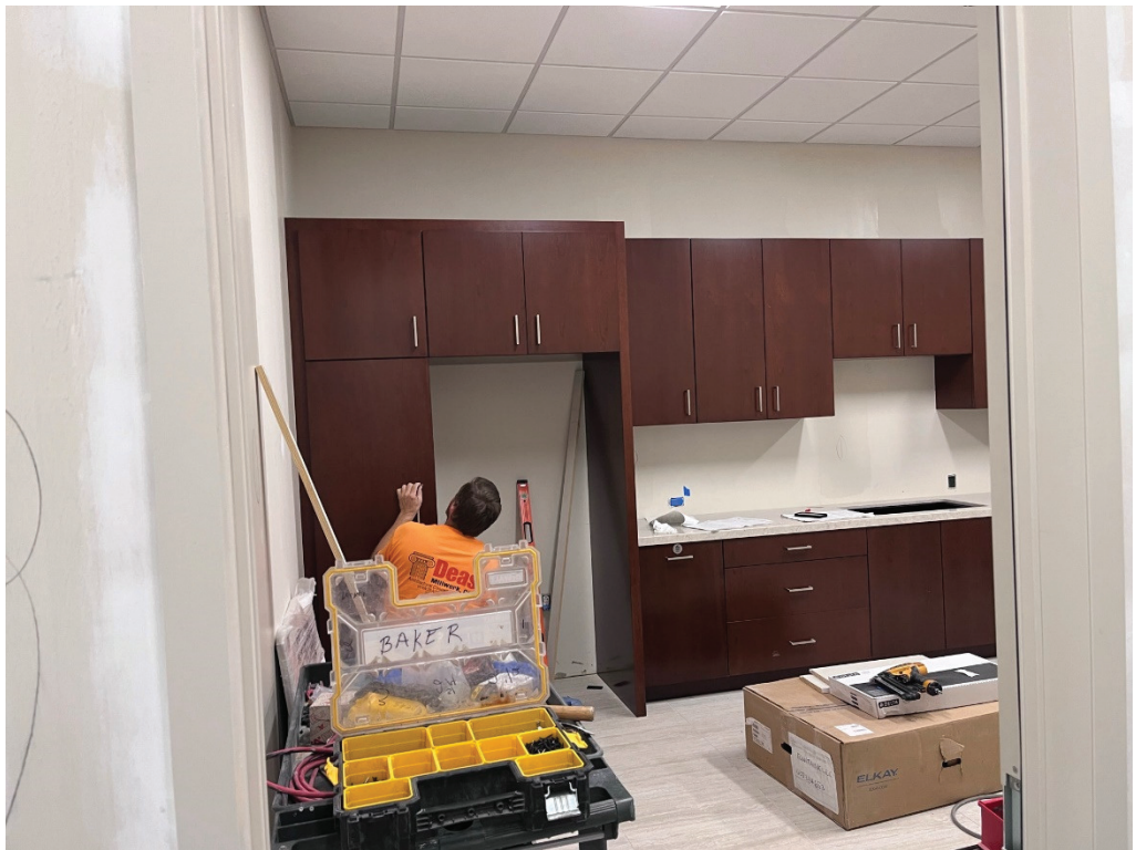
Figure 4 – Millwork Installation at 1 st Floor