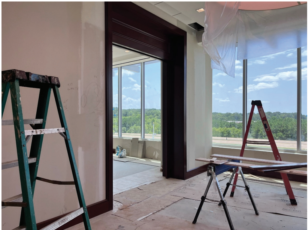
Figure 14 – Private Dining and Lounge Millwork