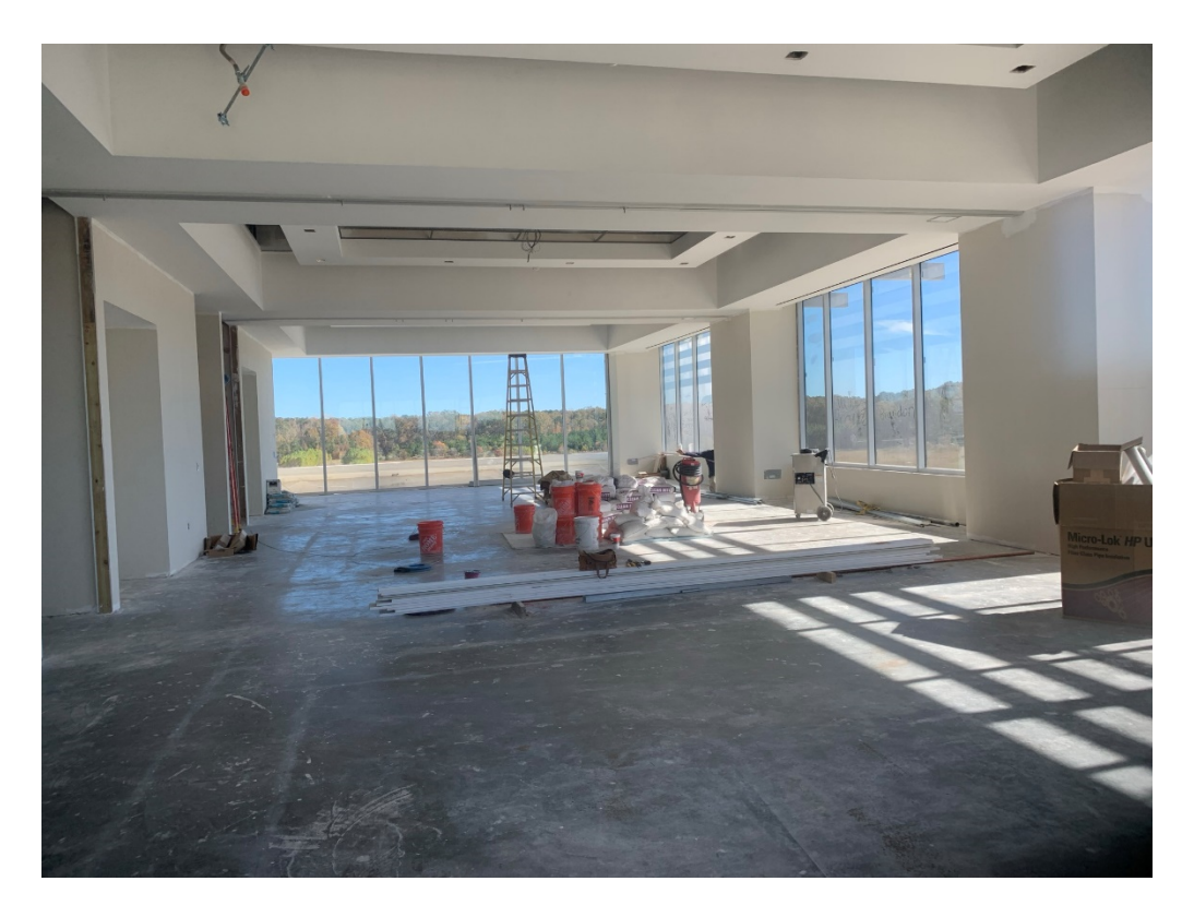
Figure 17 – Banquet Room Progress