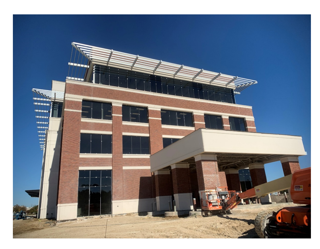
Figure 5 – South Façade