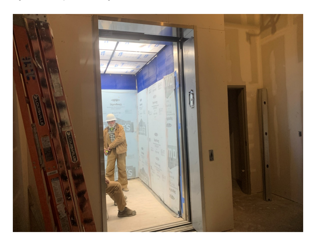
Figure 18 – Maintenance Elevator Operational and in Use