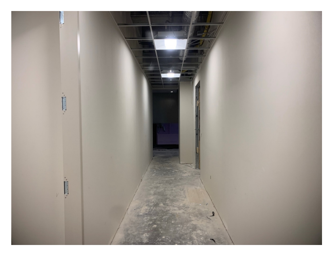
Figure 10 – Painting and Finishing is ongoing