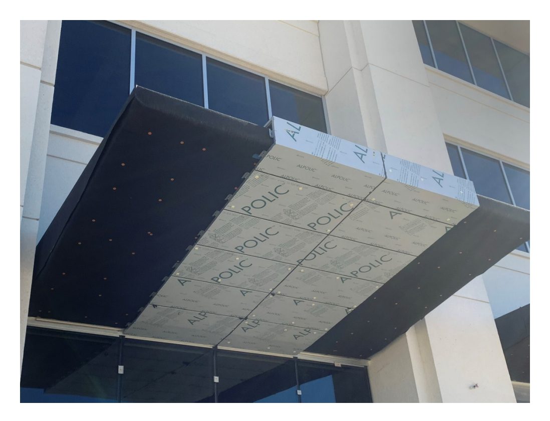
Figure 7 – Aluminum Clad Panel Installation Progress