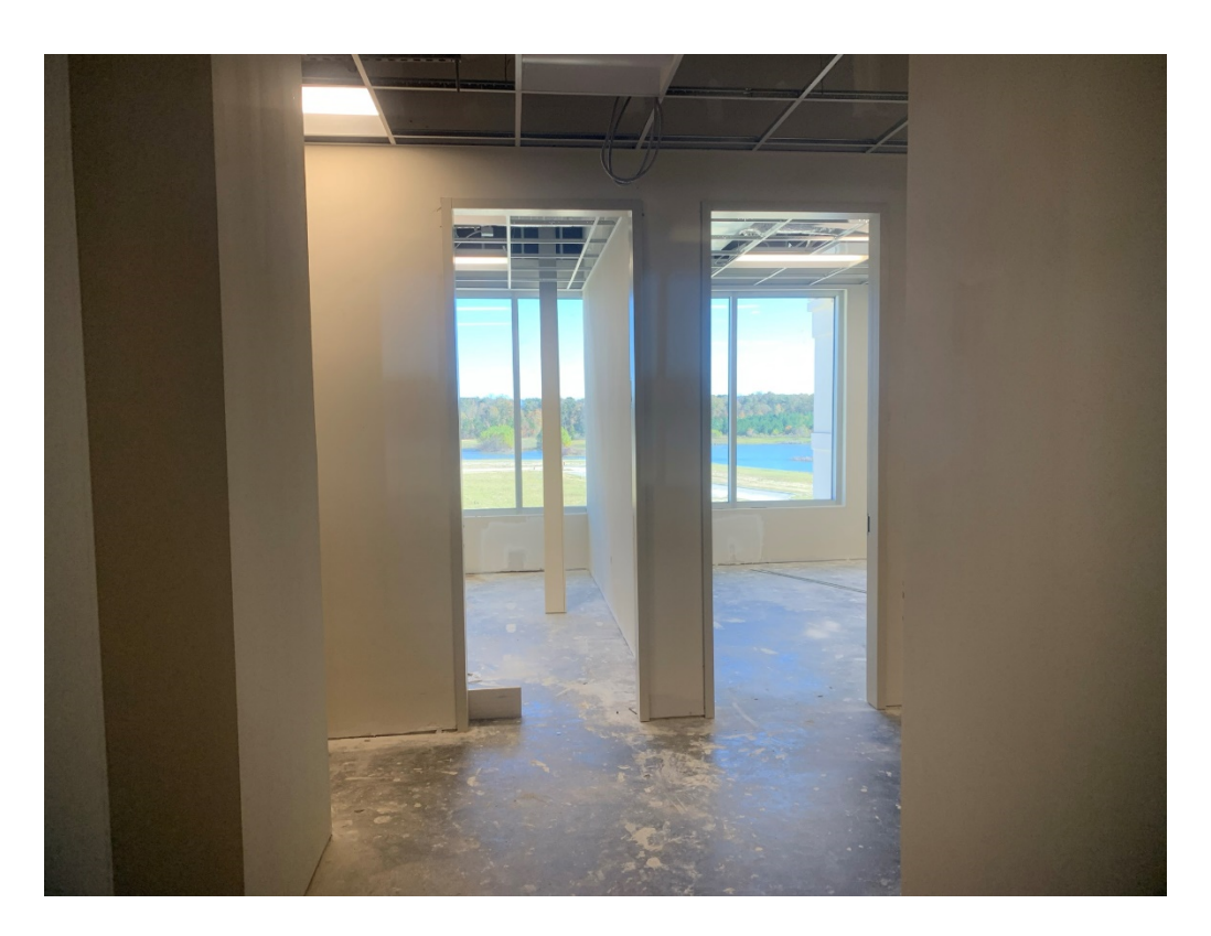
Figure 11 – Painting and Finishing is ongoing