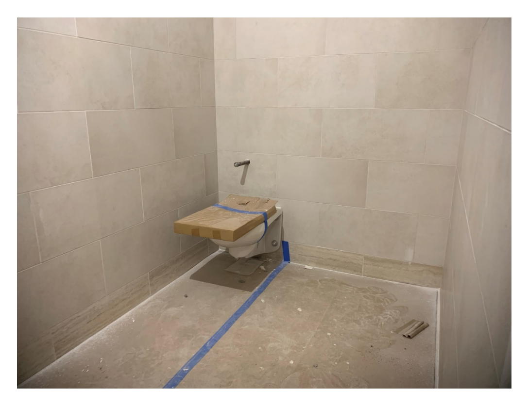
Figure 16 – Toilets are being installed Throughout