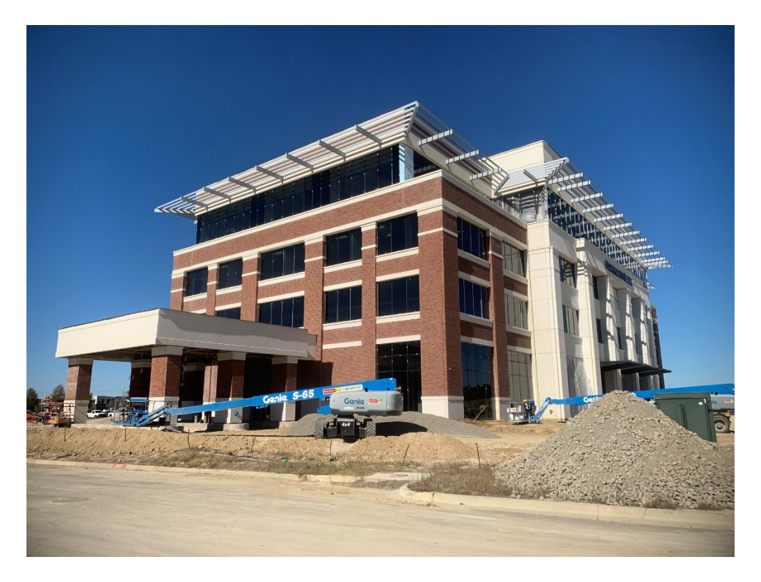
Figure 4 – South Façade