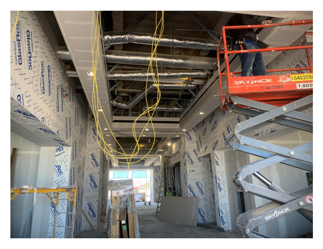
Figure 8 – First Floor Lobby Progress