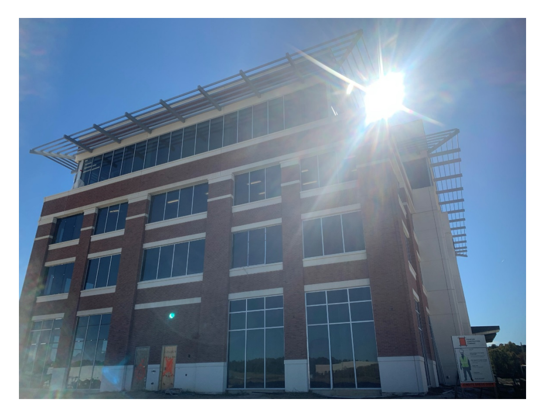
Figure 2 – North Façade Progress