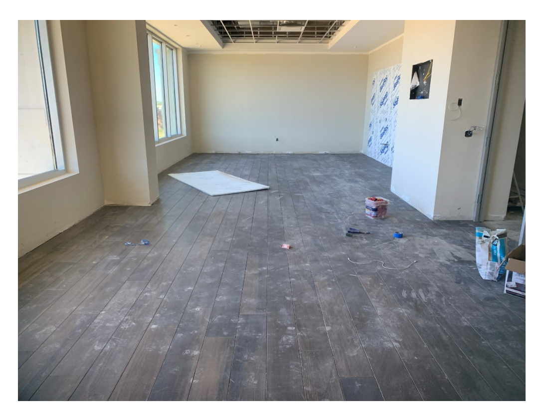
Figure 13 – Tile at Break Area Laid