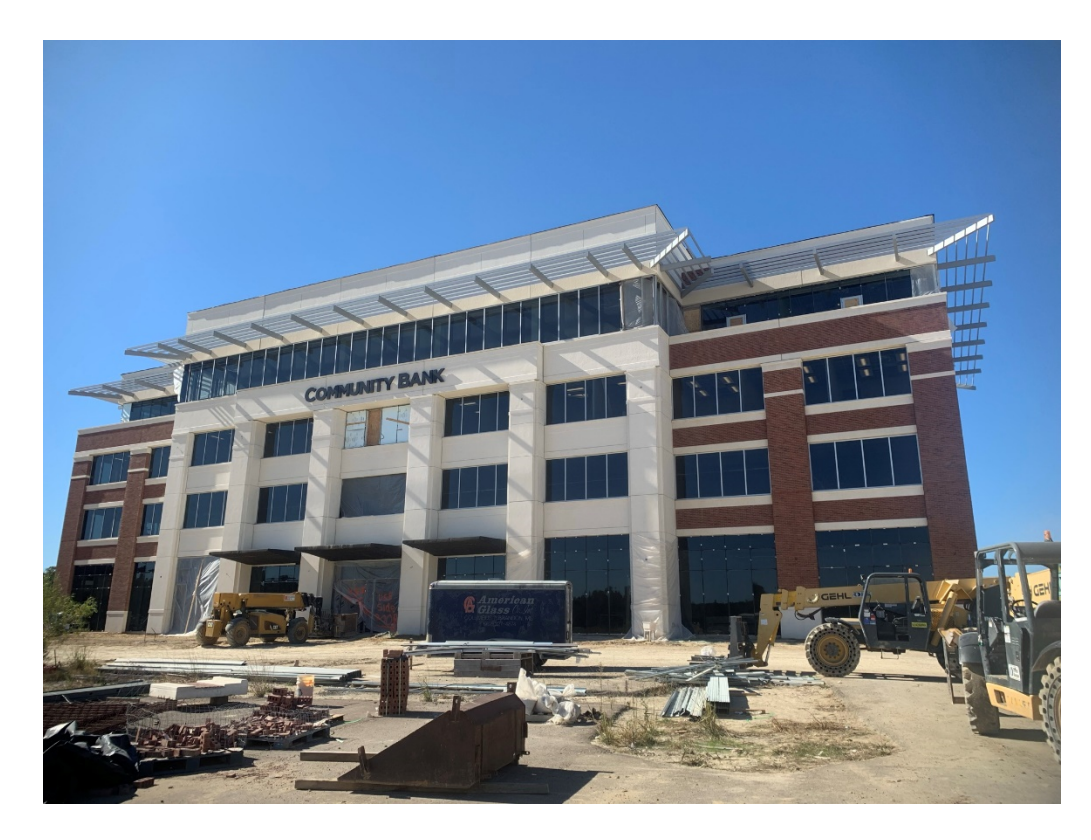
Figure 3 – East Facade