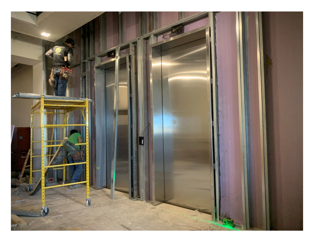
Figure 9 – Main Elevator work is ongoing