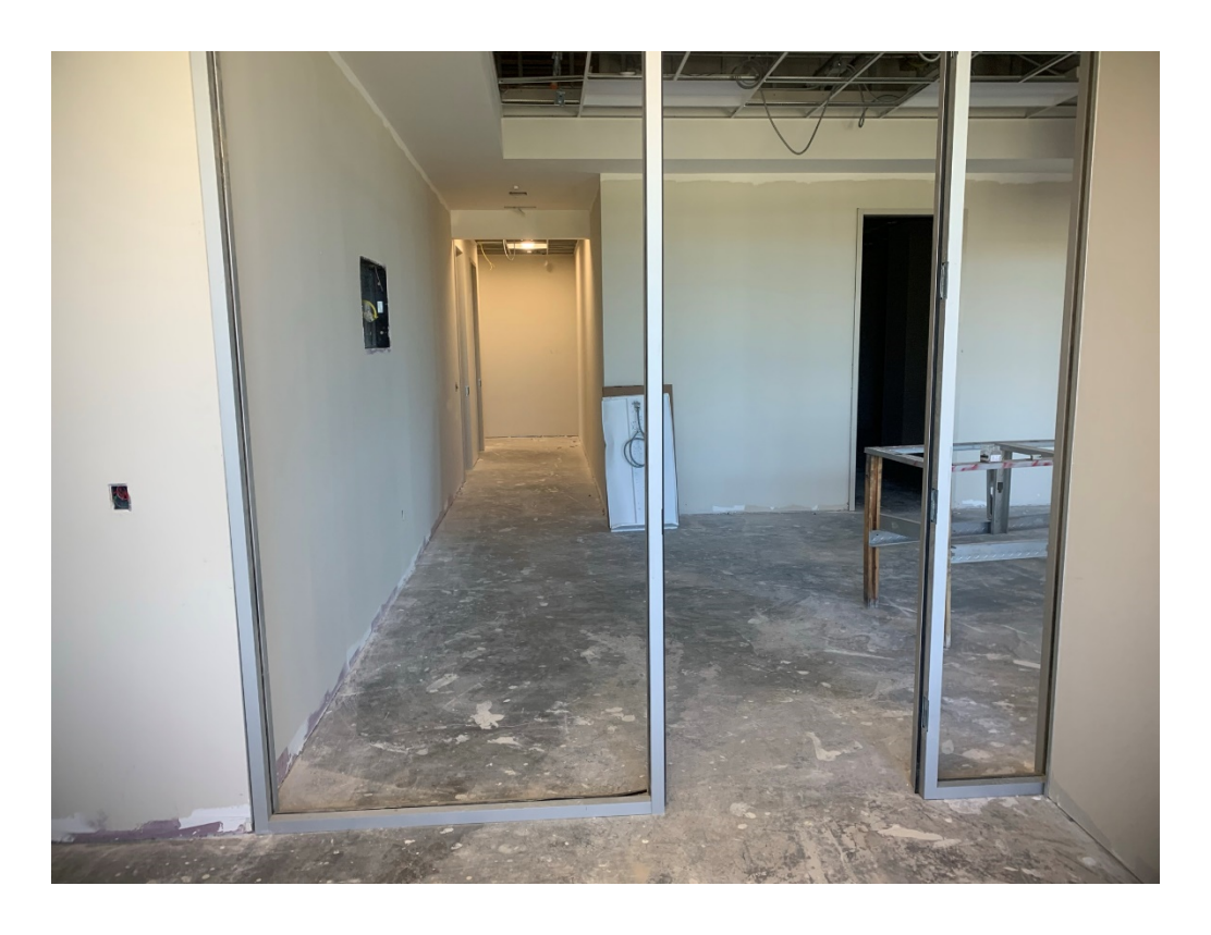
Figure 12 – Interior Frames installed throughout