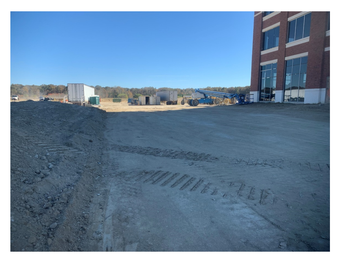
Figure 6 – Lot Limed and Packed