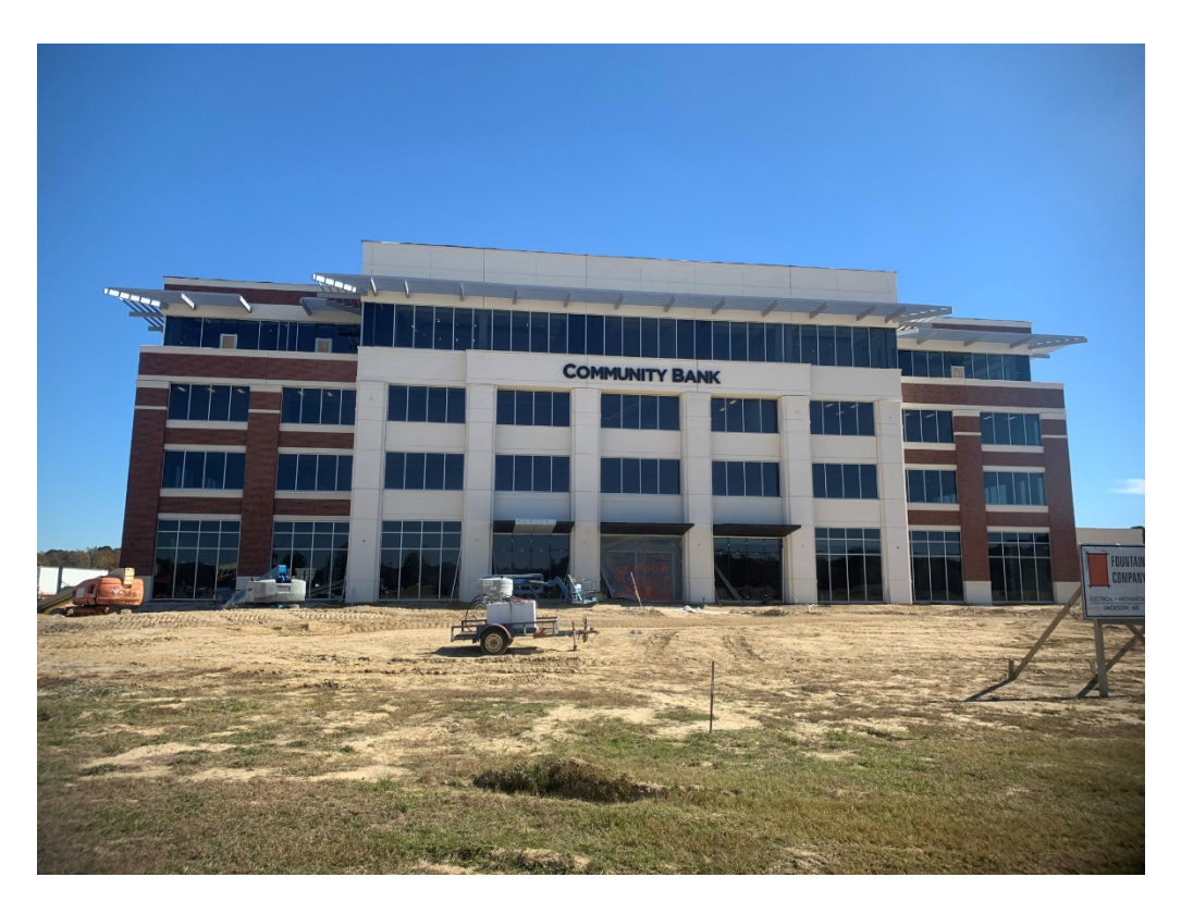
Figure 1 – West Façade Progress