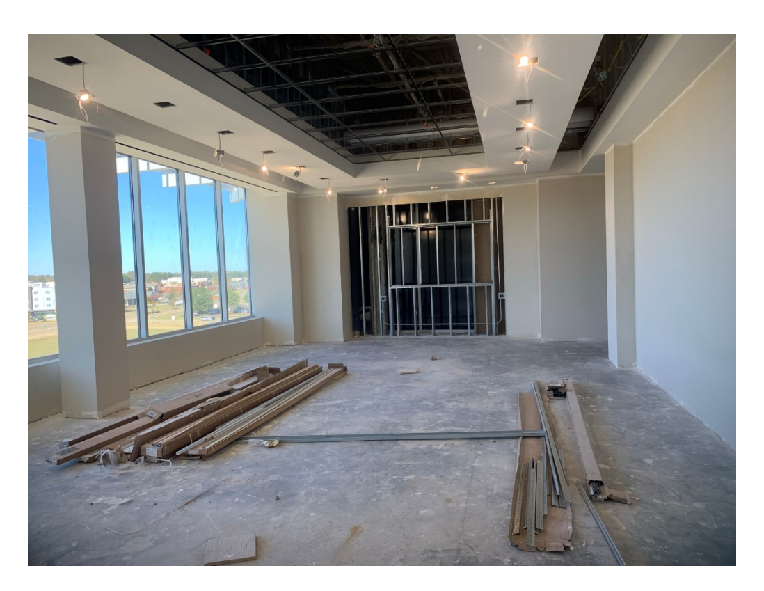
Figure 19 – Board Room Progress