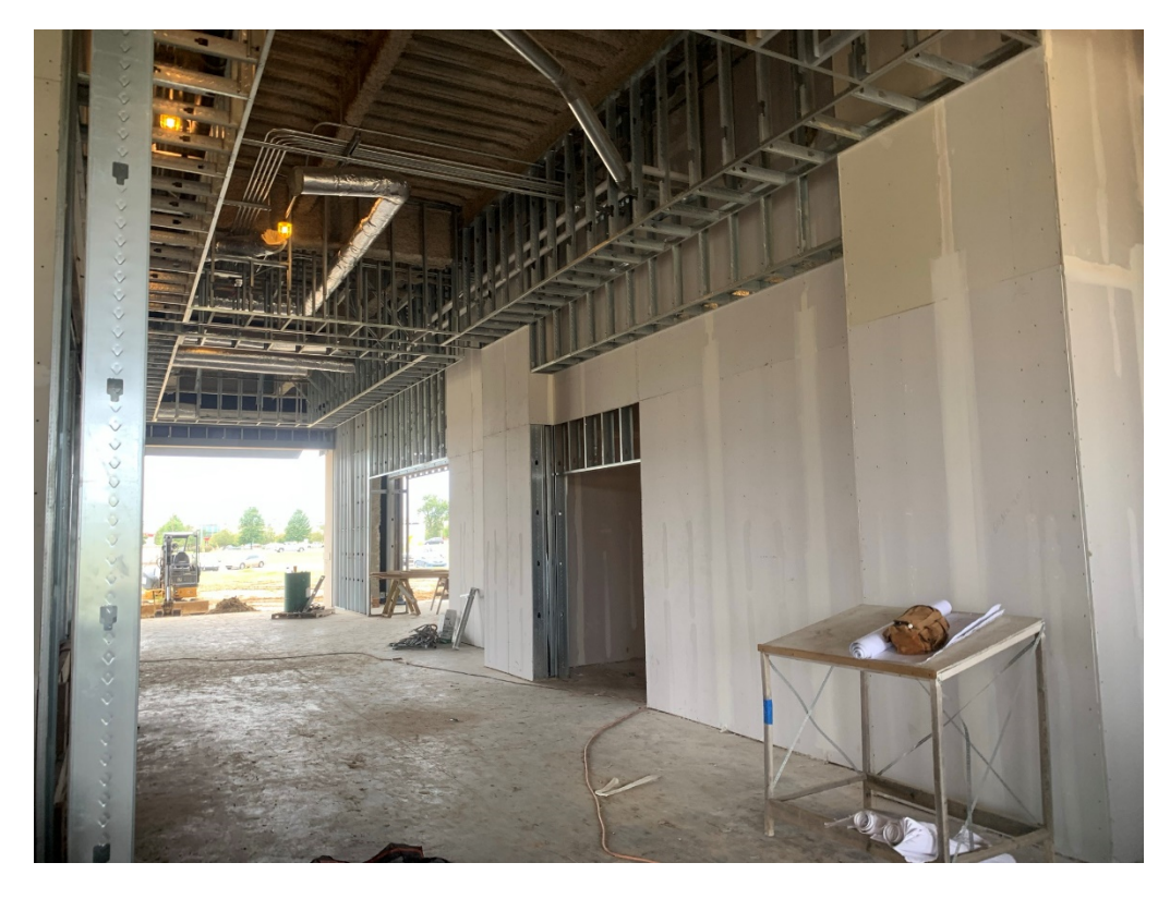
Figure 8 – Ceiling Framing at the First Floor