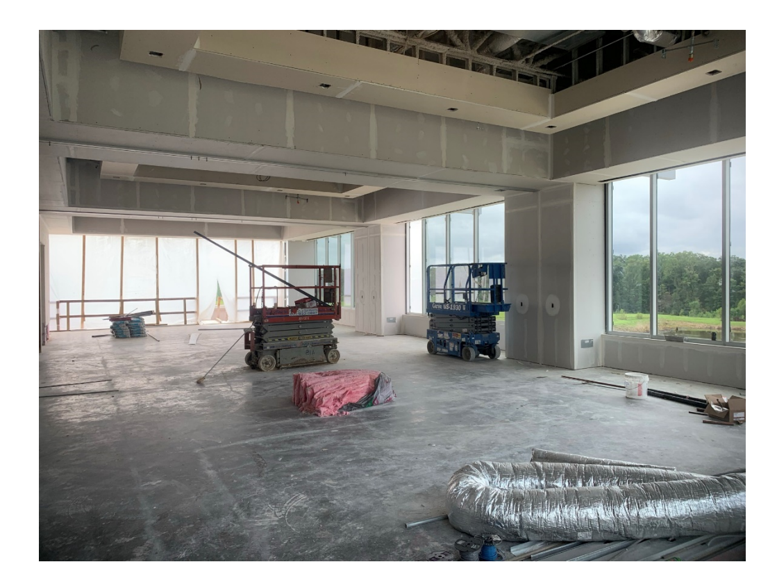
Figure 16 – Continued Drywall at Banquet 4<sup>th</sup> Floor