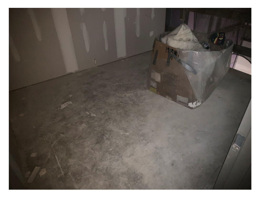
Figure 10 – Support 2007: this floor seems to be very out of level and may need additional leveling installed at the floor