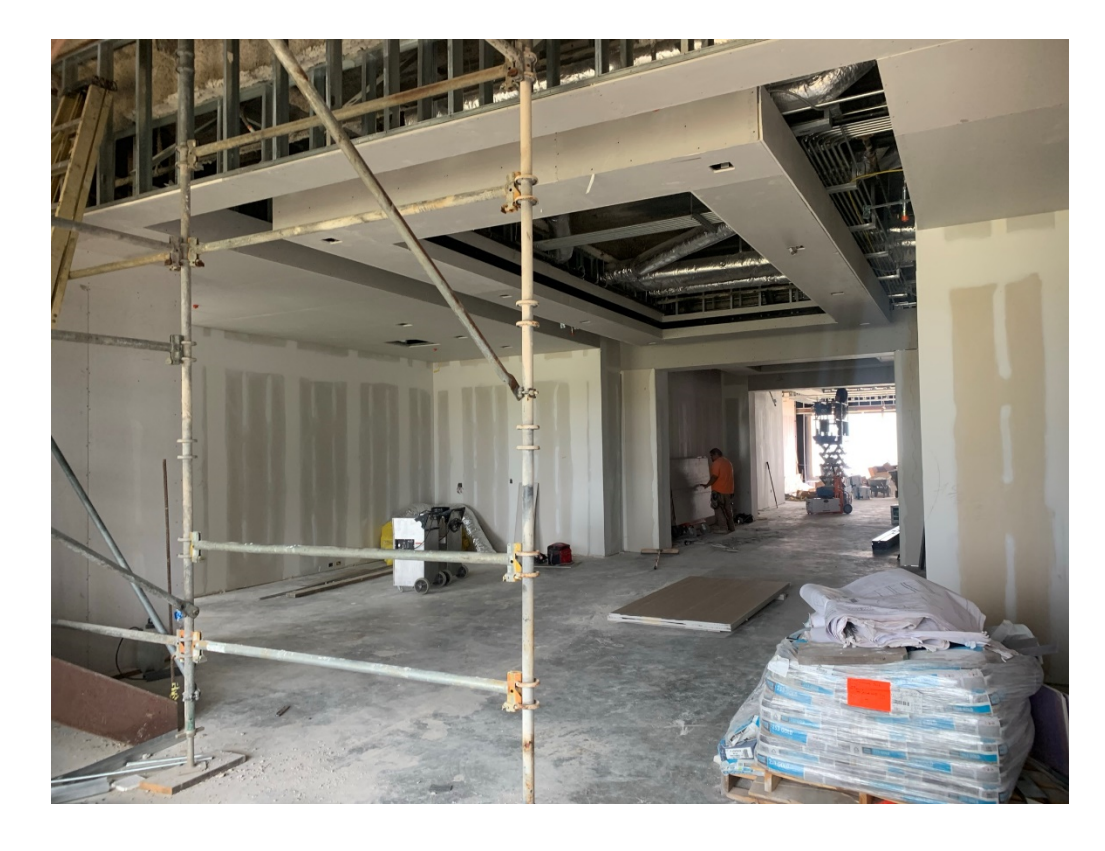
Figure 14 – Hard Ceiling Installation at the 3<sup>rd</sup> Floor