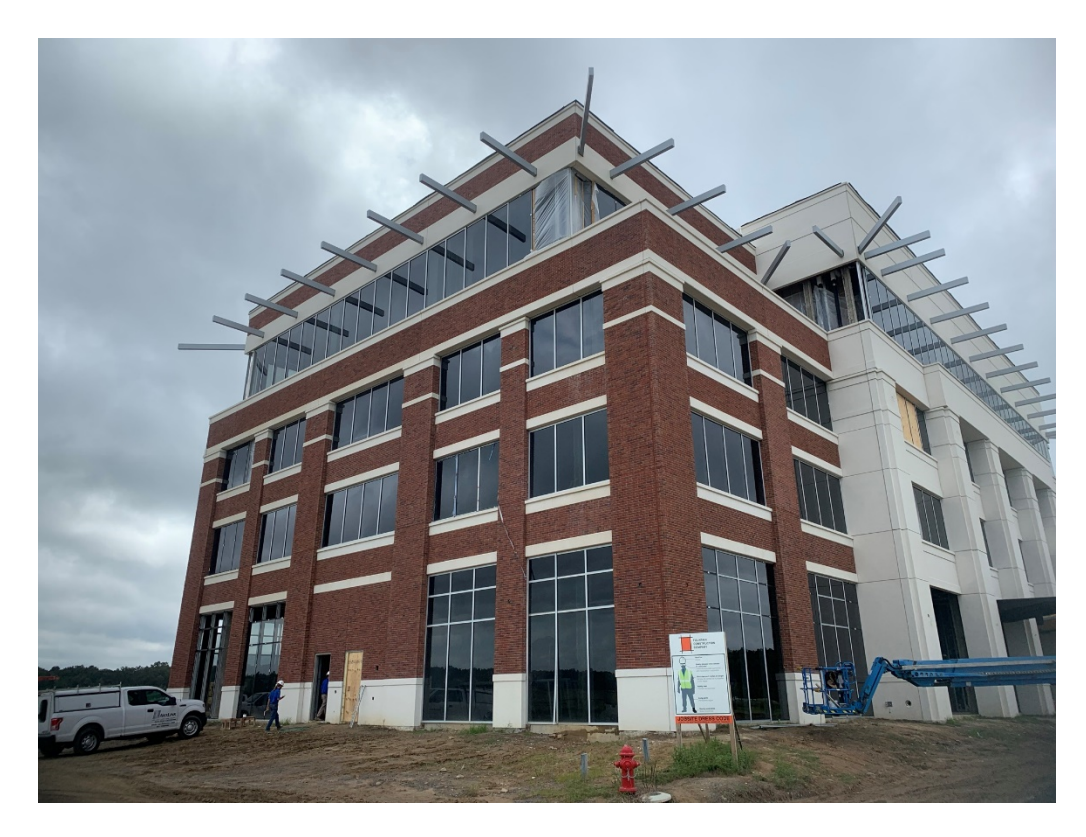
Figure 2 – North Façade Progress