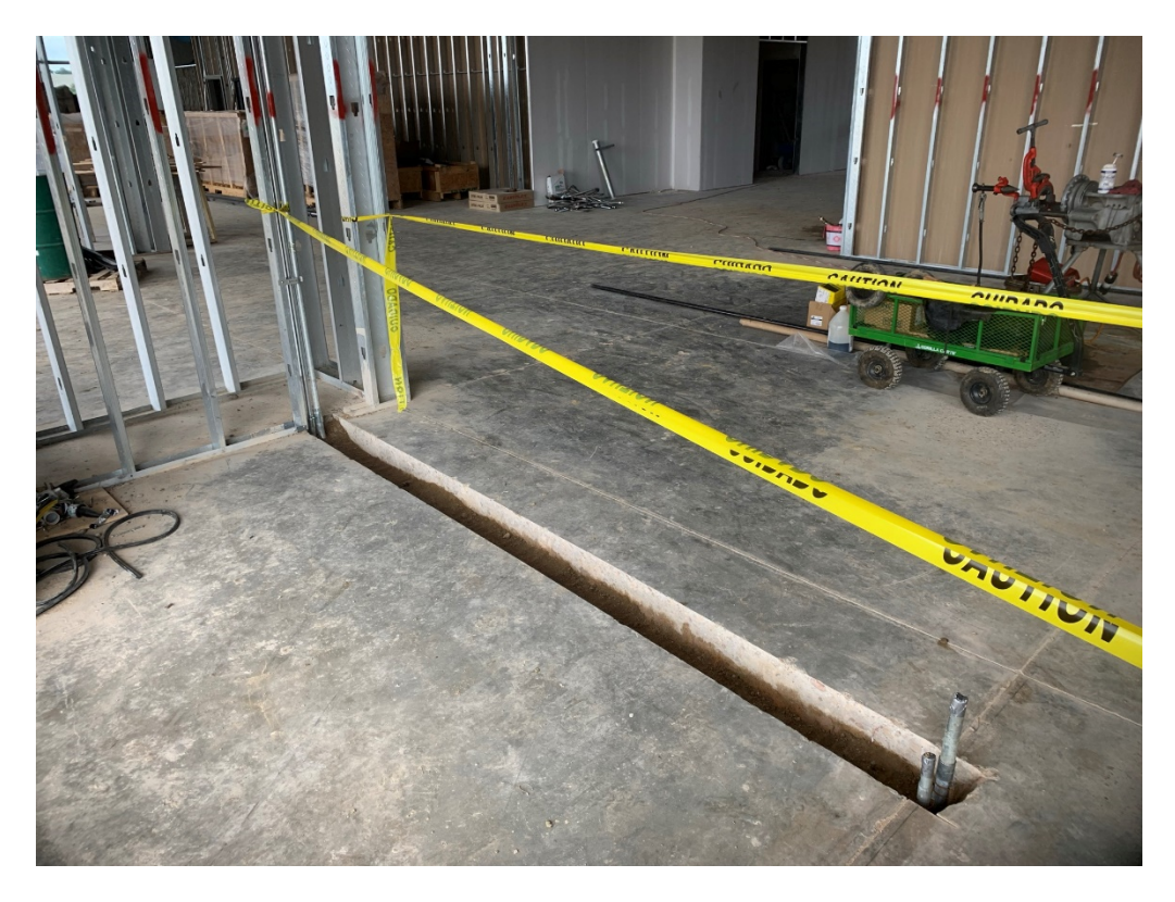
Figure 5 – Trenches for added conduit