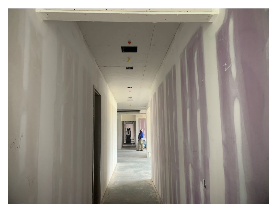
Figure 13 – Hard Ceiling Installation at the 3rd Floor