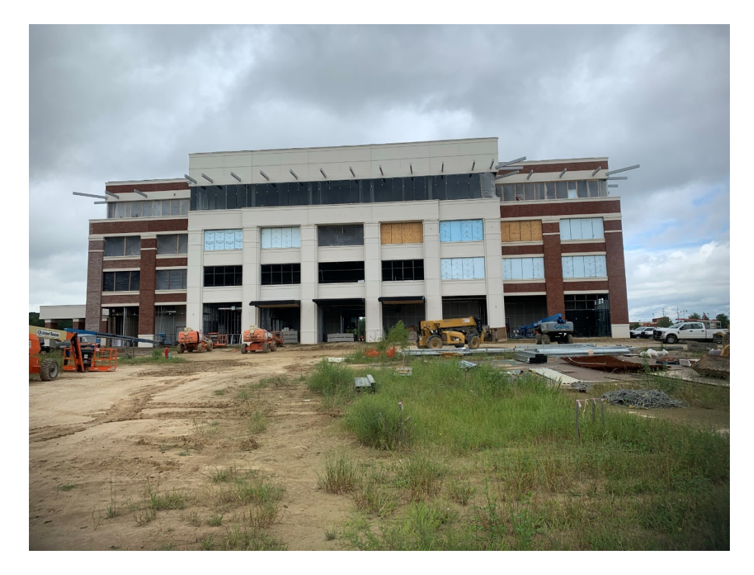
Figure 3 – East Facade