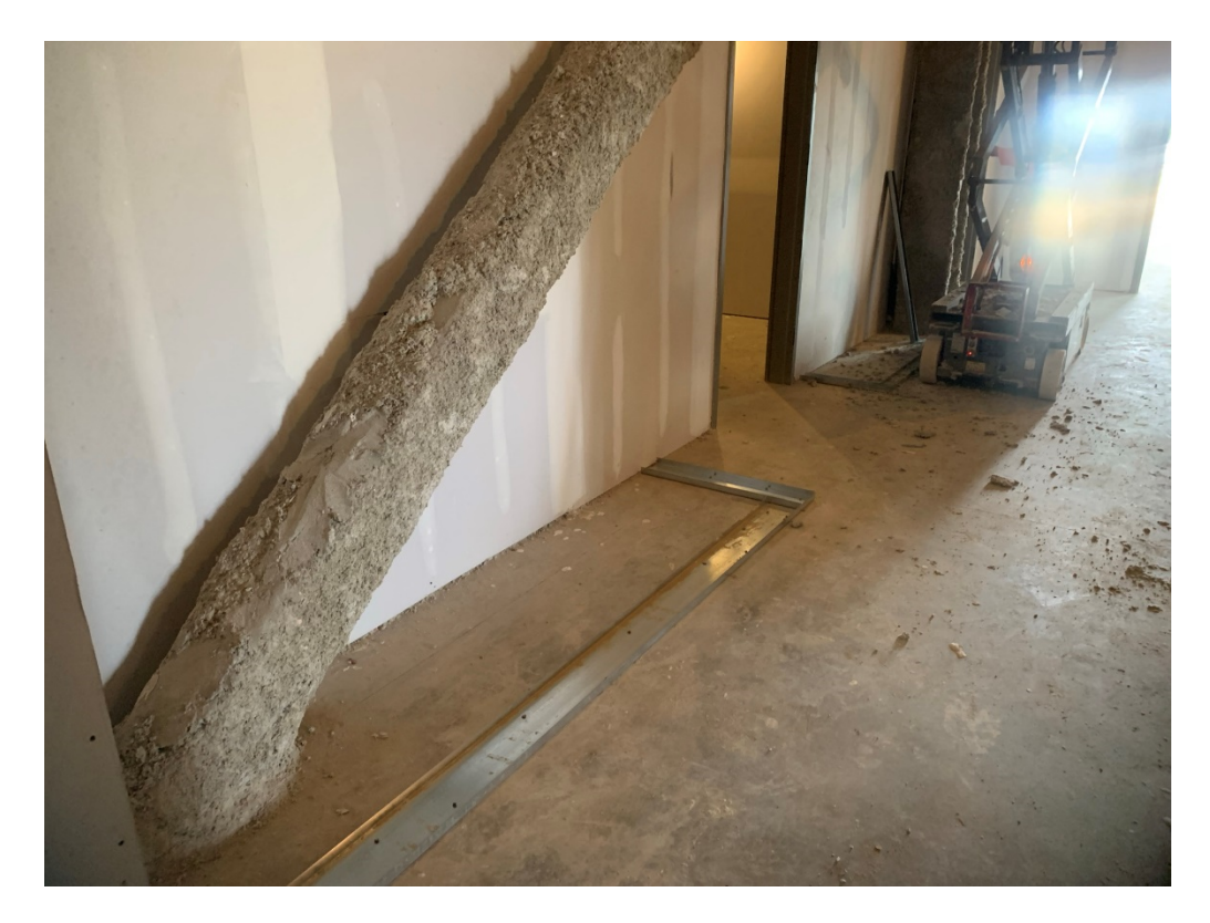
Figure 7 – Framing at the first floor is ongoing