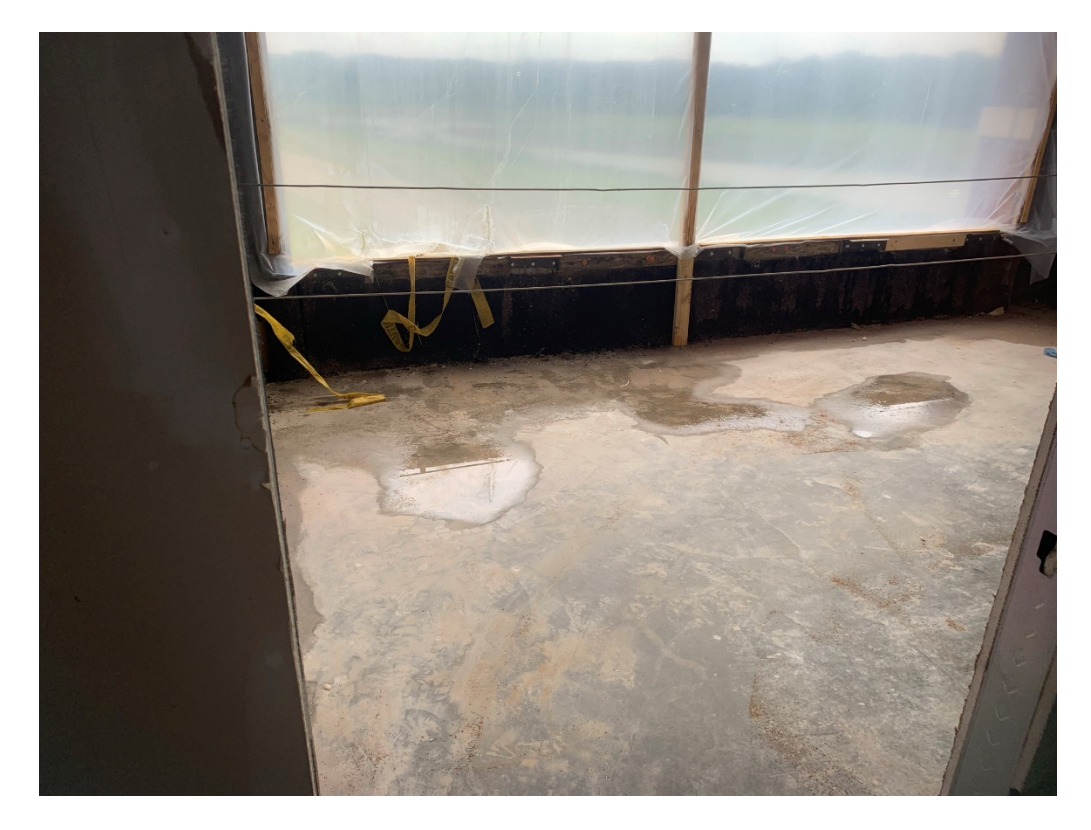
Figure 11 – Water Intrusion is ongoing