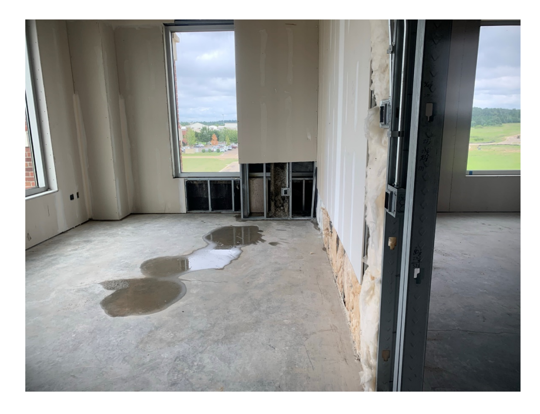
Figure 12 – Water Intrusion is ongoing