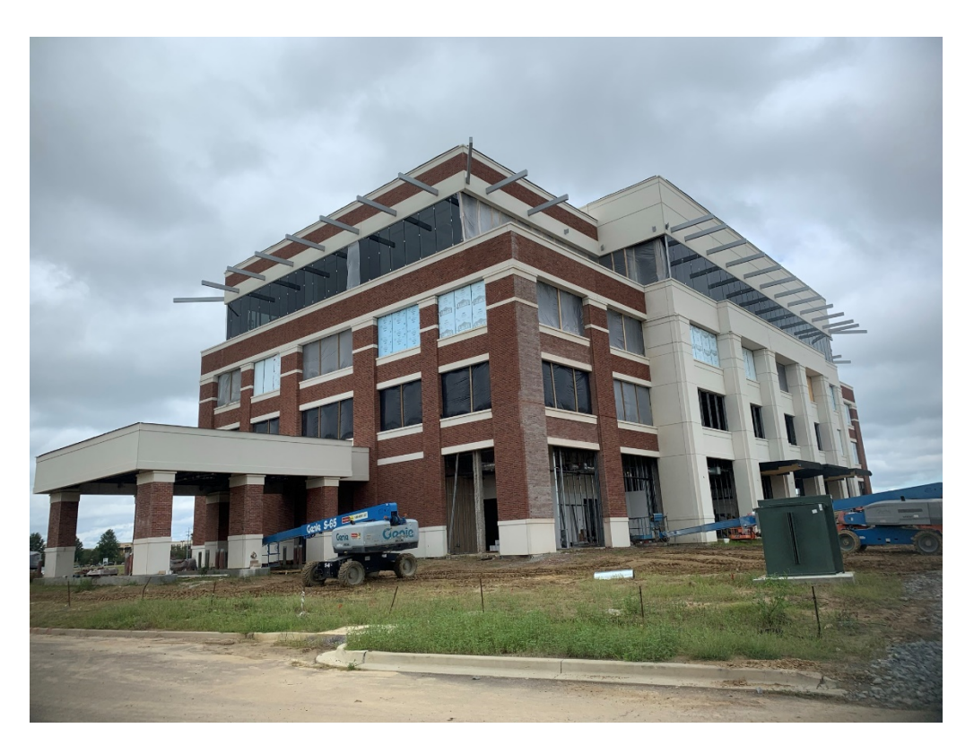
Figure 4 – South Façade