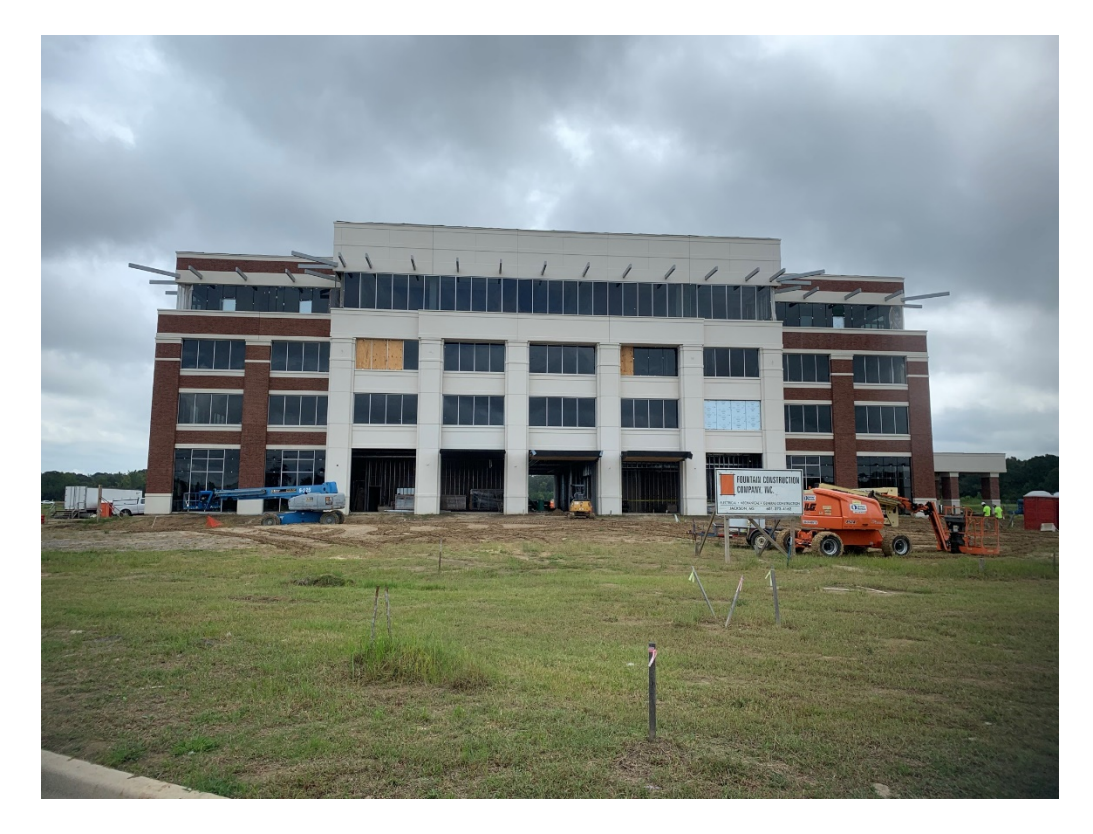
Figure 1 – West Façade Progress