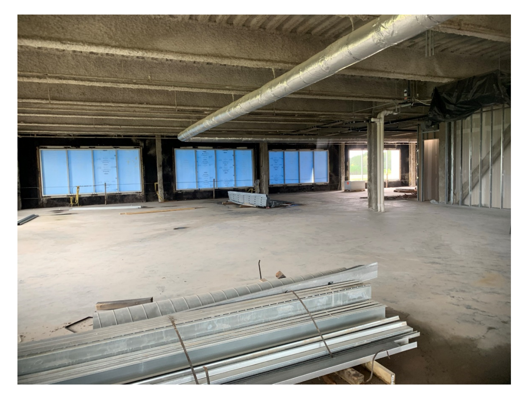
Figure 9 – rigid insulation installed at windows