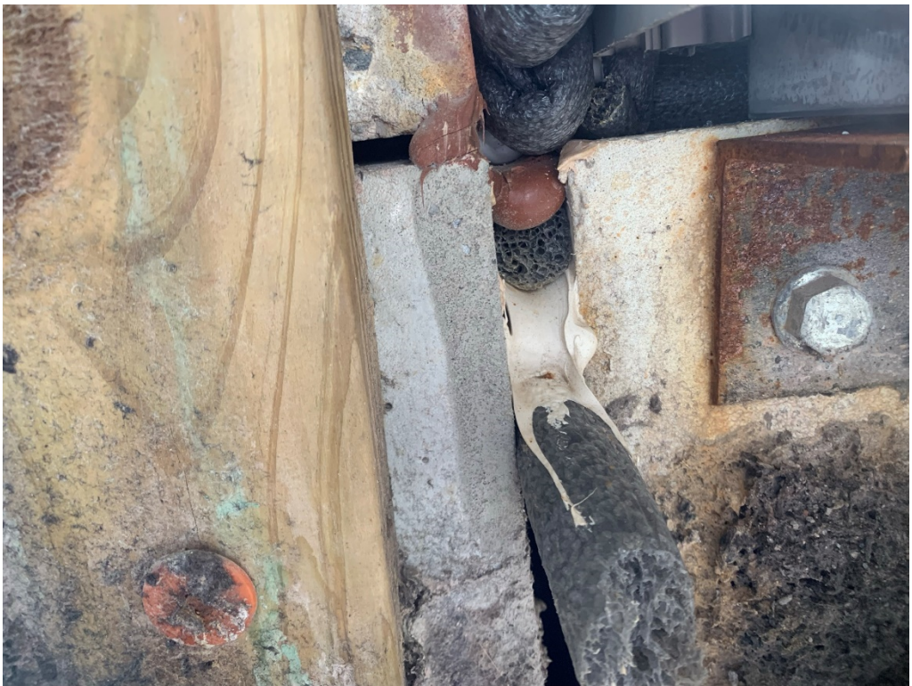
Figure 8 – Evidence of Correct Mastic Installation