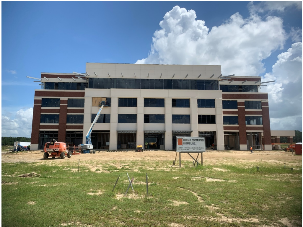
Figure 1 – West Façade Progress