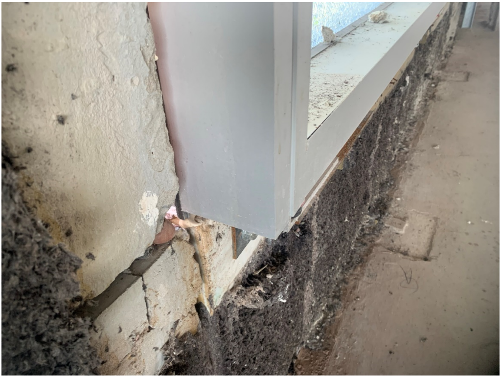
Figure 9 – 2 nd Floor North Unit; check for plumbness (recess appears to vary)