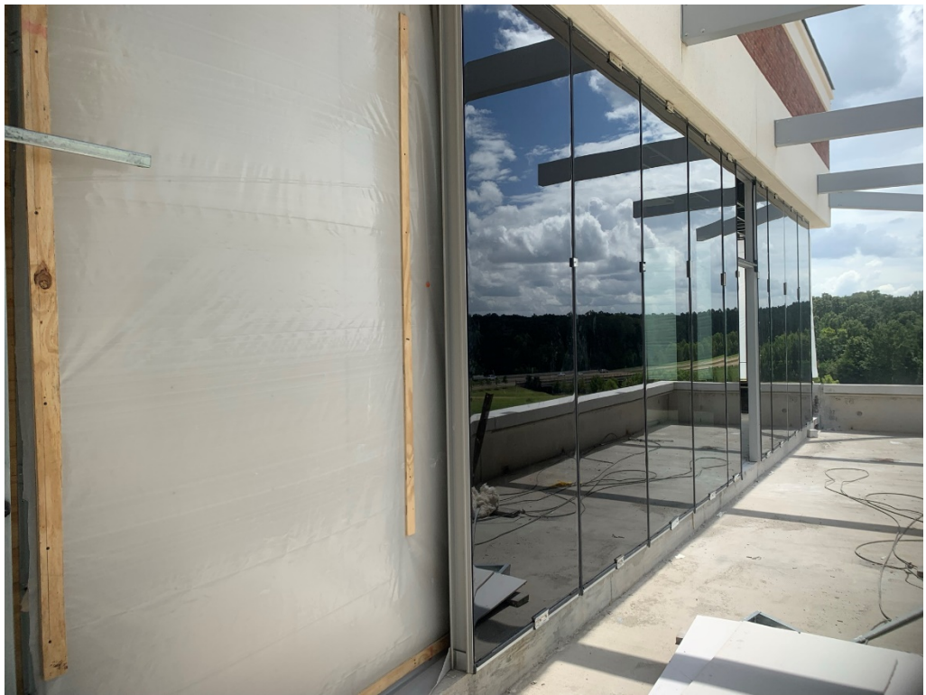
Figure 12 – Window Curtain install at 4 th floor SW