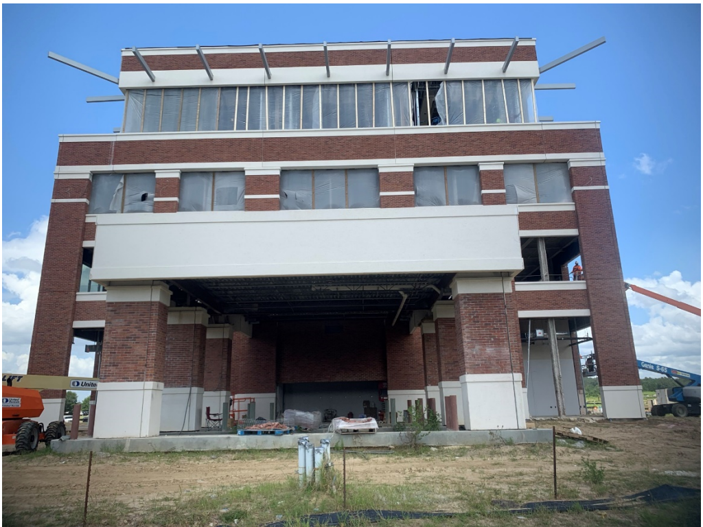
Figure 6 – South Façade