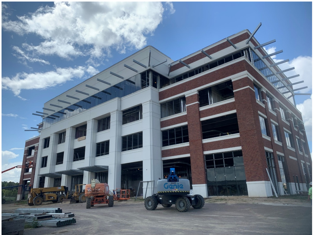
Figure 4 – NE Corner