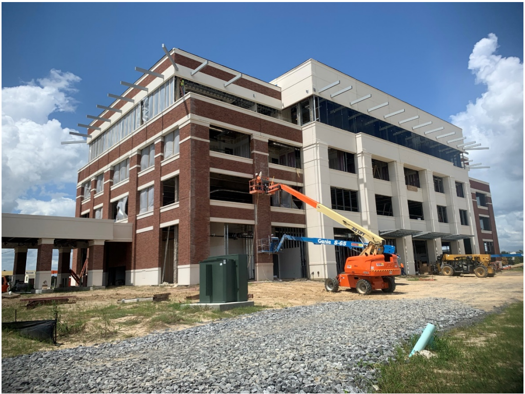
Figure 5 – SE Corner