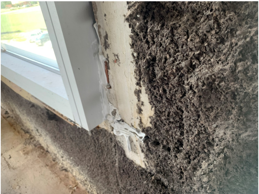
Figure 10 – 2 nd Floor North Unit; check for plumbness (recess appears to vary)