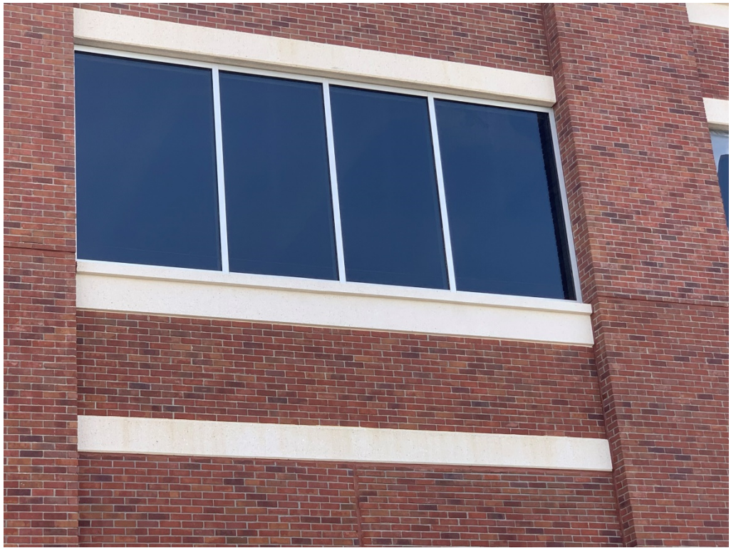
Figure 3 – Curtain Trim Install has begun