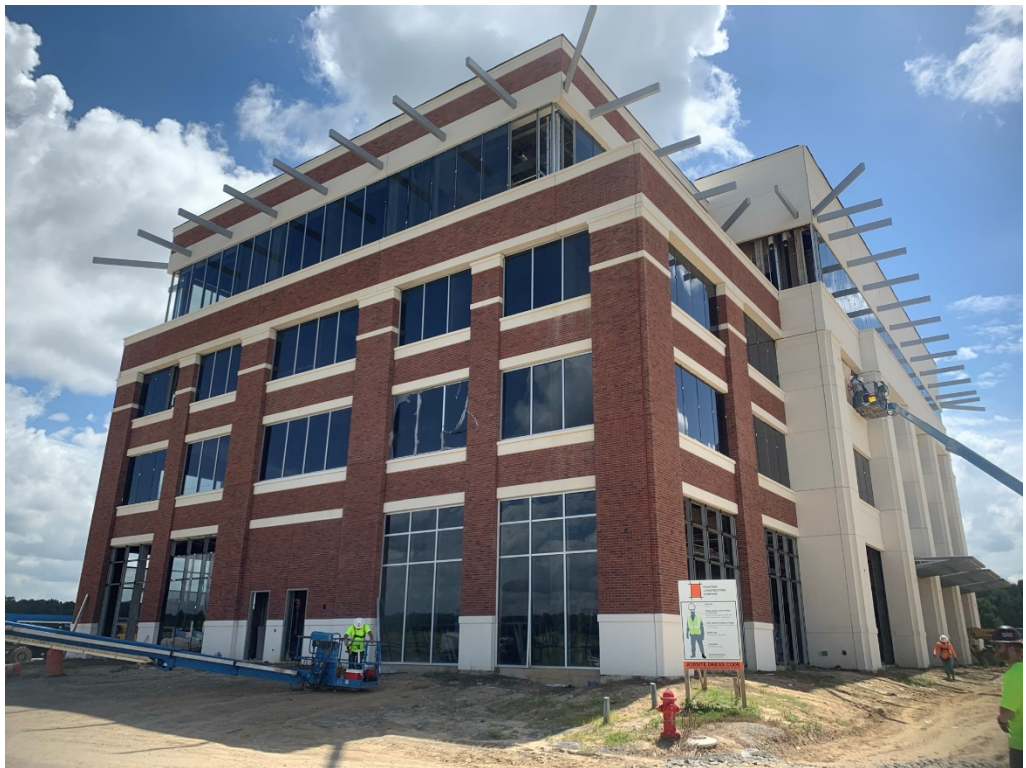
Figure 2 – North Façade Progress