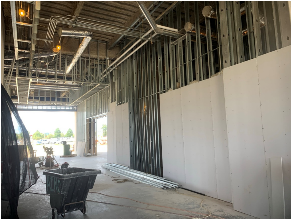
Figure 7 – 1 st Floor Drywall is Ongoing