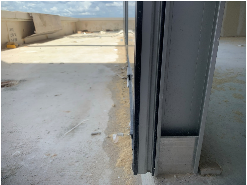
Figure 14 – 4 th Floor NW Curtain wall; check for straightness