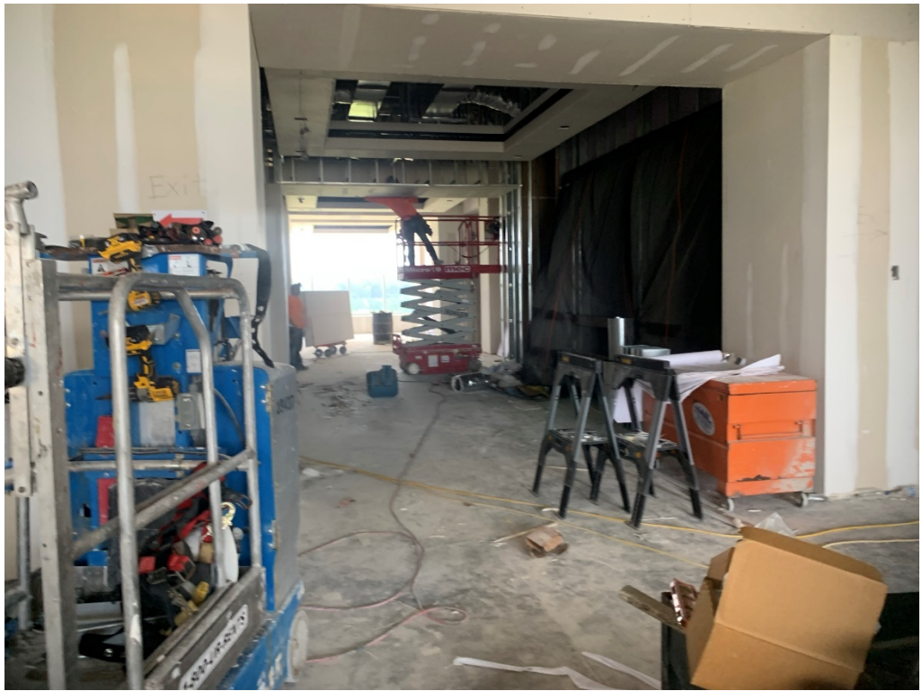
Figure 13 – 4 th floor sheetrock install is ongoing