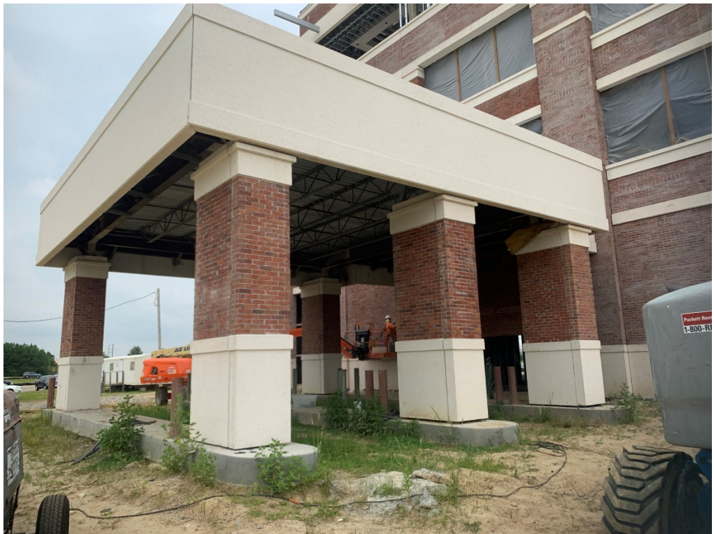
Figure 12 – Drive Thru Progress