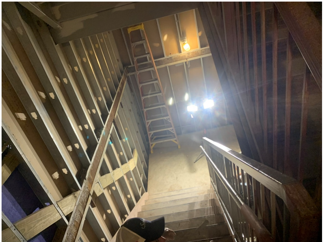
Figure 18 – North Stairwell Handrail getting first coat of paint