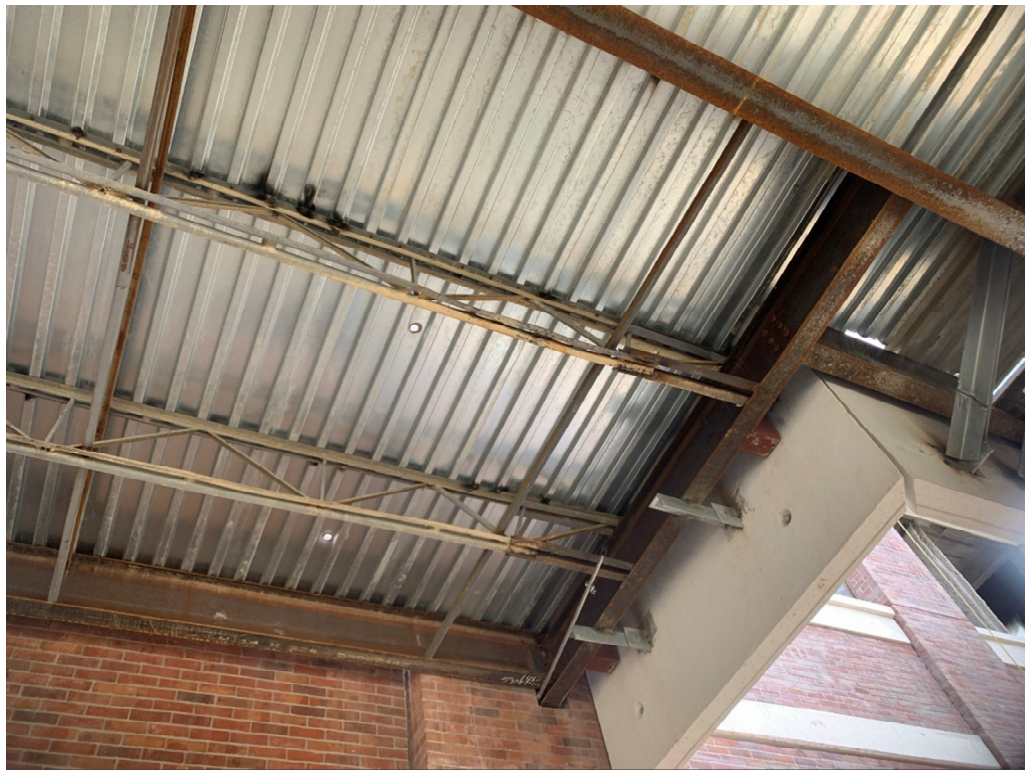
Figure 14 – Structural Repair at Drive Thru