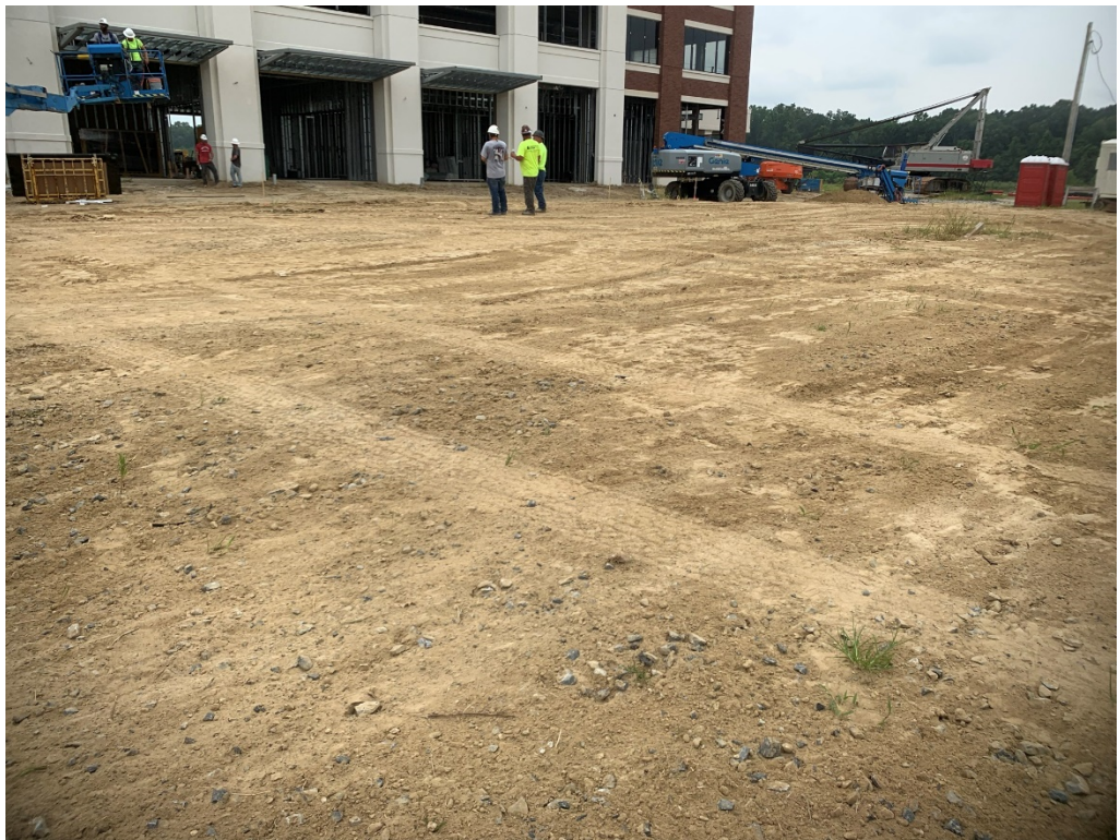
Figure 10 – West Front Yard Grading and Clean Up