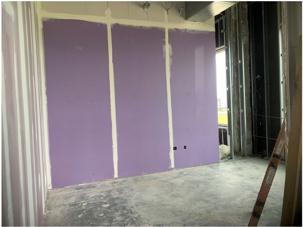
Figure 17 – Drywall hanging and finishing is ongoing