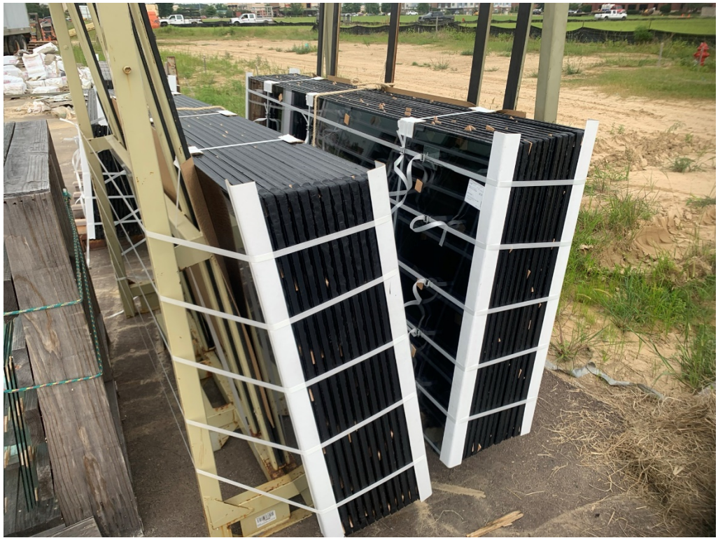
Figure 3 – Received Glazing