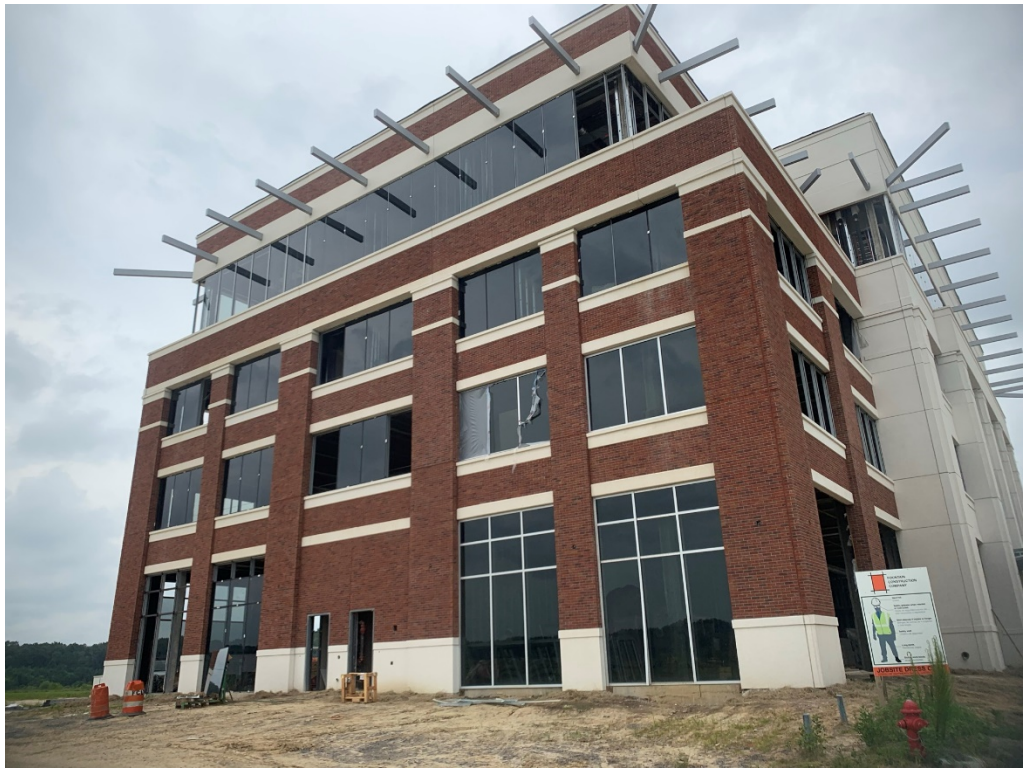
Figure 7 – North Façade Glazing Progress