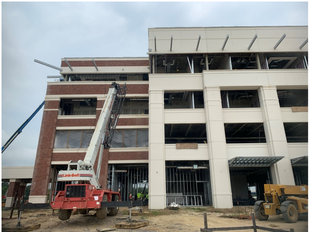
Figure 8 – Reinstalled and Straightened Panels (appear in good condition)