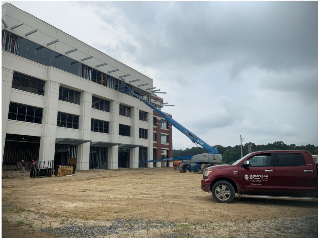
Figure 1 – Glazing Install is Ongoing