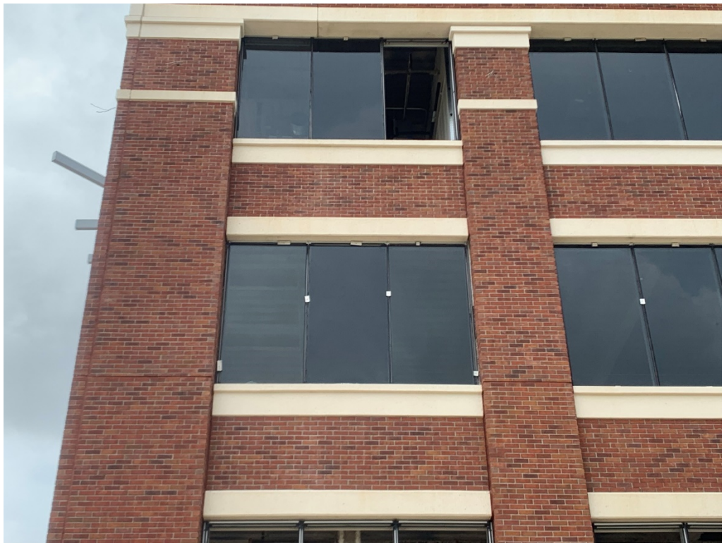
Figure 16 – Spandrel Glass Panels from Outside