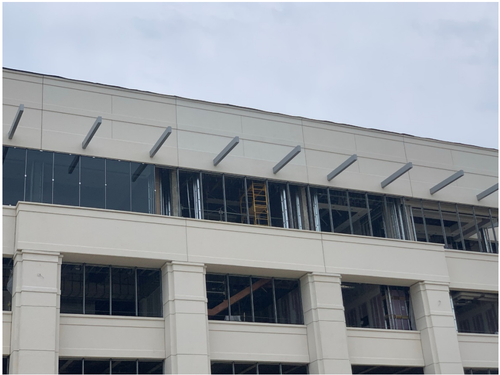
Figure 9 – Discolored Panel Remediation is Ongoing