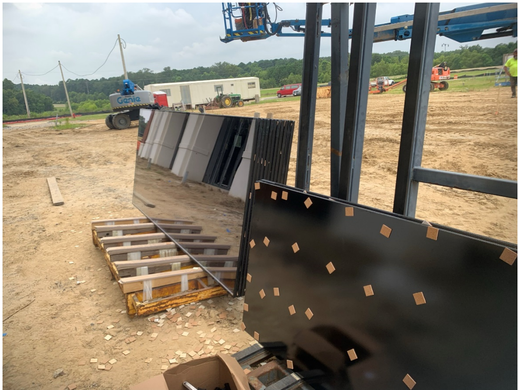
Figure 6 – Received Glazing