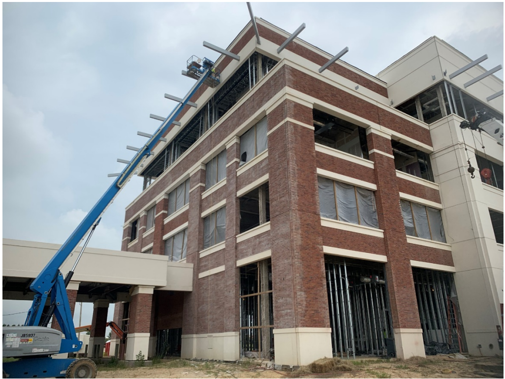
Figure 11 – Remediation work is Ongoing