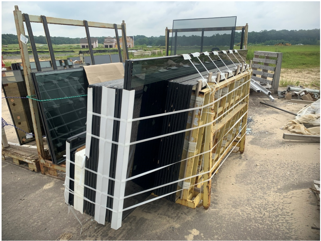
Figure 5 – Received Glazing