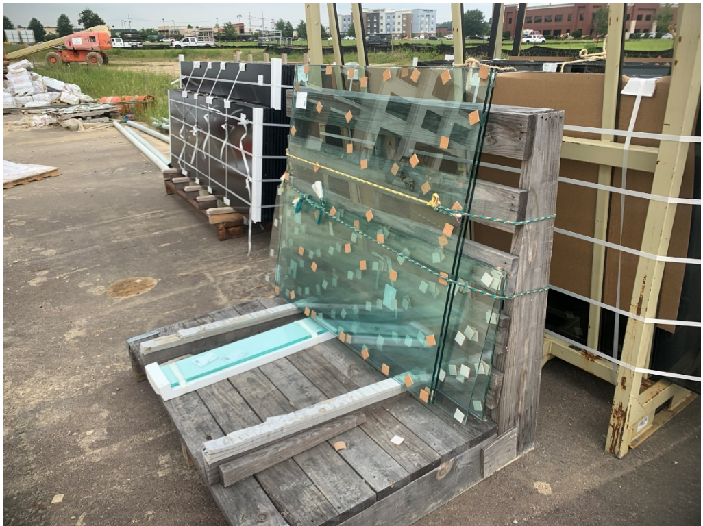
Figure 4 – Received Glazing