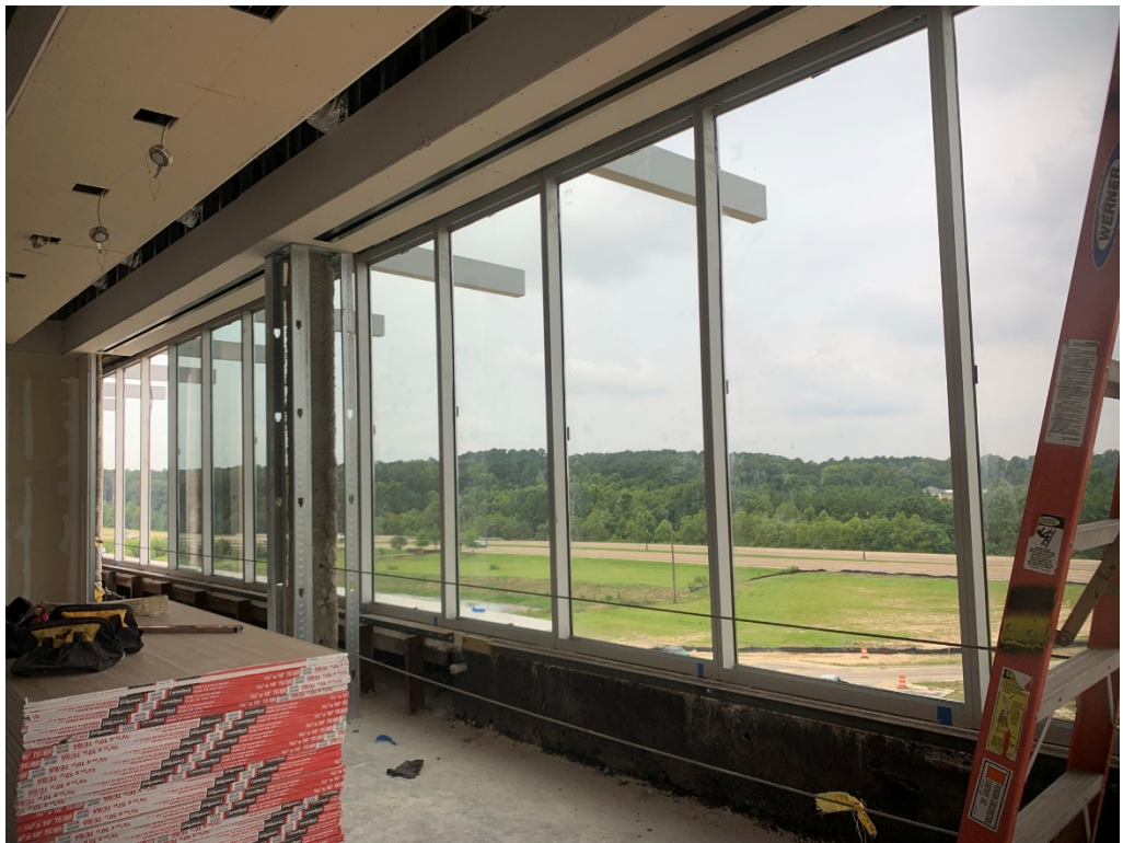
Figure 20 – Glass Installation @ Curtain Wall Top Floor