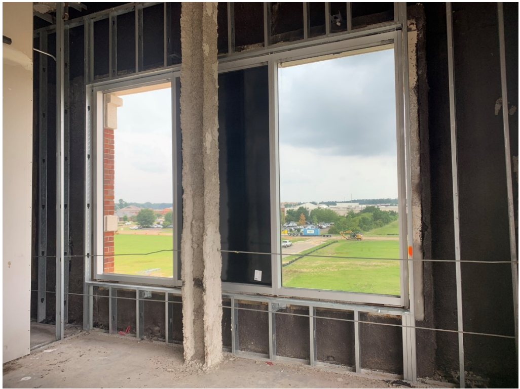
Figure 15 – Spandrel Glass Panels installed at Column Glazing