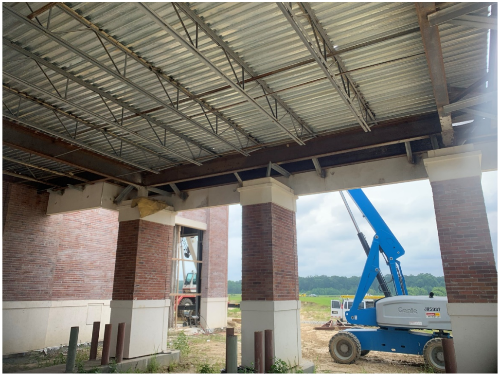
Figure 13 – Structure @ Drive Thru