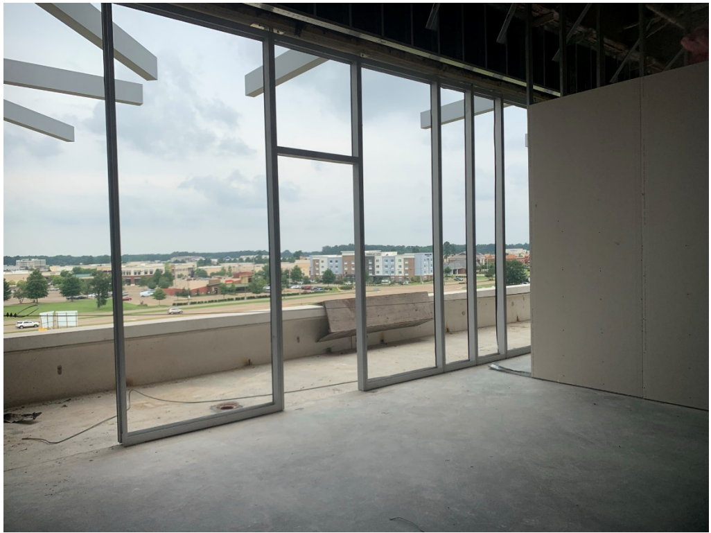
Figure 19 – Curtain Wall Progress at Office 4111