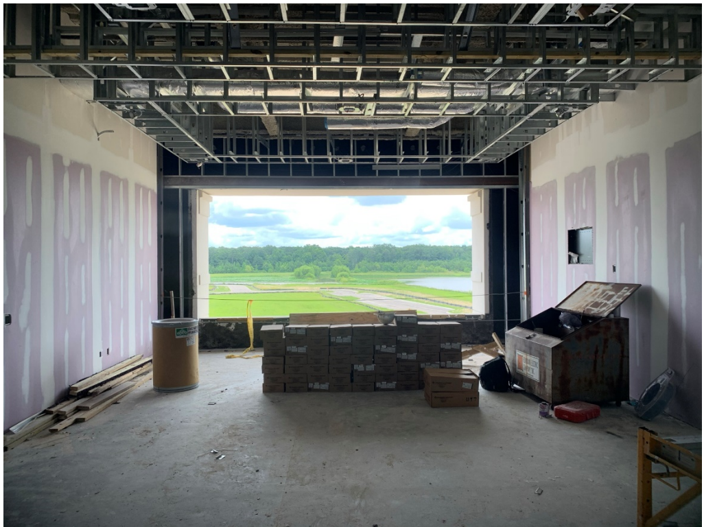
Figure 8 – Drywall finishing at 3 rd Floor