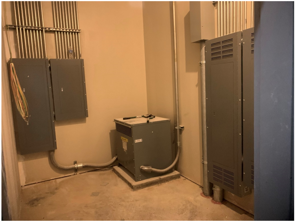
Figure 7 – Electrical at 3 rd Floor 3010