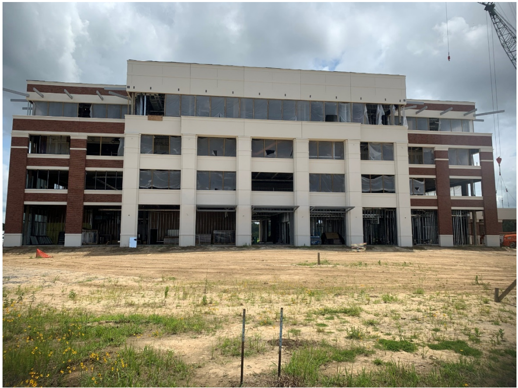
Figure 1 – Front Façade Progress