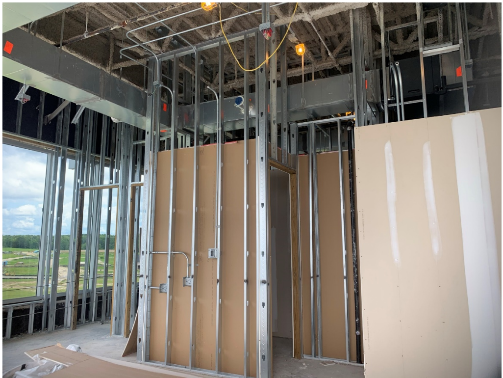
Figure 14 – 4 th Floor Northeast section drywall is ongoing