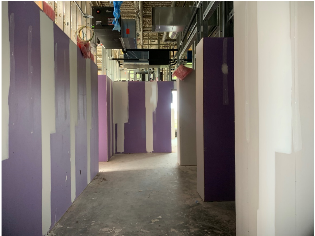
Figure 11 – Drywall finishing is also in progress at 4 th floor