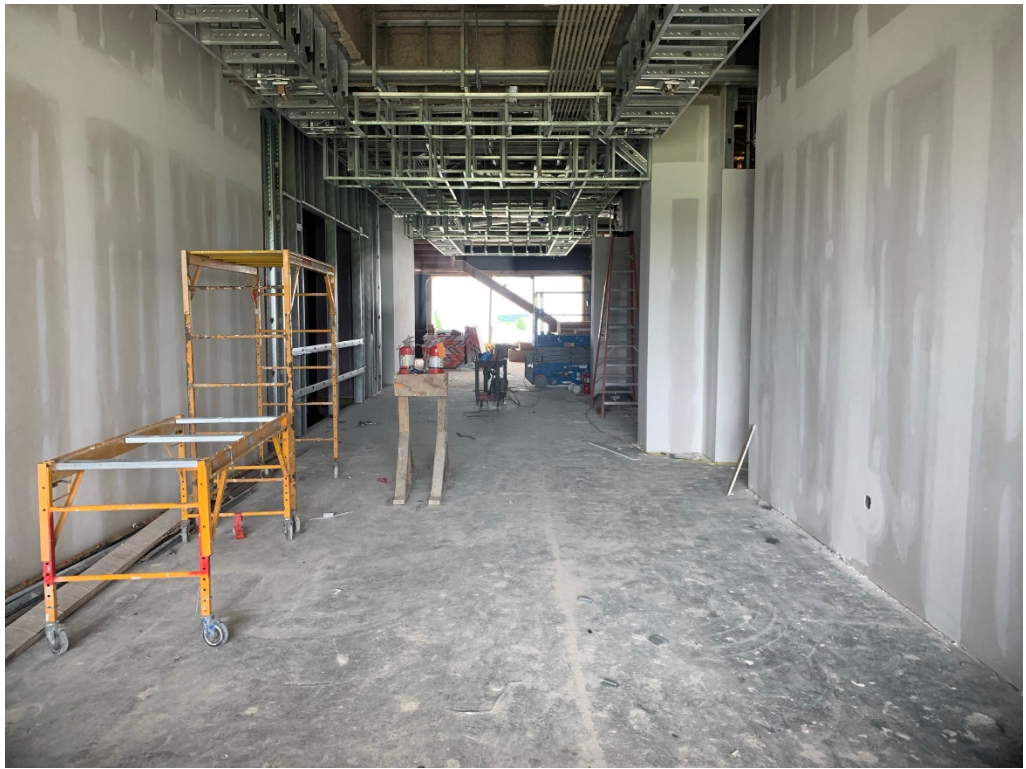
Figure 9 – Drywall finishing at 3 rd Floor