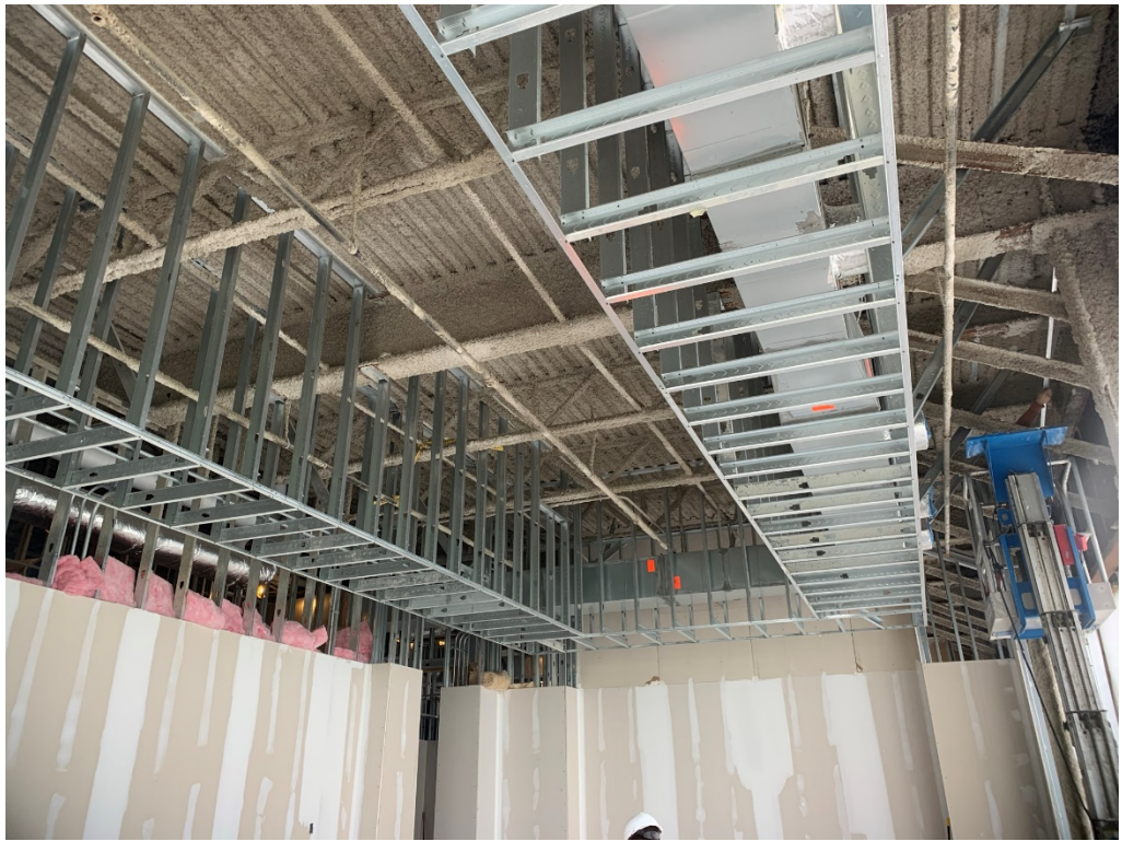
Figure 13 – Framing at Boardroom is Ongoing