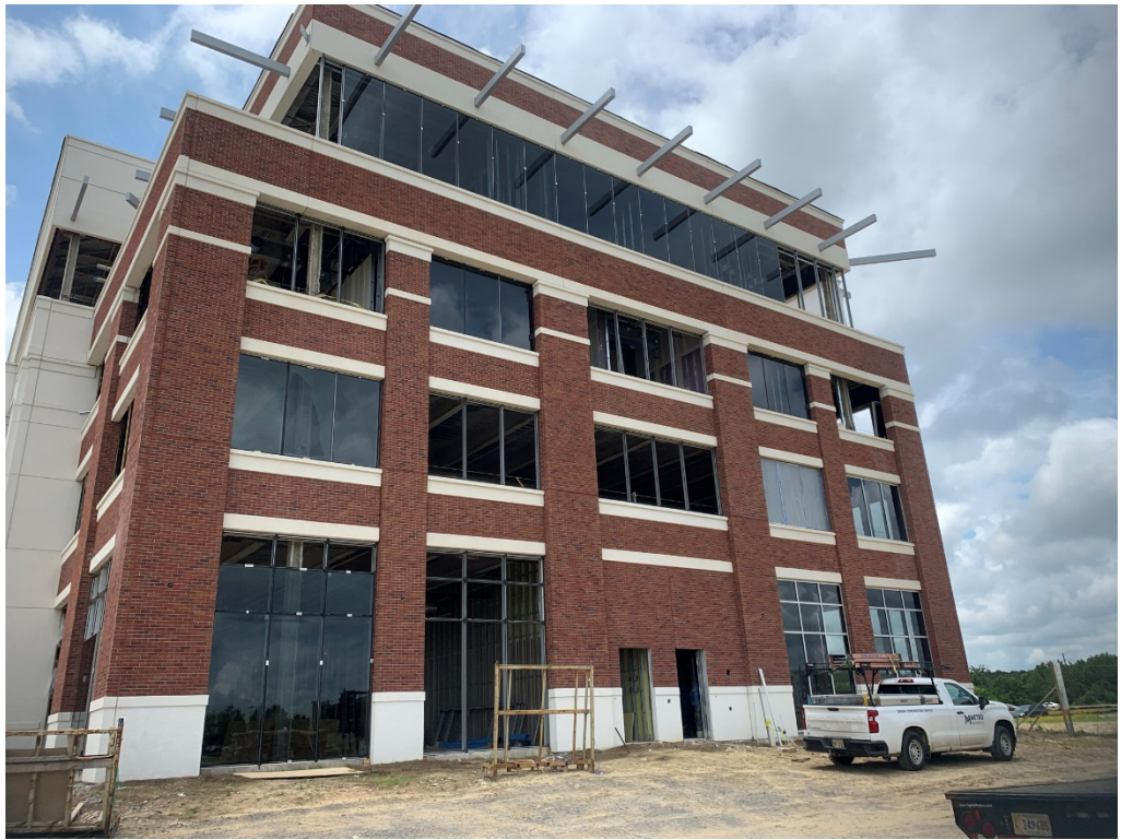
Figure 3 – Glazing Progress at North Facade