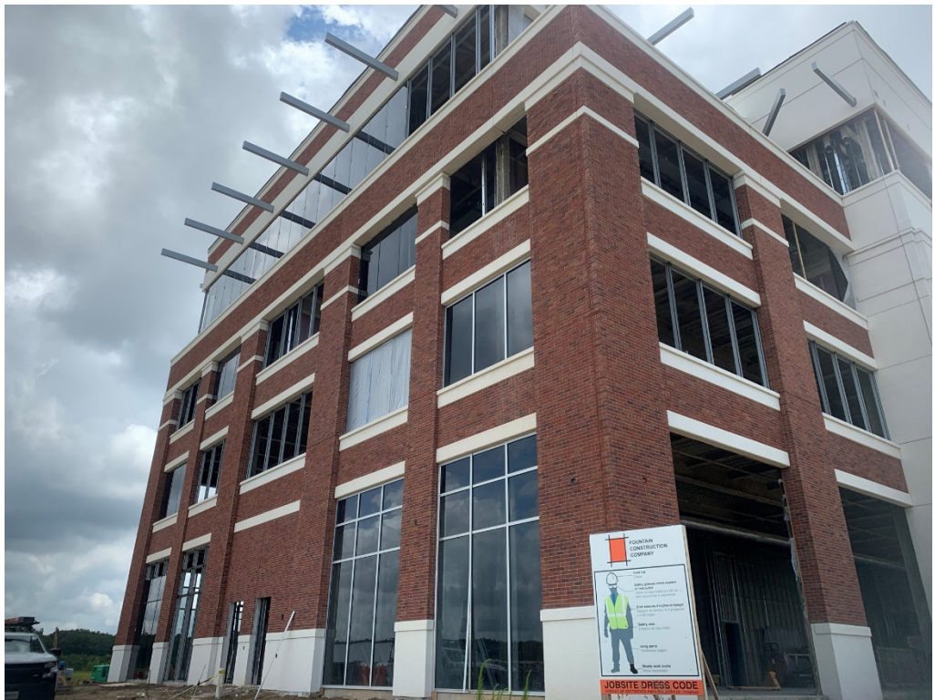
Figure 2 – Glazing Progress at North Facade