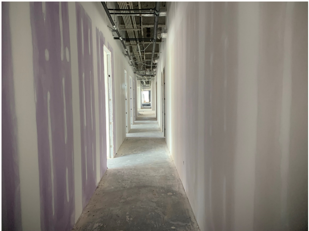
Figure 10 – Drywall finishing at 3 rd Floor