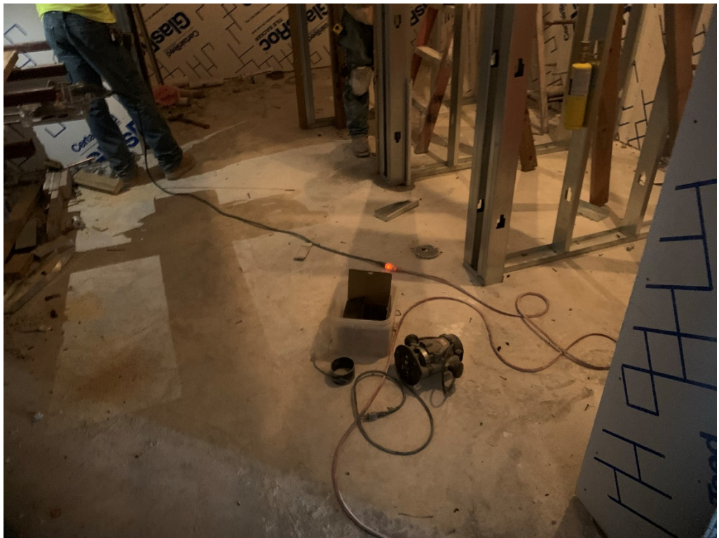
Figure 16 – 4 th Floor Bathroom Bank continued Framing