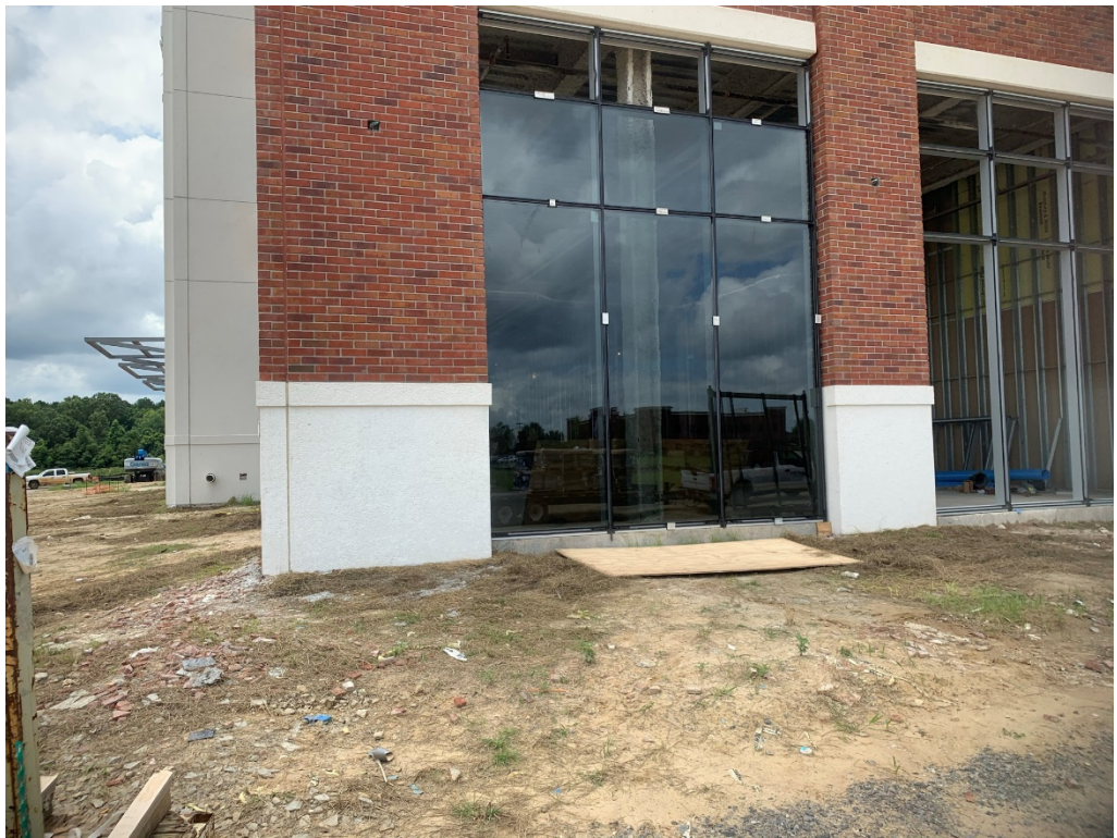
Figure 4 – NE Patch looks much better