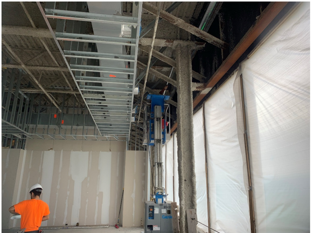
Figure 12 – Progress at Front Façade on the 1 st