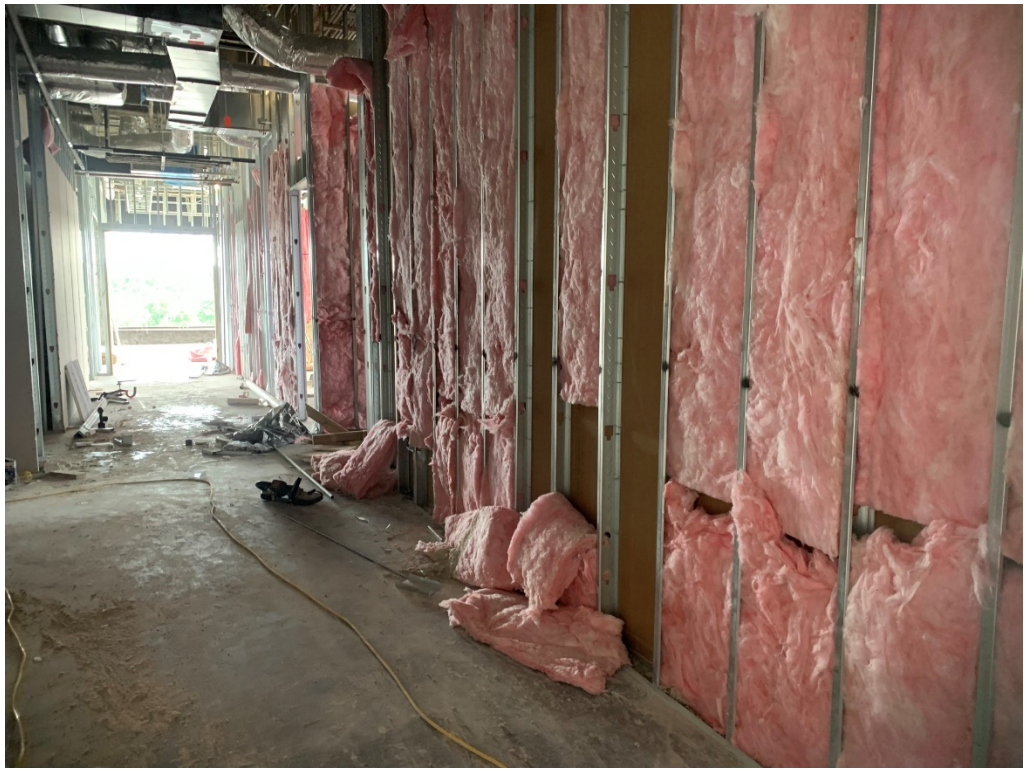
Figure 17 – South Section of Fourth Floor drywall install still ongoing