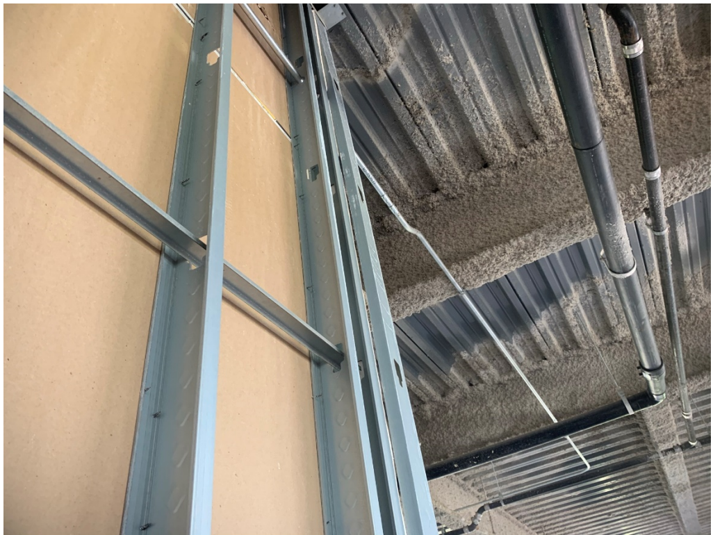
Figure 6 – Corner Framing needs to be locked in with neighboring member at NE corner at 2 nd Floor