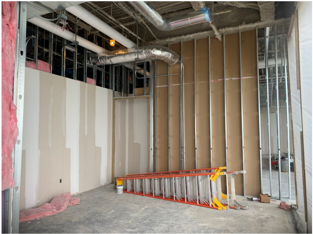
Figure 15 – Drywall Install is Ongoing at 4 th Floor