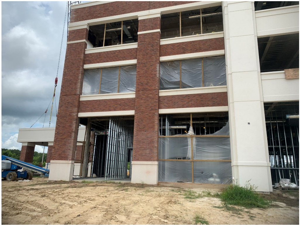
Figure 5 – Masonry is Ongoing