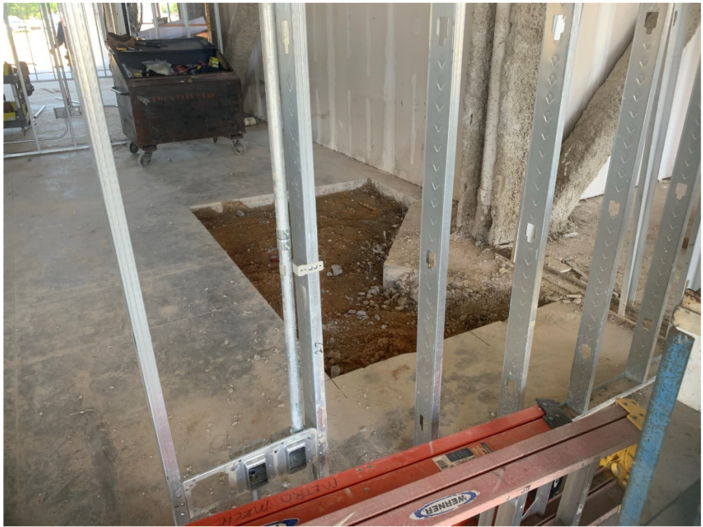
Figure 5 – Excavation Area Cleaned Up