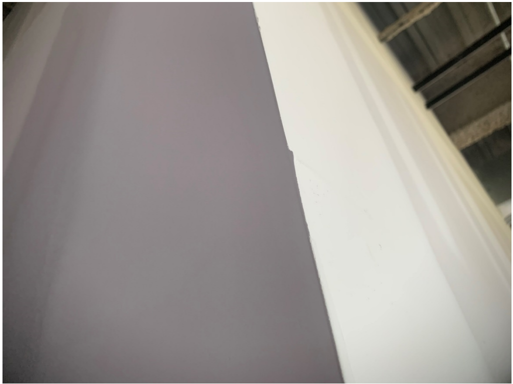
Figure 7 – Pay Special Attention to Corners for flatness and mud build up throughout