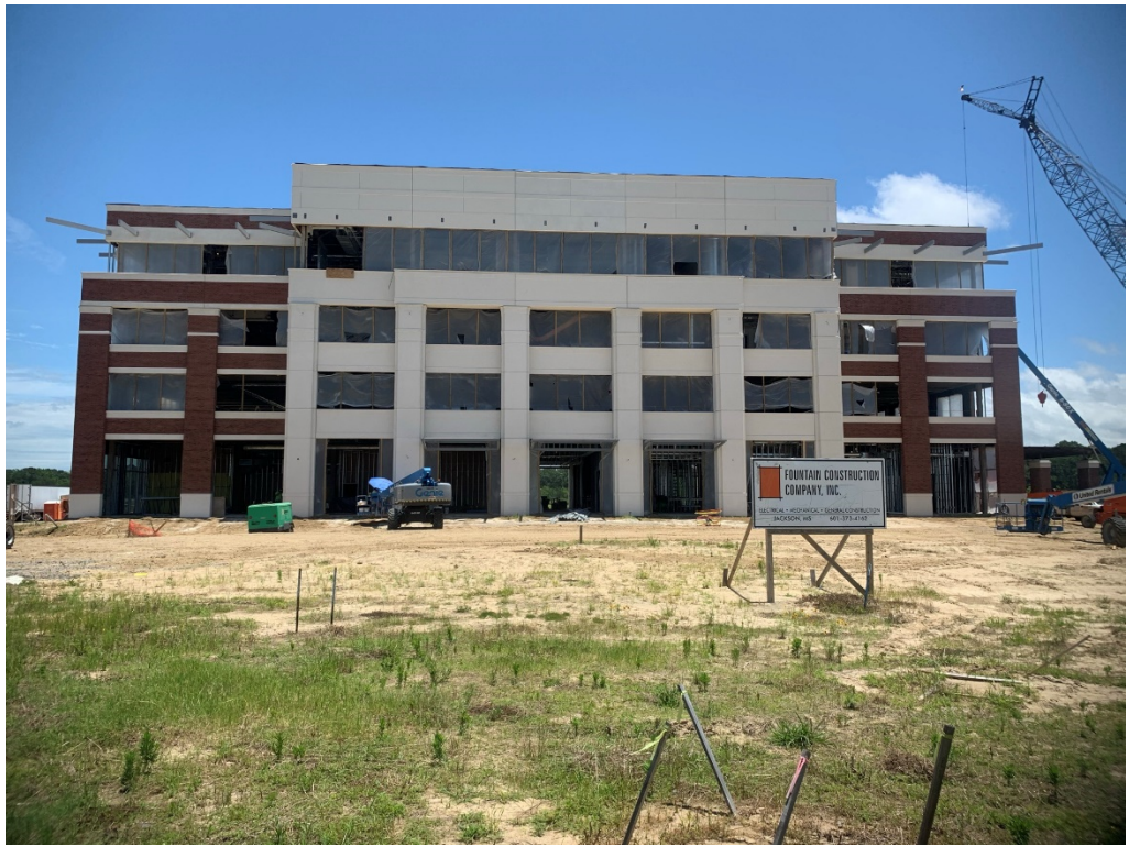
Figure 1 – West Elevation Progress