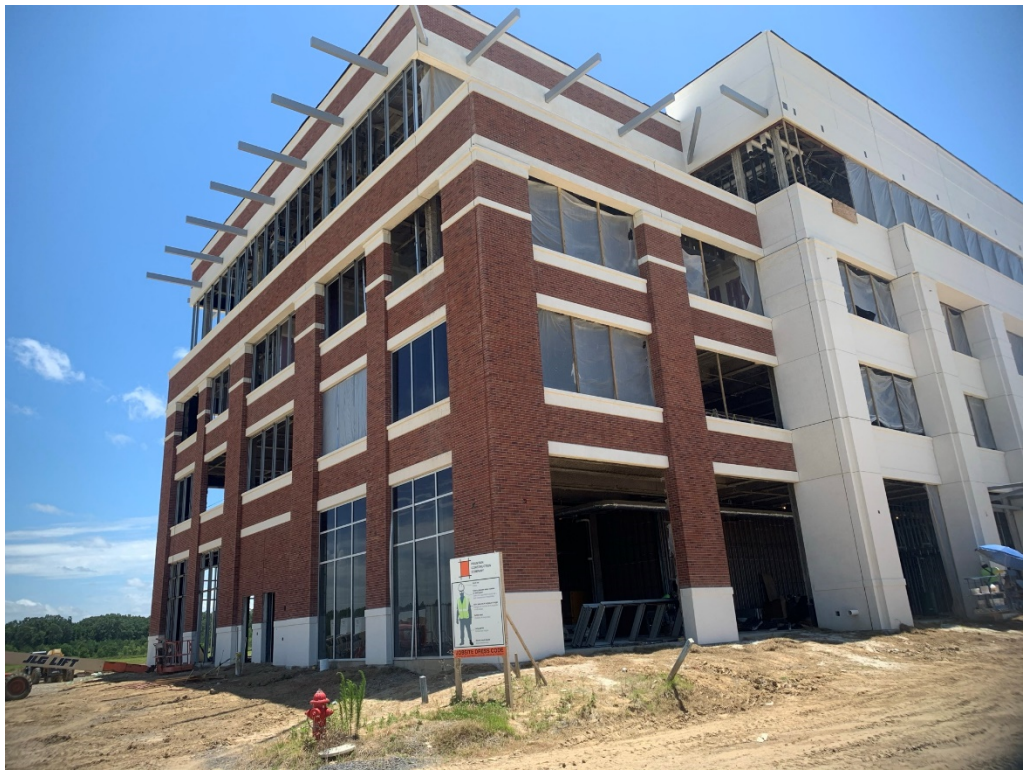
Figure 2 – Ongoing Work at North Façade