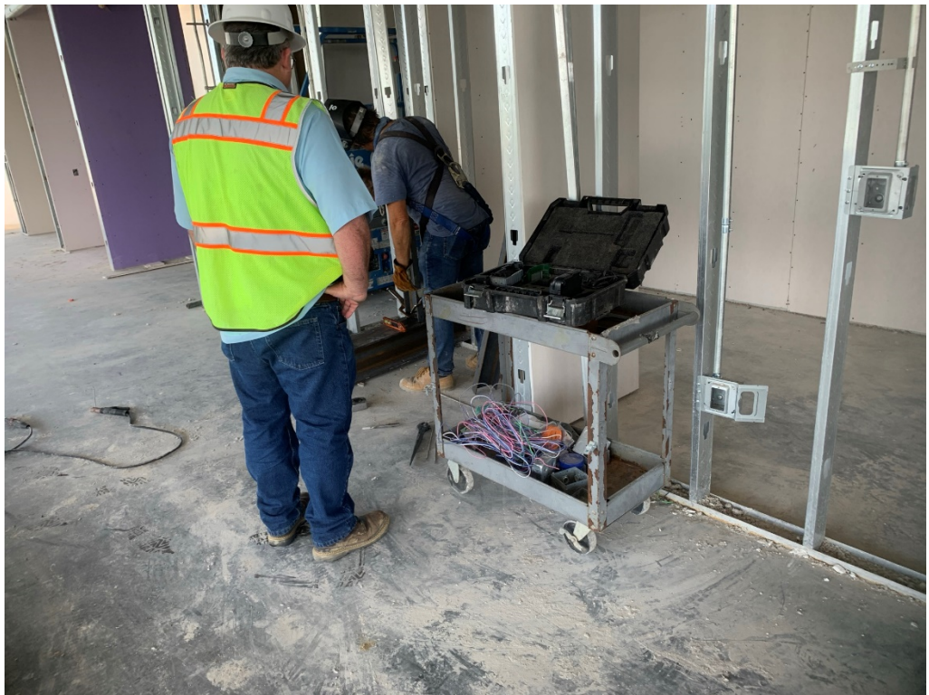
Figure 8 – Extended Steel Required for Redraw at Banquet