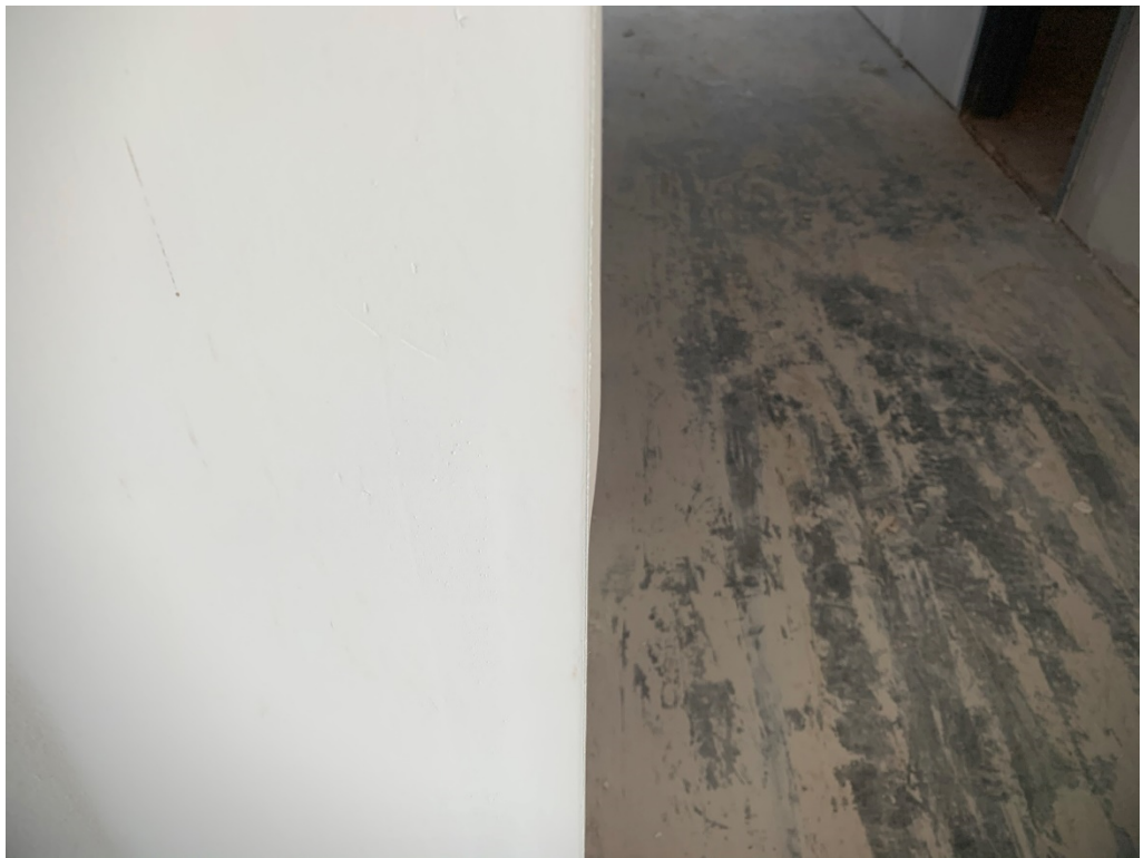
Figure 6 – Pay Special Attention to Corners for flatness and mud build up throughout