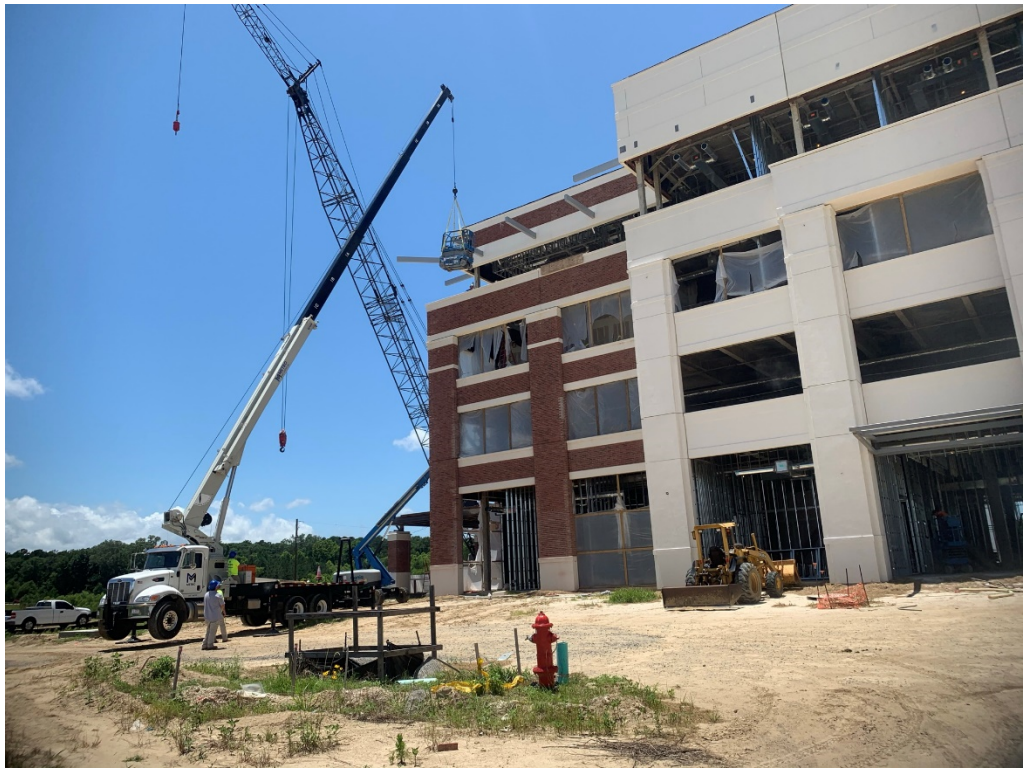
Figure 3 – Mechanical Installer De-Mobilizing