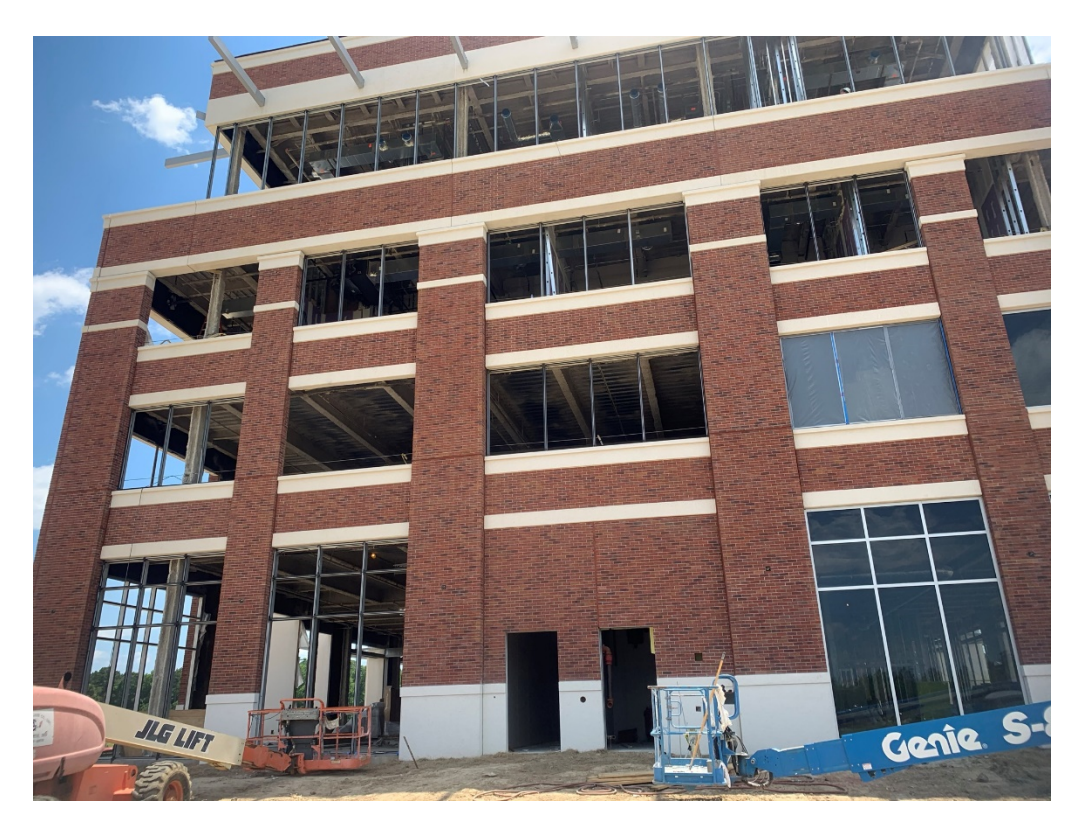
Figure 4 – North Façade Progress