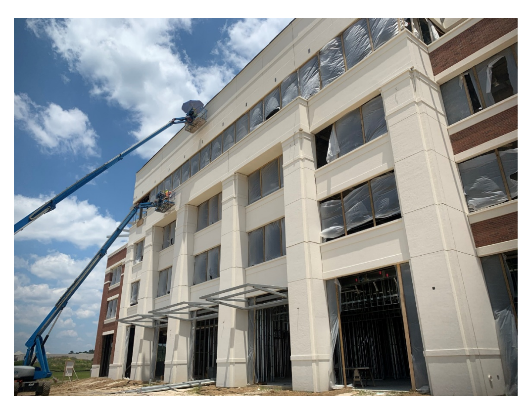
Figure 2 – Sealant Work is Ongoing