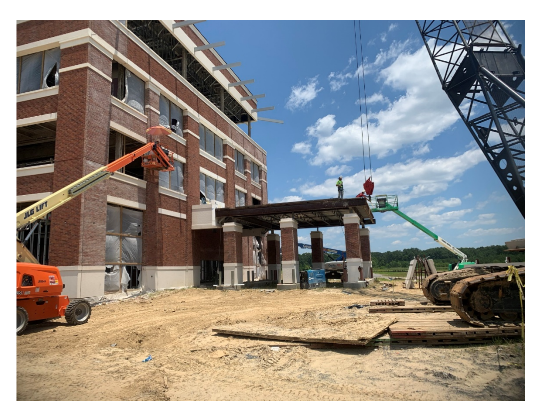
Figure 1 – Drive Thru Progress