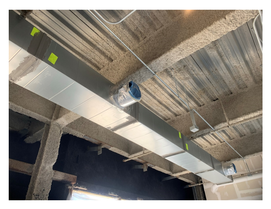
Figure 7 – Uncovered Ducting at 4<sup>th</sup> Floor