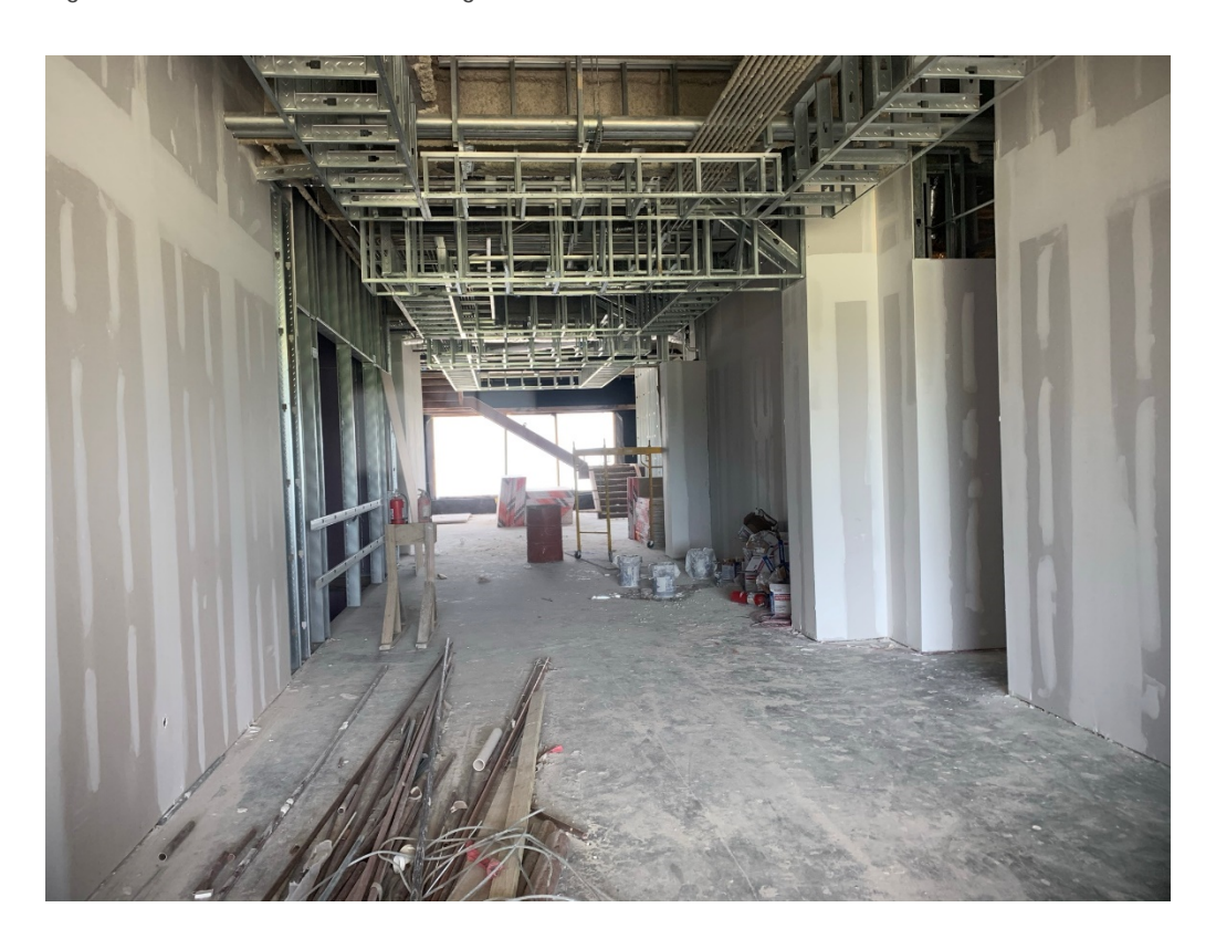
Figure 6 – Progress at 3<sup>rd</sup> Floor