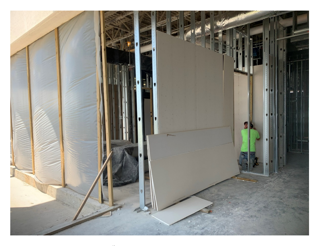
Figure 8 – Drywall Installers at 4<sup>th</sup> Floor