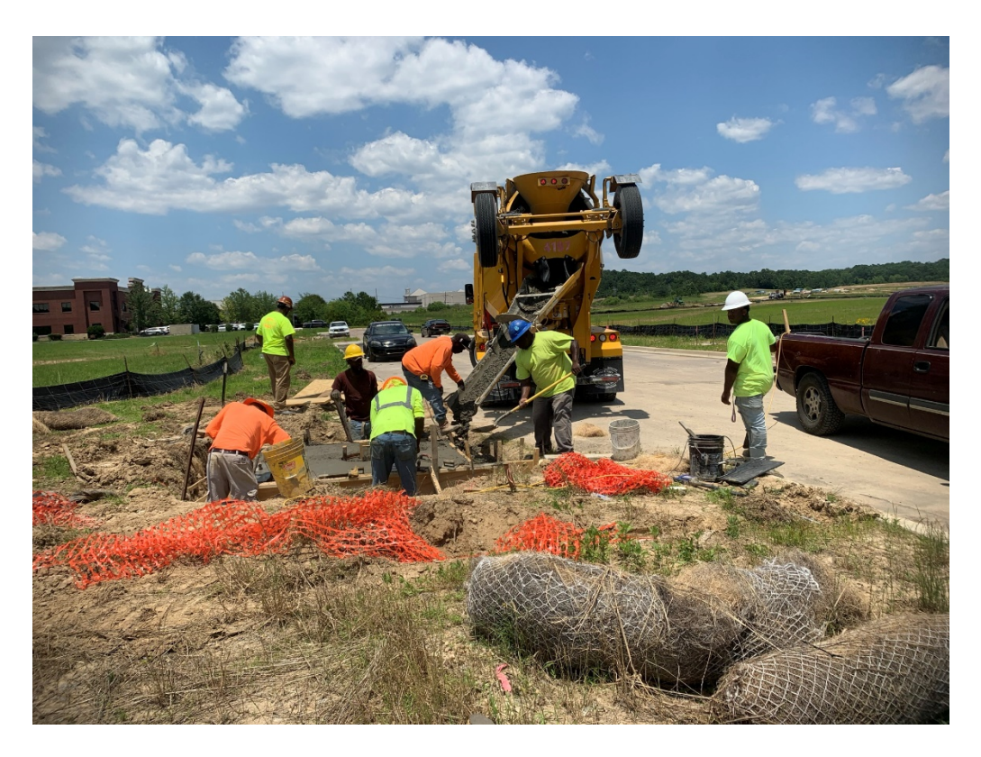
Figure 3 – Concrete Work at Site