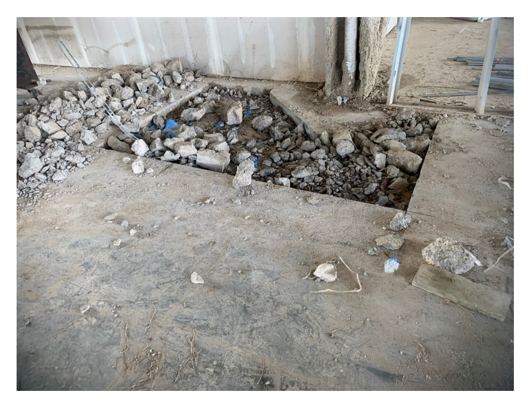
Figure 8 – Excavation at Employee Lounge