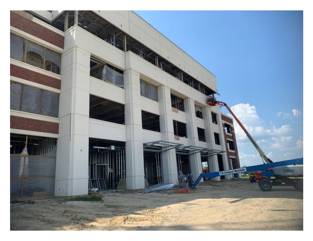
Figure 4 – Continued Work on Sealants at East Façade