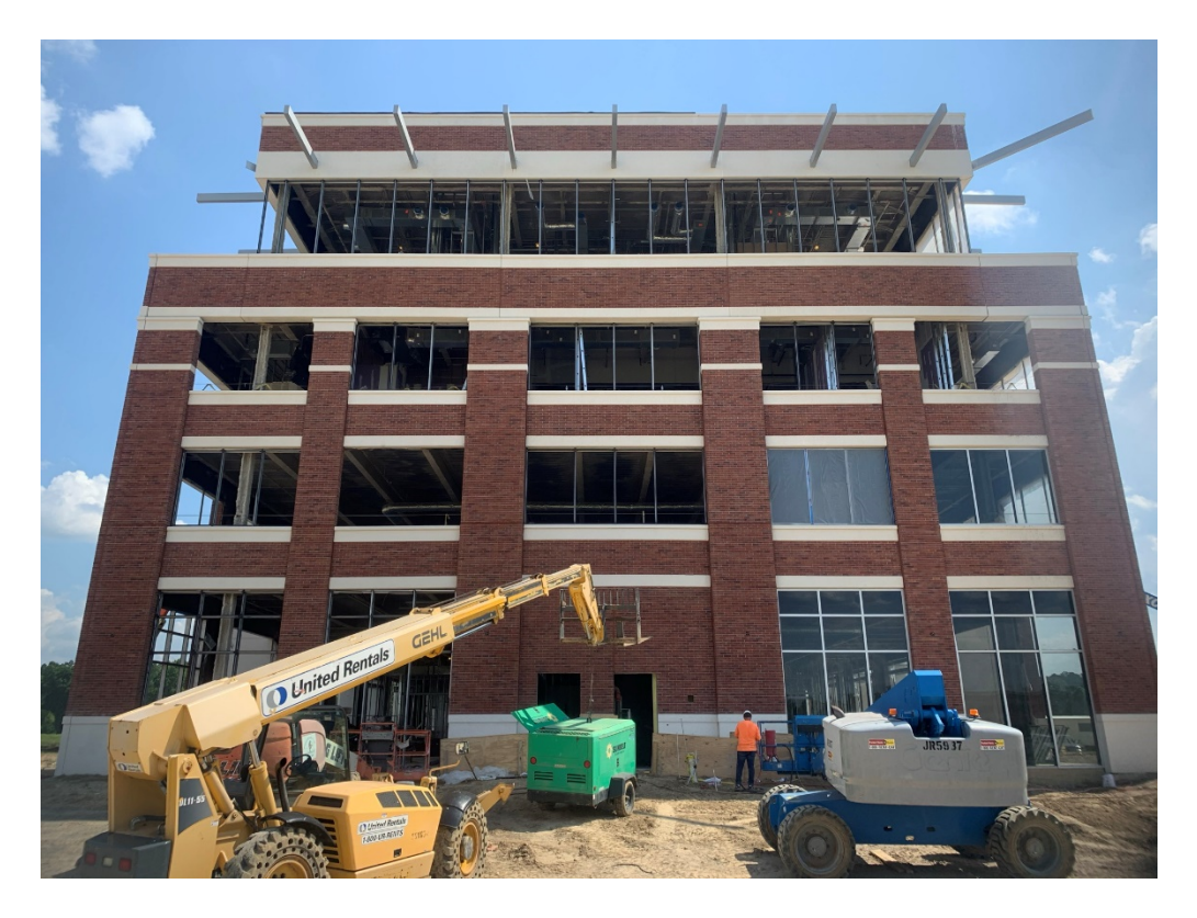
Figure 6 – North Elevation Progress