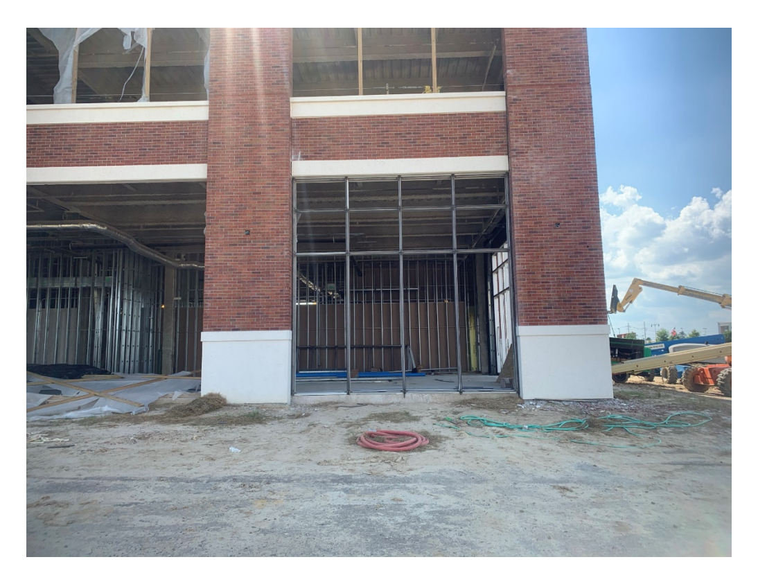
Figure 5 – Curtain Wall Install Ongoing