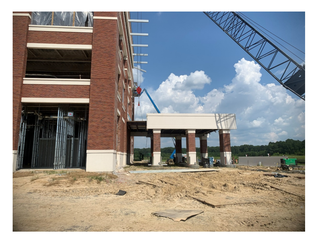
Figure 1 – Panel Install at Drive-Thru