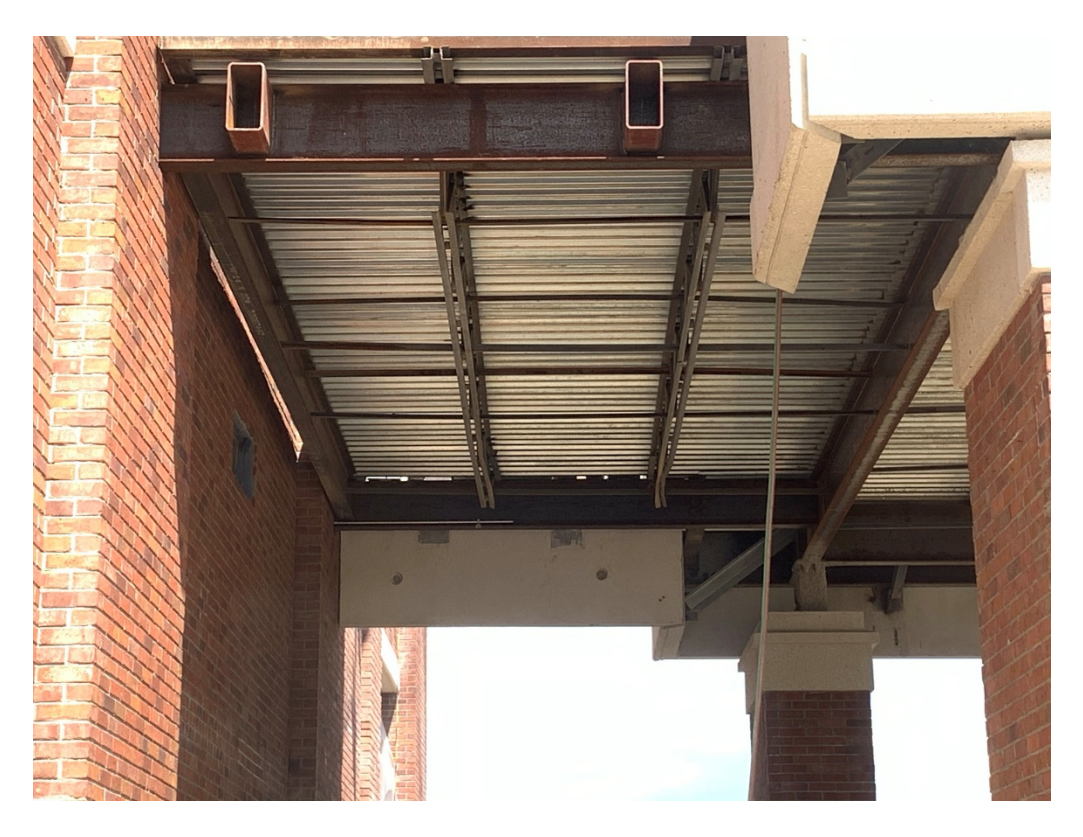
Figure 2 – Open Web joists Damaged and need straightening or replacement