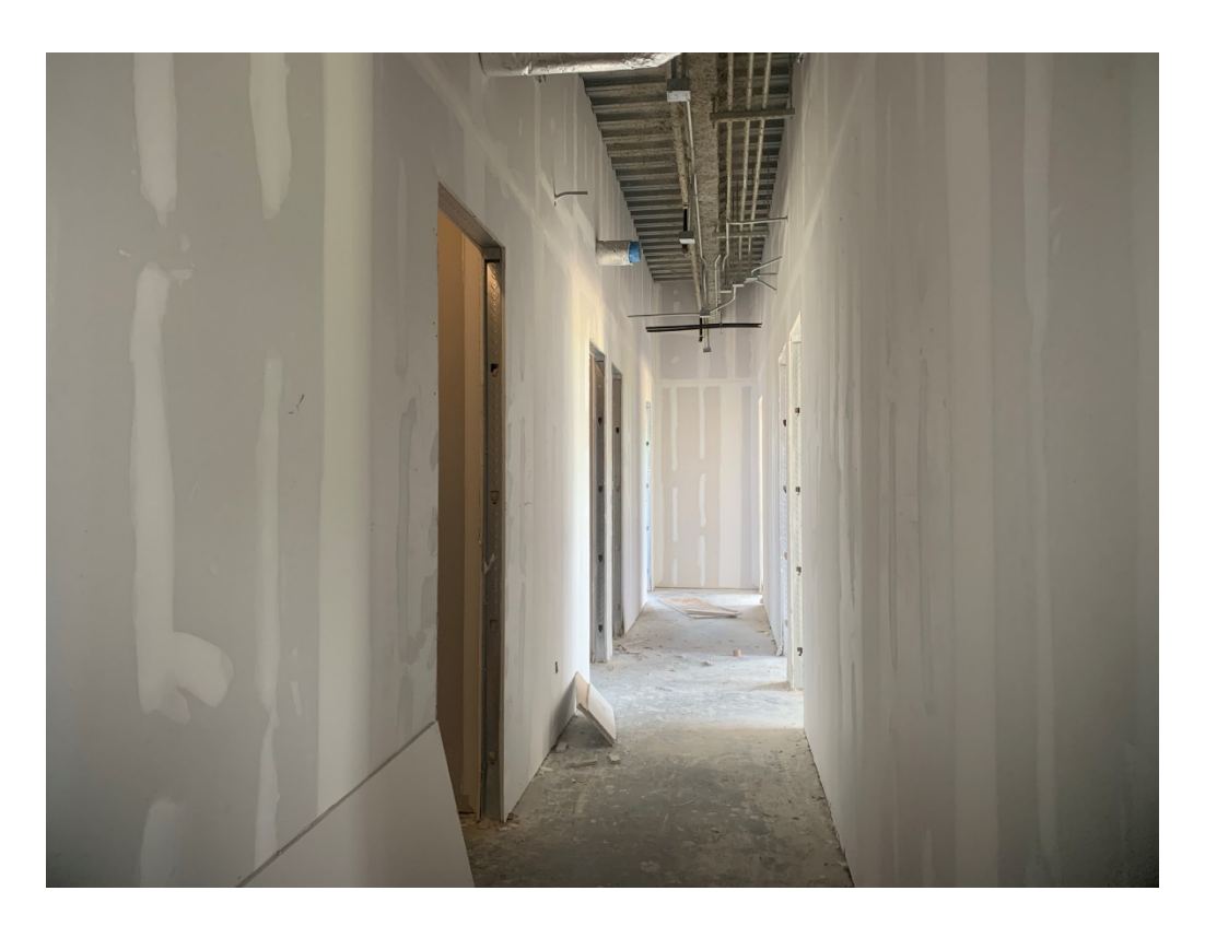
Figure 9 – 3<sup>rd</sup> Floor Progress