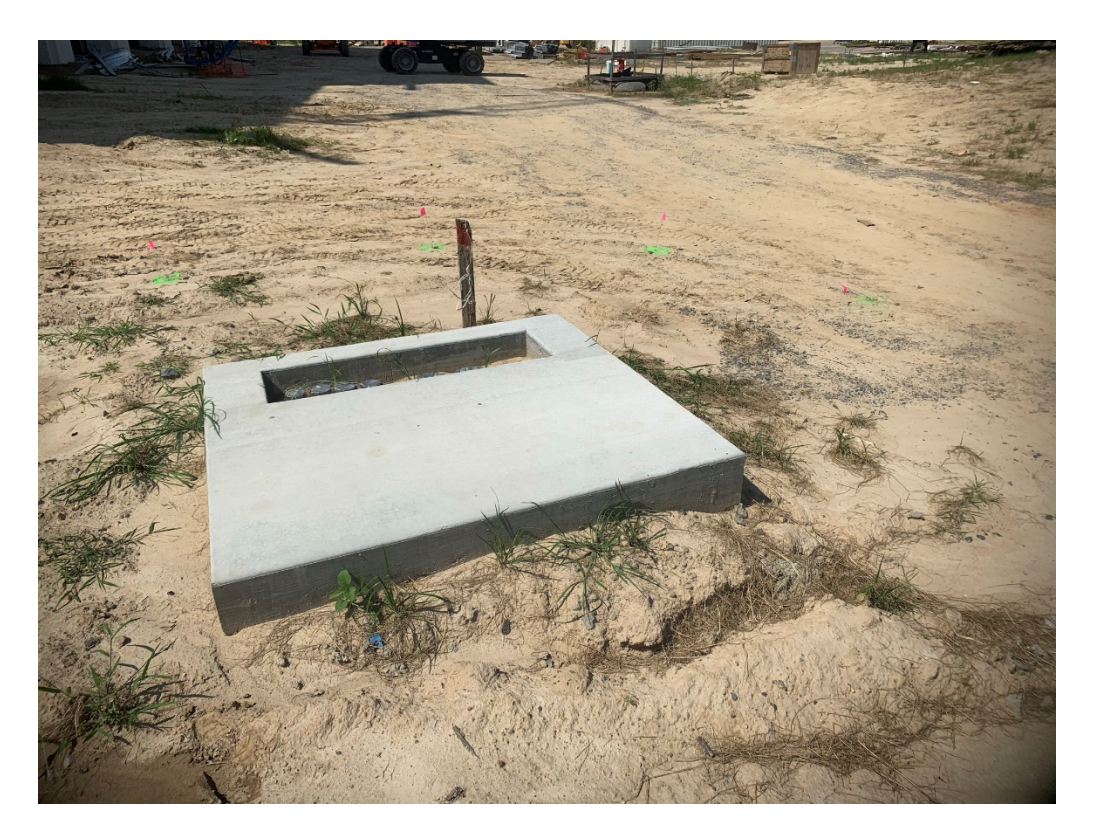
Figure 3 – Curb Marked Appears correct distance from Transformer Slab