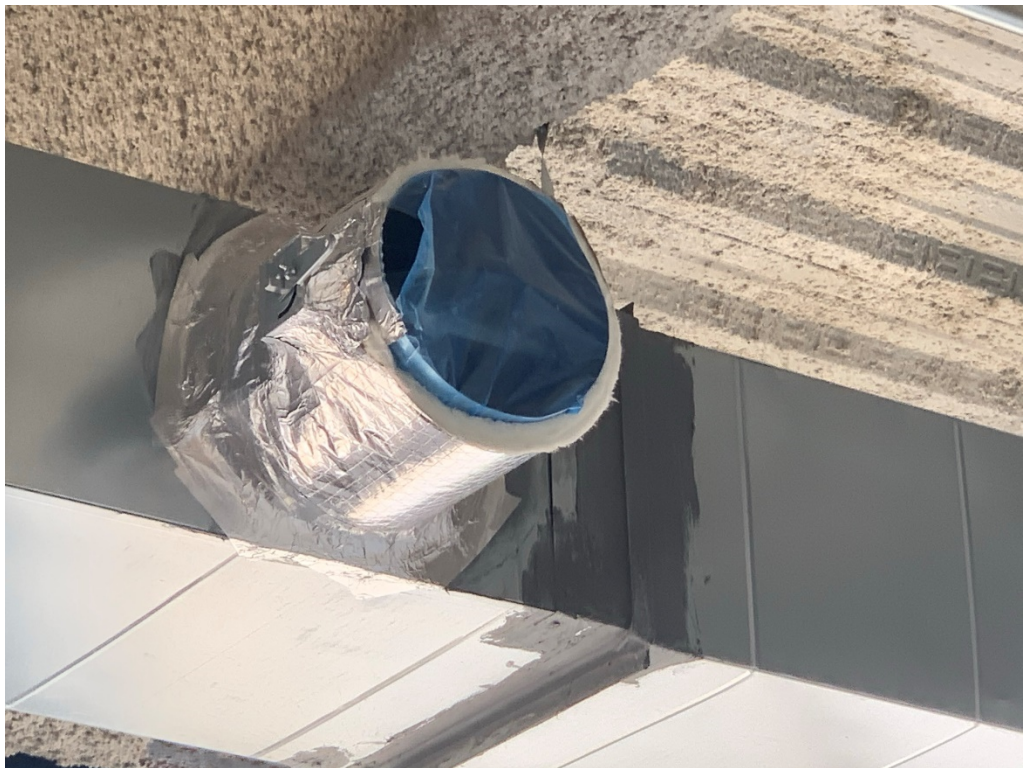
Figure 10 – Take care to seal all ducting per standards requirements