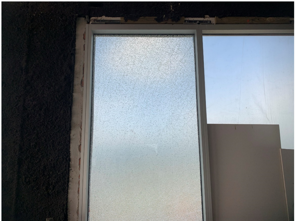
Figure 6 – Shatter Glass after install