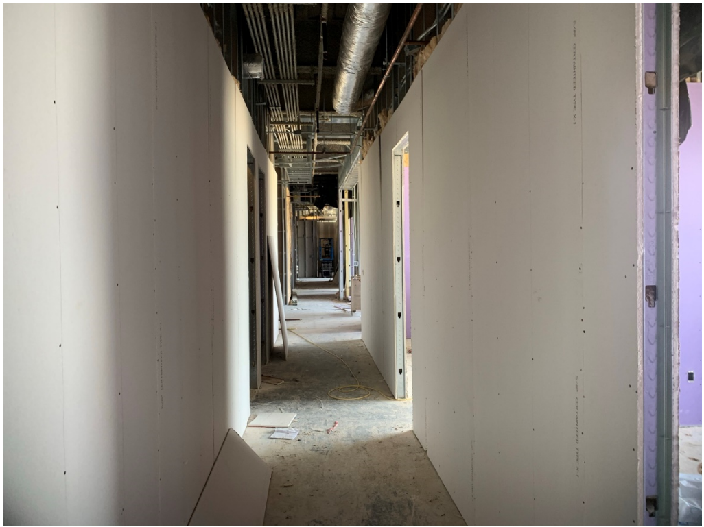
Figure 7 – Drywall Installation is Ongoing