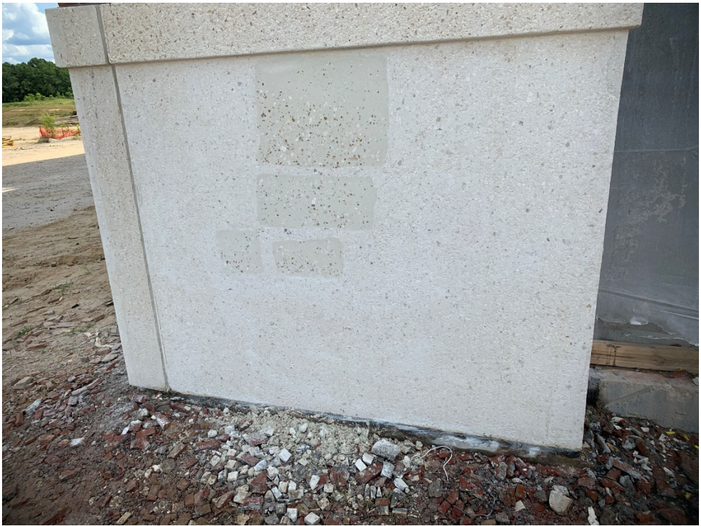
Figure 3 – Panel Repaired with custom mix to cure the same color (freshly installed)