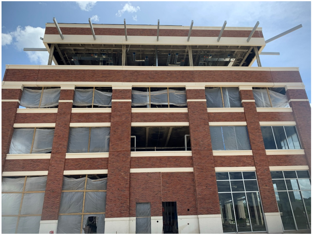
Figure 1 – Continued work on North elevation