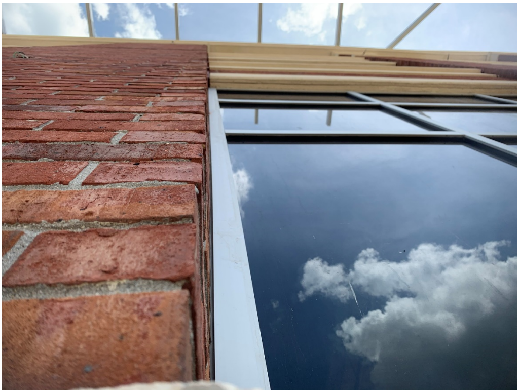
Figure 4 – Reworked Corner and storefront