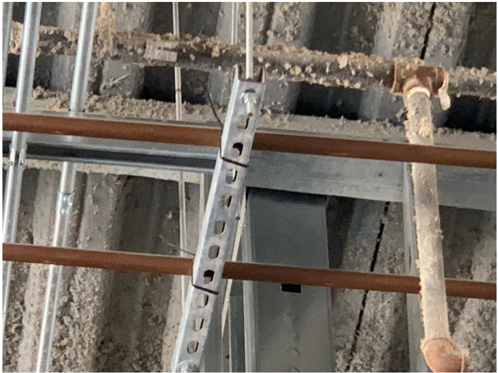
Figure 5 – Temporary Ties to be replaced