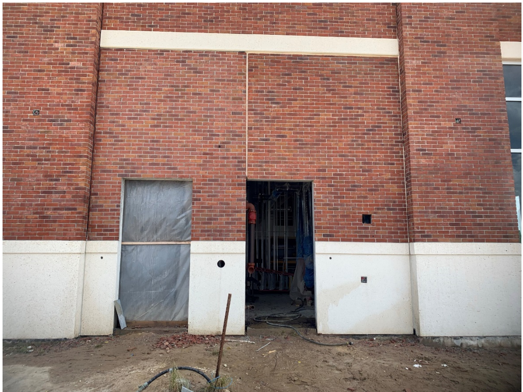
Figure 2 – Left Panel has Grout "stain" installed; brick color is lighter now and does not match