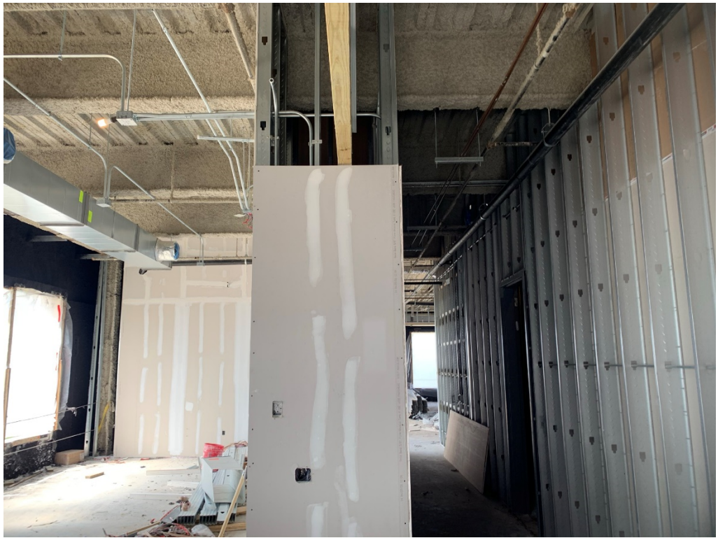
Figure 9 – Drywall Installation is Ongoing