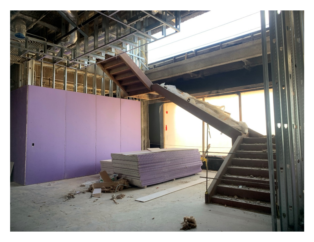
Figure 6 – Double Height Stair Space is Shaping Up