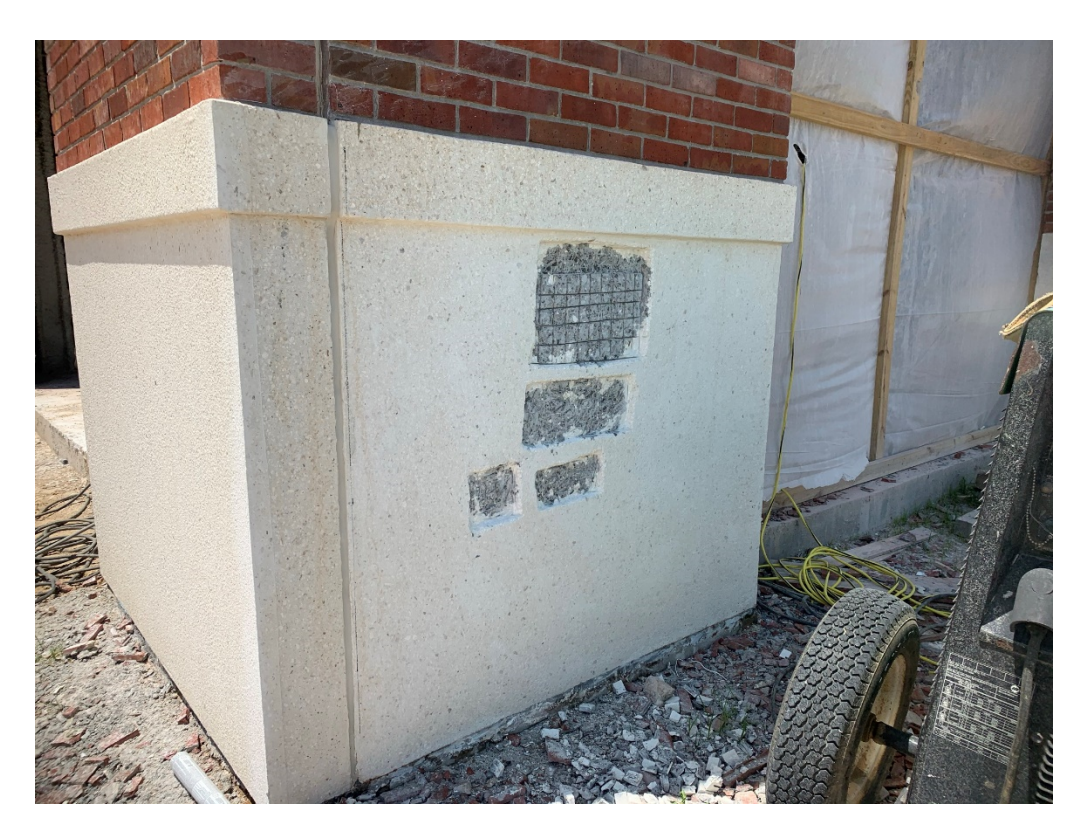
Figure 3 – Work at Precast Panel NE Corner