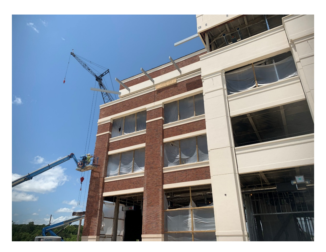
Figure 5 – SE Brick work at Corner