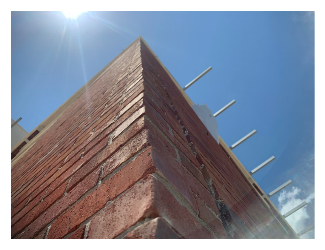
Figure 4 – NE Corner Brick Offset