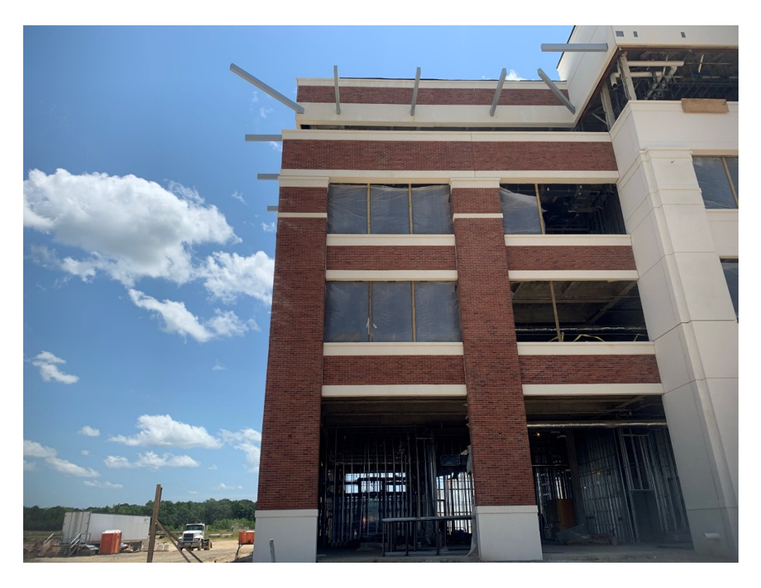
Figure 2 – NW Corner, reworked