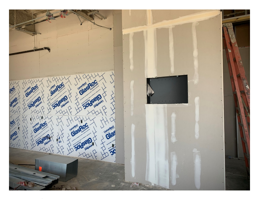
Figure 7 – 3^{rd} Floor Break Room; GlasRoc installed at cabinet wall