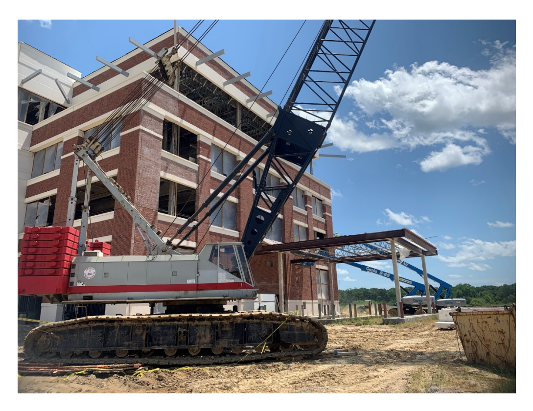
Figure 1 – Continued work on south elevation