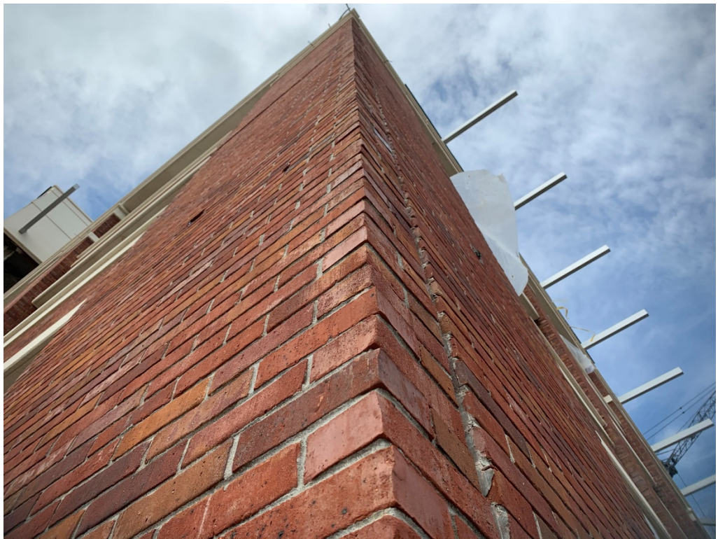
Figure 2 – NE Corner, reworked