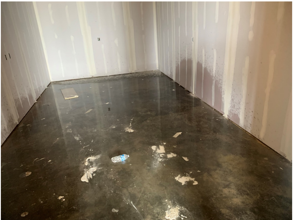
Figure 8 – Standing Water in 3 rd Floor Room