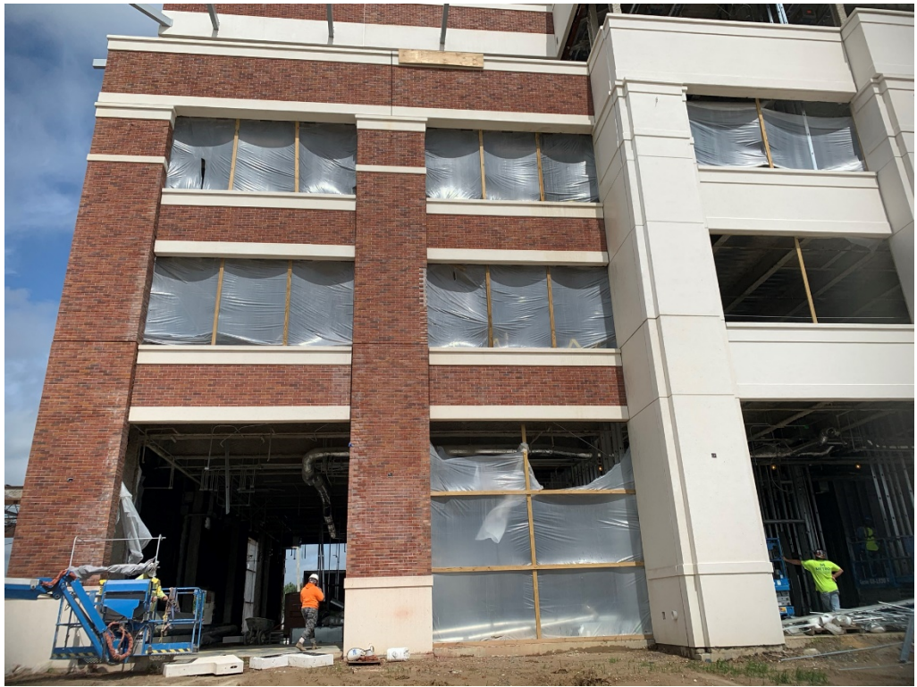
Figure 3 – West Façade; white column at right of image slated for future rework