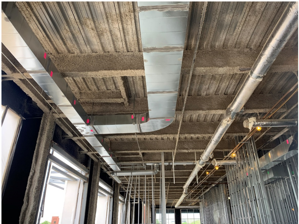
Figure 4 – Ongoing Duct Installation at 1 st Floor