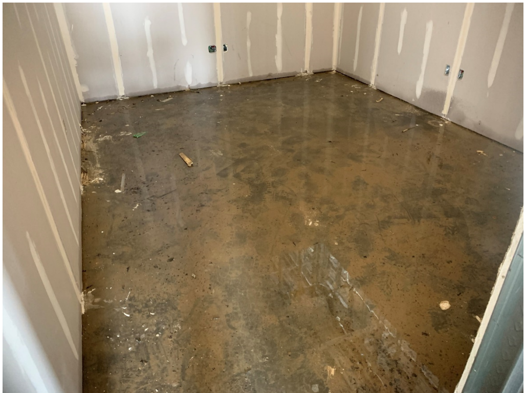
Figure 10 – Standing Water in 3 rd Floor Room