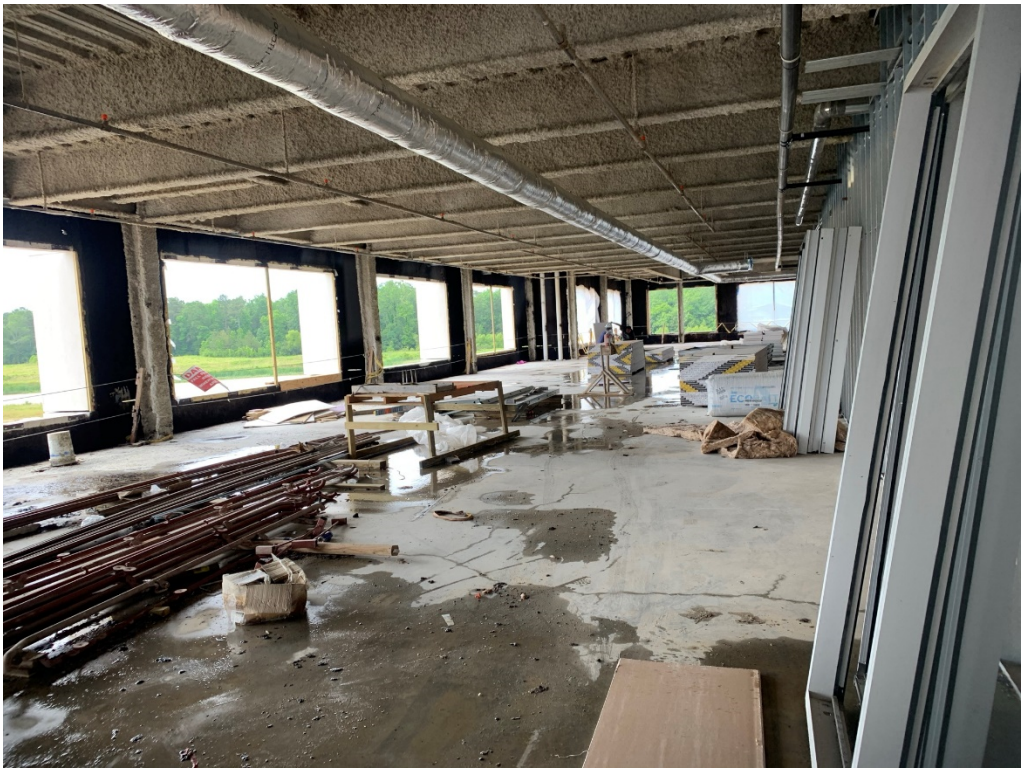
Figure 7 – 2 nd Floor Staging