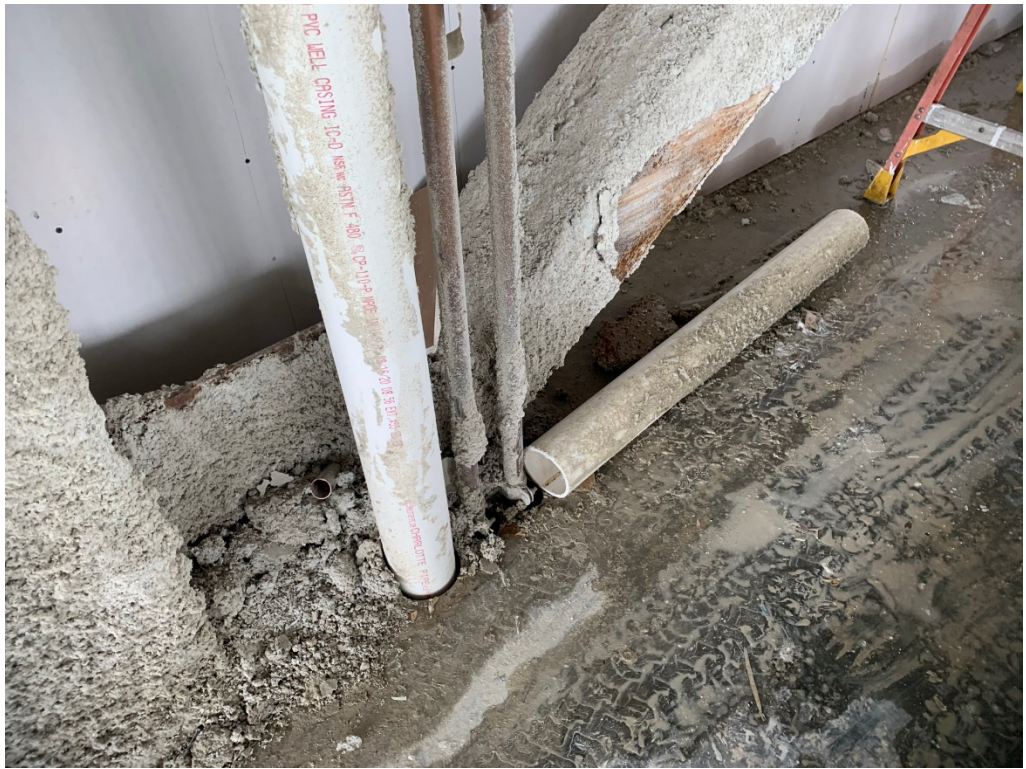
Figure 9 – Damaged Fire Insulation