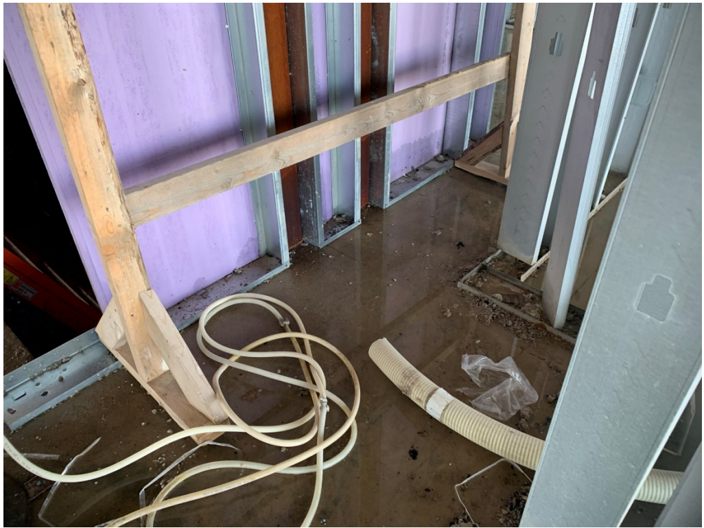
Figure 5 – Standing Water at First Floor