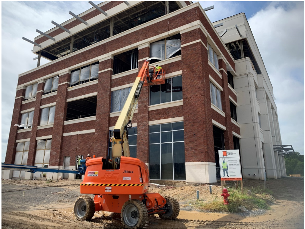
Figure 1 – North Elevation Progress at Panel Rework