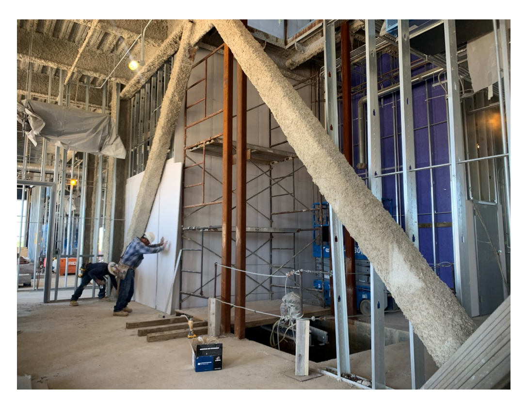
Figure 5 – First Floor Drywall Install at Elevator Shaft