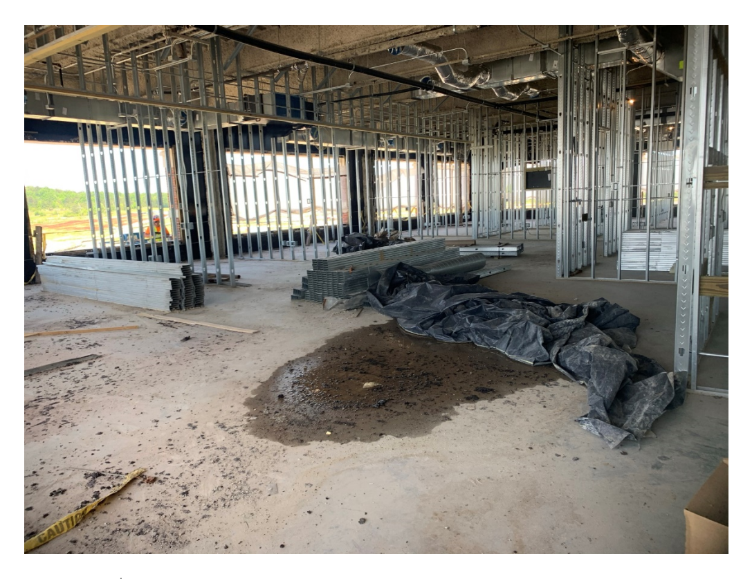
Figure 6 – 3<sup>rd</sup> Floor Progress