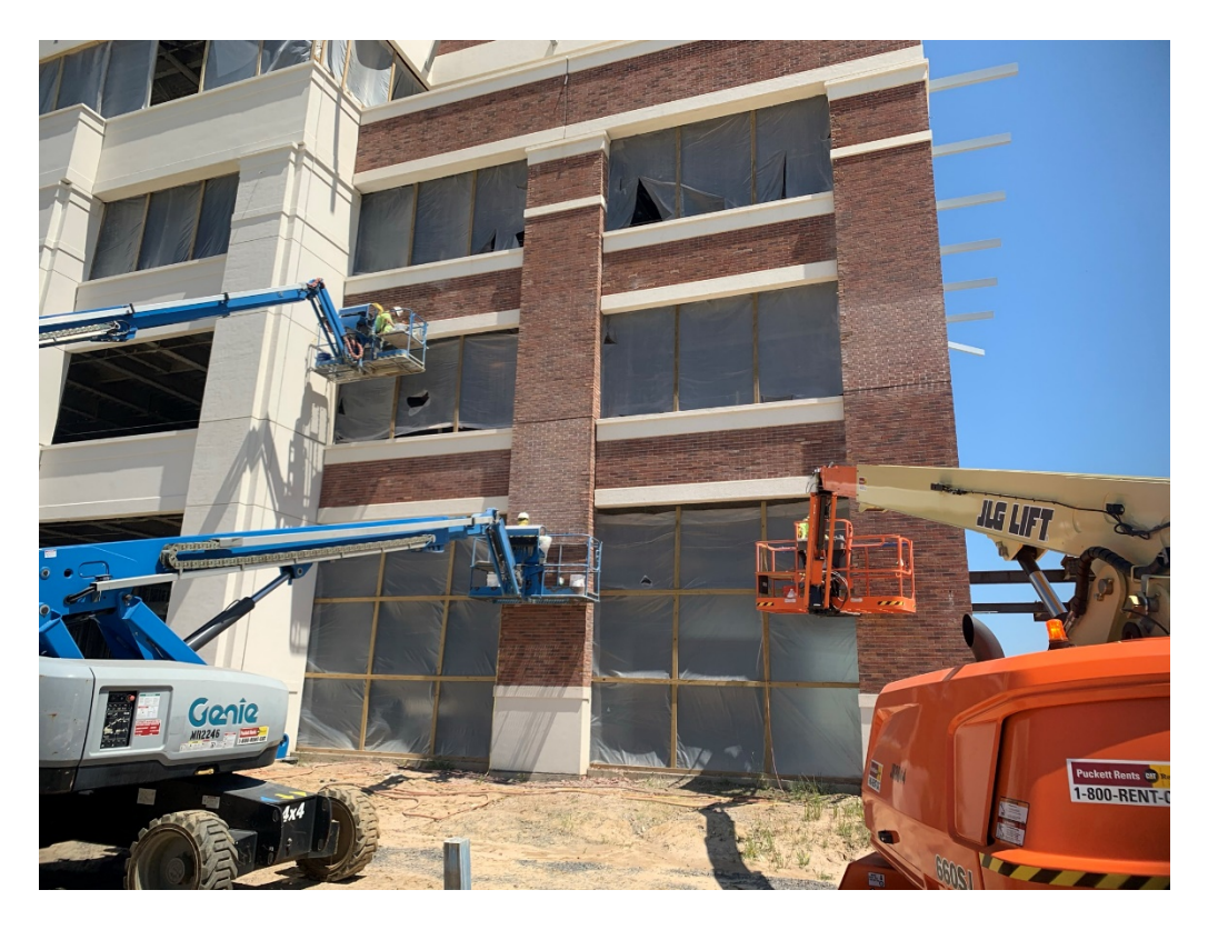
Figure 2 – Masons Reworking Brick