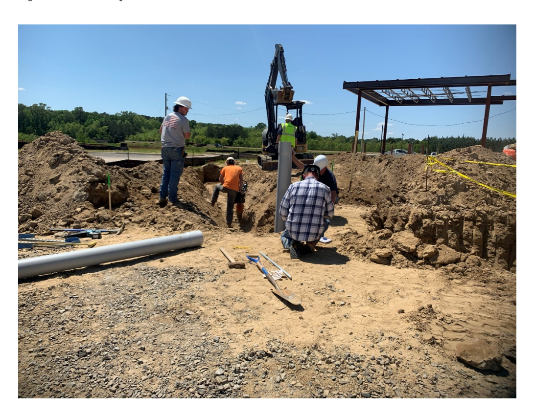
Figure 4 – Underground Electrical Work