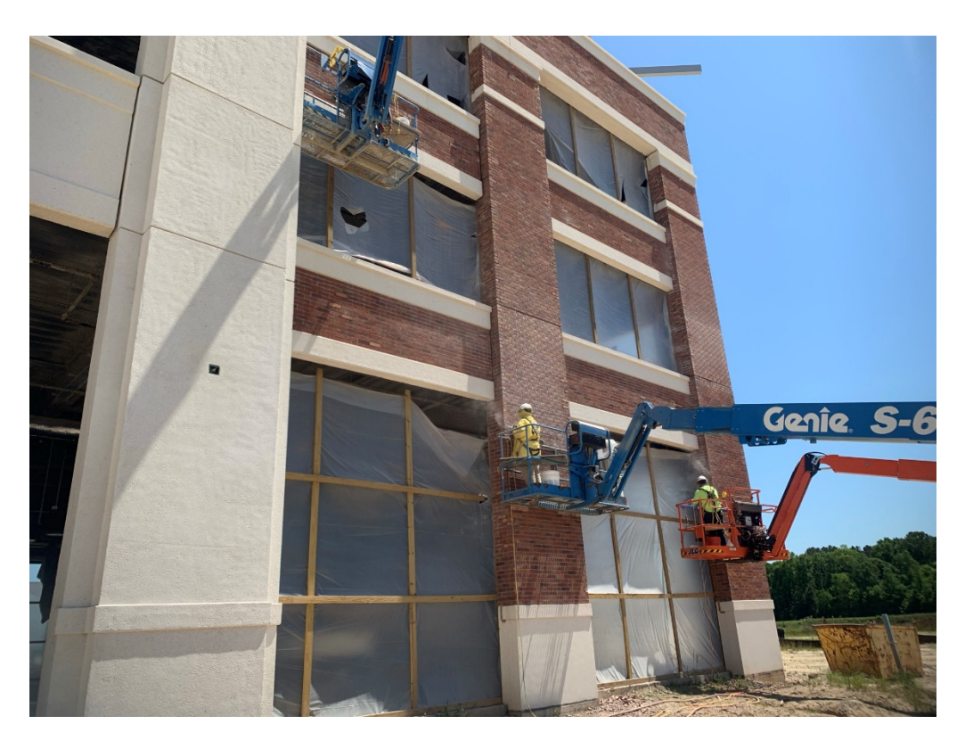
Figure 1 – Masons Reworking Brick