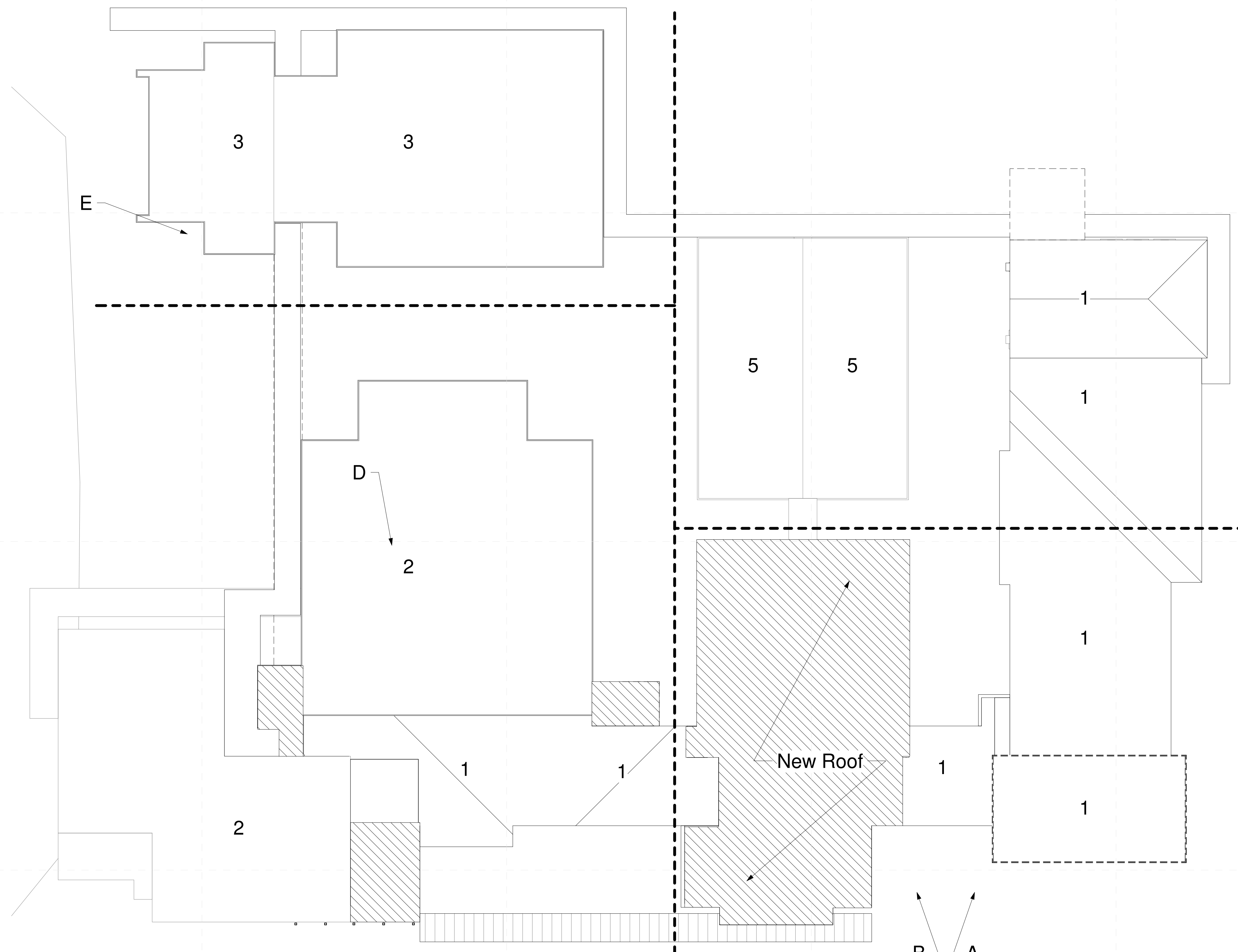
1 Roof Plan - Thomas Edwards 1" = 20'-0"